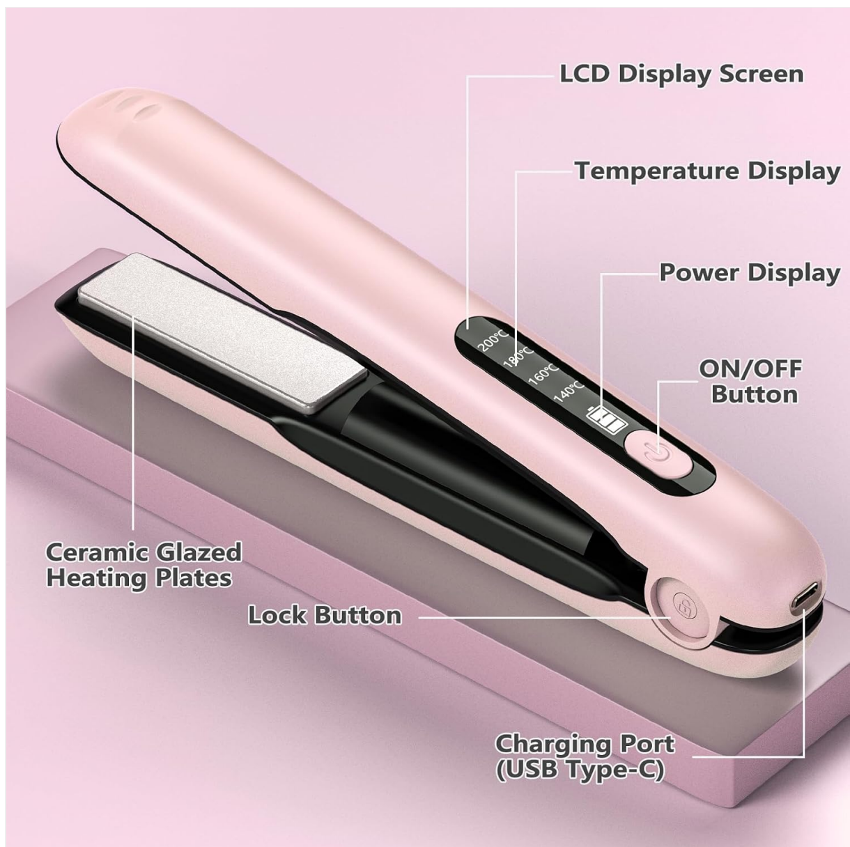
Image 4.1: Labeled diagram of the HOMELYLIFE Cordless Hair Straightener's key features.

Familiarize yourself with the components of your HOMELYLIFE Cordless Hair Straightener and Curler: