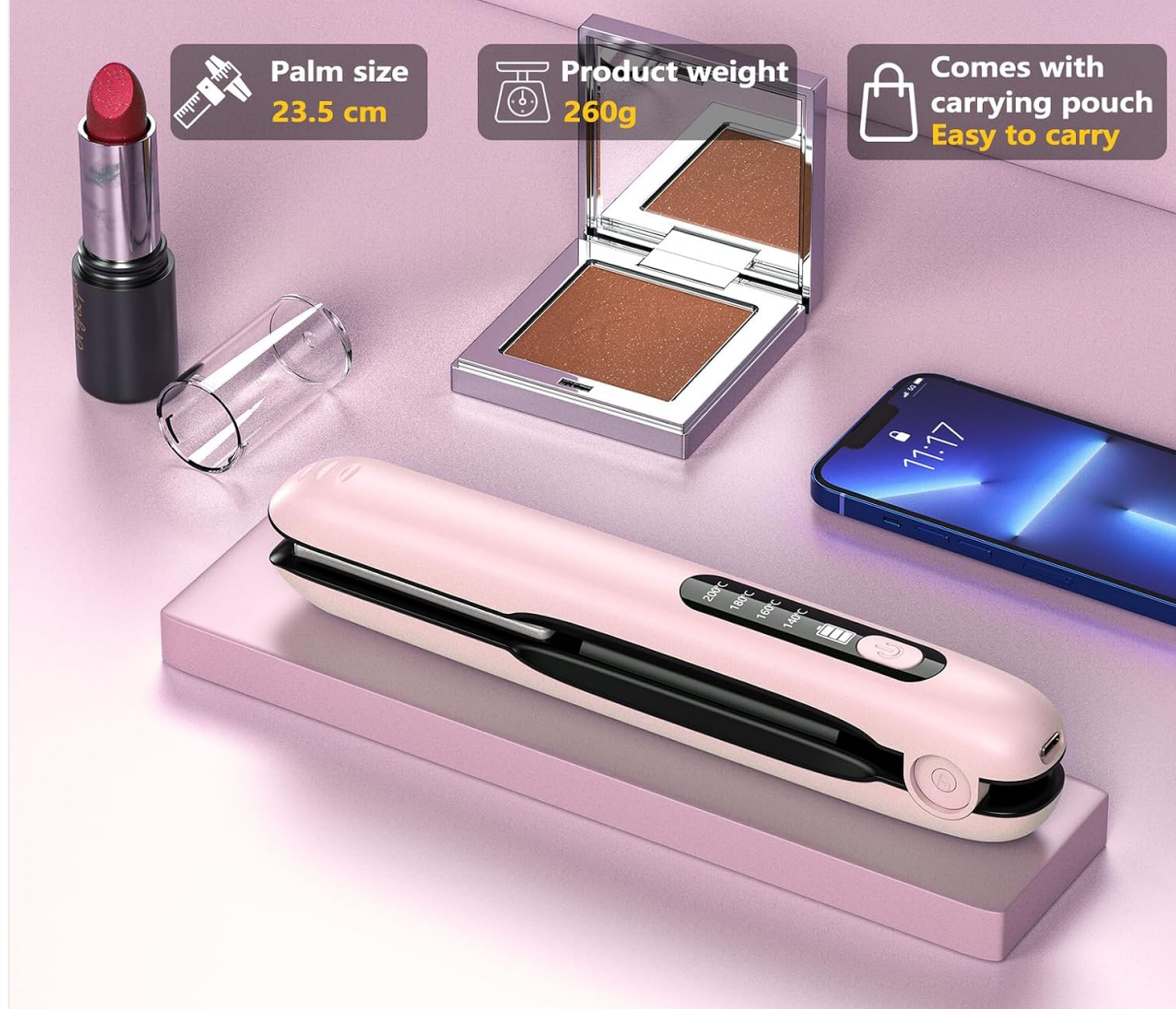
Image 1.1: The HOMELYLIFE Cordless Hair Straightener, showcasing its compact size and portability for travel.