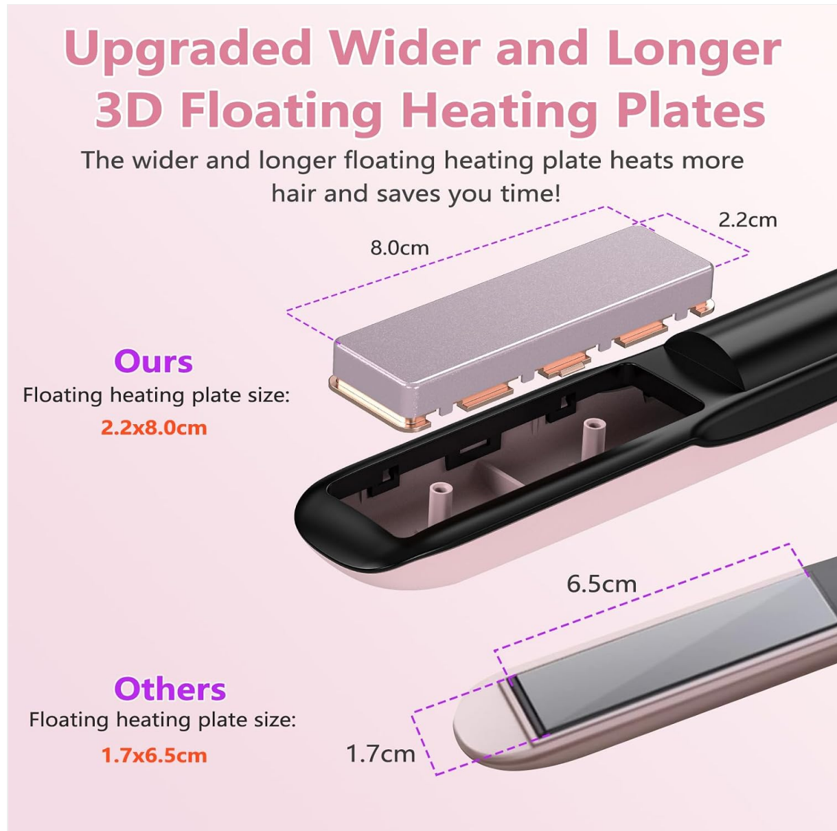
Image 4.2: Illustration of the wider and longer 3D floating heating plates for improved styling efficiency.

The device features upgraded wider and longer 3D floating heating plates, measuring 2.2cm x 8.0cm, which allow for more efficient styling by covering a larger hair section per pass.