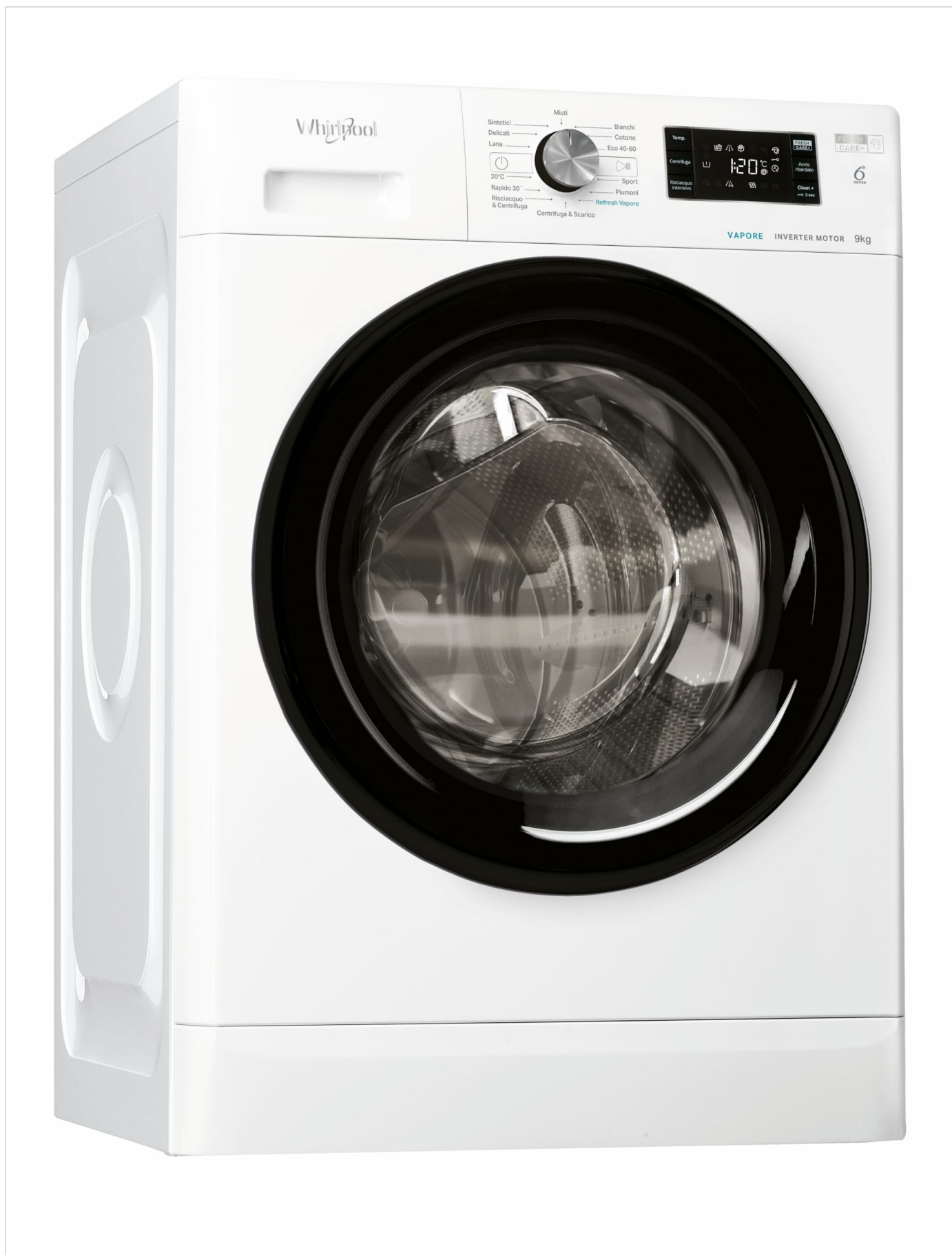
Figure 1: Front view of the Whirlpool FFB D96 BV IT washing machine.