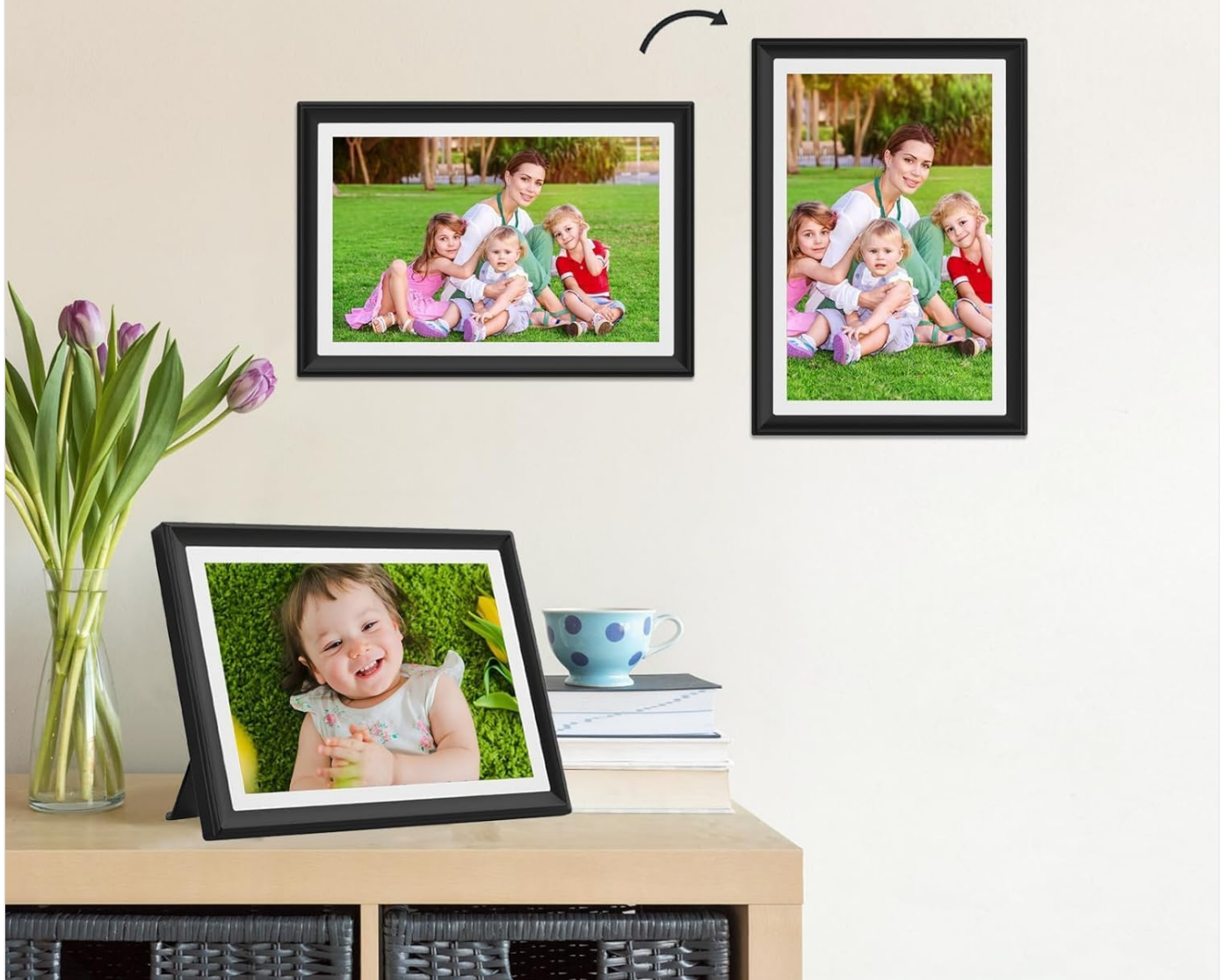
Image: The frame can be used freestanding or wall-mounted, with automatic rotation.