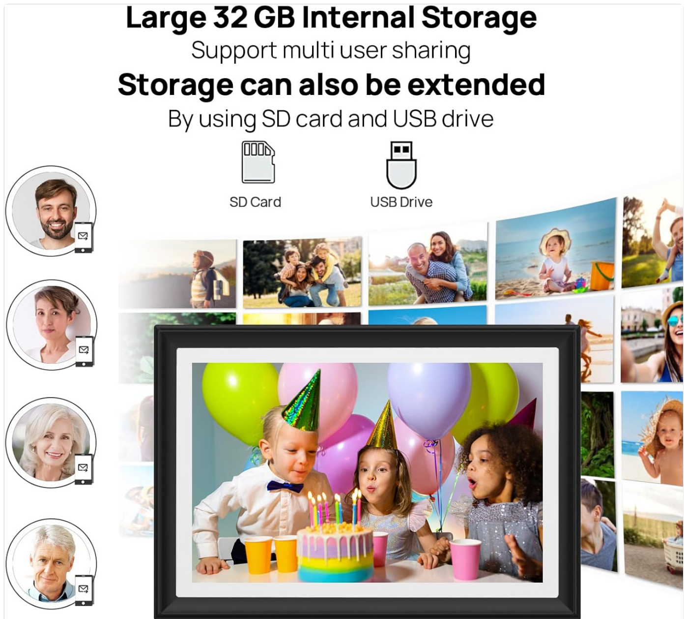
Image: The frame's storage capabilities, including 32GB internal memory and support for SD cards and USB drives.

You can manage files between internal storage and external storage via the 'Files' or 'Album' section on the frame's interface.