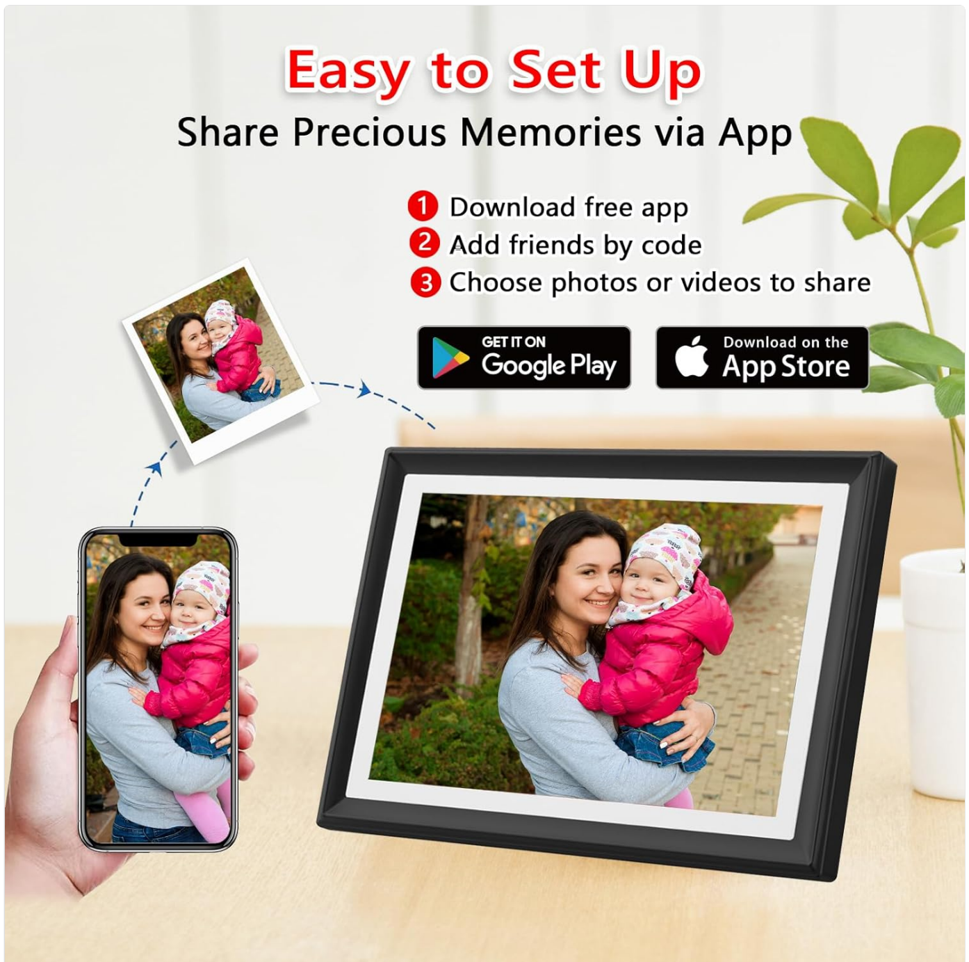
Image: Easy setup process for the digital picture frame.