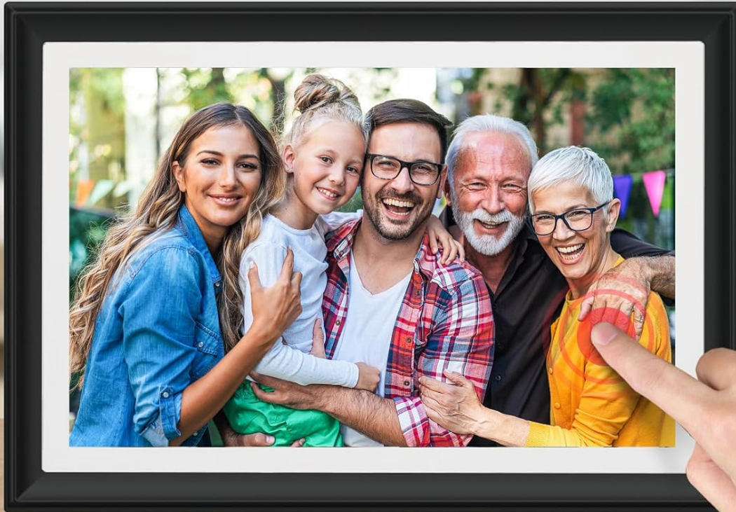
Image: The 10.1-inch IPS HD Touch Screen with 1280x800 resolution and 16:10 aspect ratio.