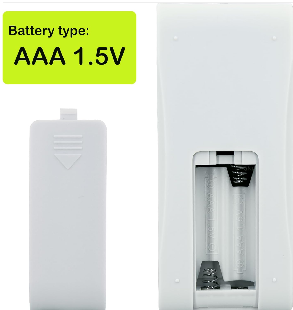
Image 4.1: The open battery compartment, showing the slots for two AAA 1.5V batteries.