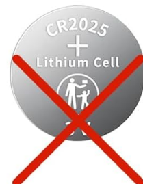
Image 8.1: This image highlights the extended battery life provided by AAA 1.5V batteries compared to coin cell batteries, emphasizing the remote's efficient design.