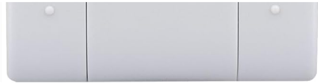
Image 4.2: Rear view of the remote control, indicating the location of the battery compartment cover.

Note: Always use fresh batteries and replace both batteries at the same time. Do not mix old and new batteries or different types of batteries.