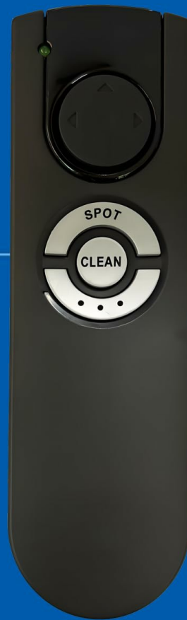
Image 1.1: Front view of the XINJISHIMIN Replacement Remote Control. This image displays the remote's compact design and button layout.