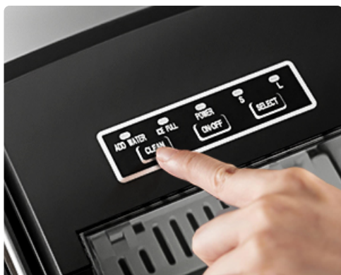
Activate "Clean" Button