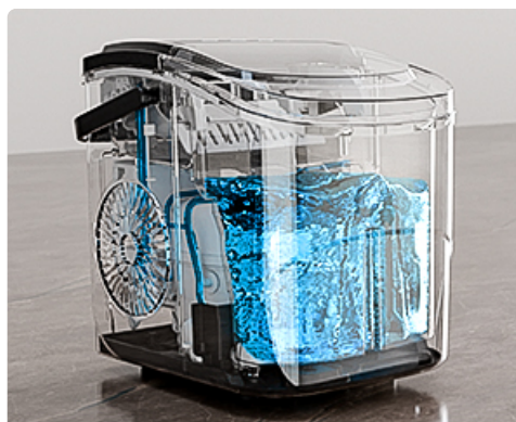
Perform Self-cleaning Cycle Mode