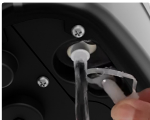
Remove Cleaned Sewage