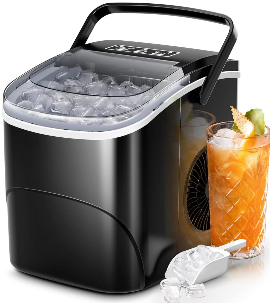
Image: The Electactic Countertop Ice Maker, showcasing its sleek black design, clear lid filled with bullet ice, and an accompanying glass of iced beverage.