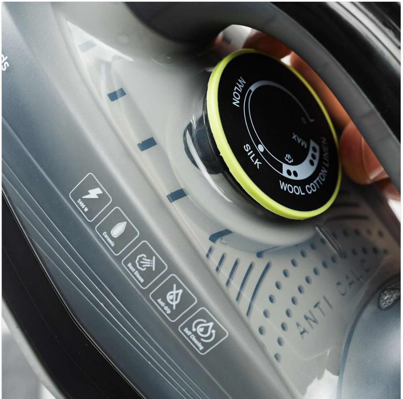
Image: A detailed view of the temperature control dial, highlighting the various fabric settings for precise ironing.