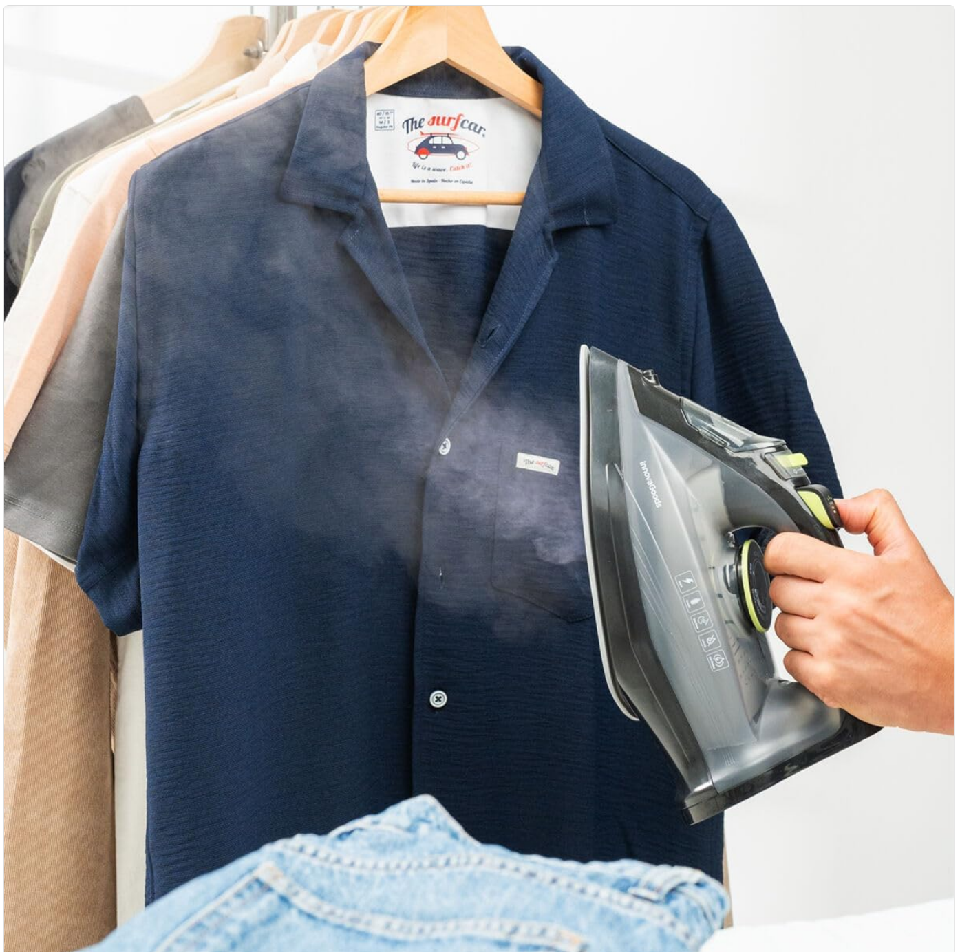
Image: The InnovaGoods Stiron iron being used in vertical steam mode on a hanging shirt, effectively removing creases.