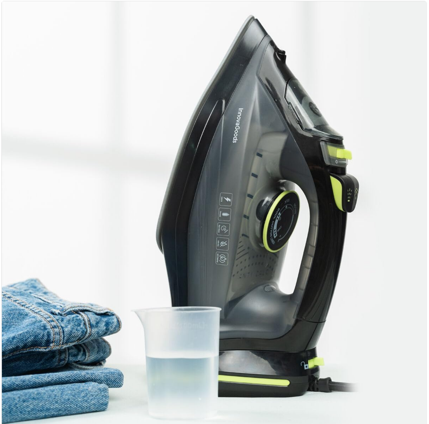
Image: The InnovaGoods Stiron iron positioned next to a measuring cup, illustrating the water filling process.