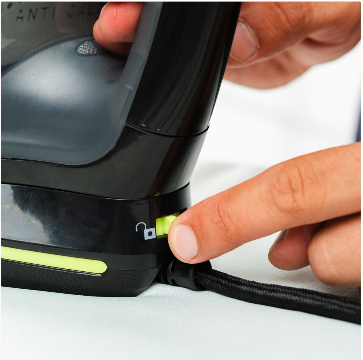
Image: A close-up view of the cord lock/release button on the iron's base, demonstrating how to switch between cordless and corded modes.