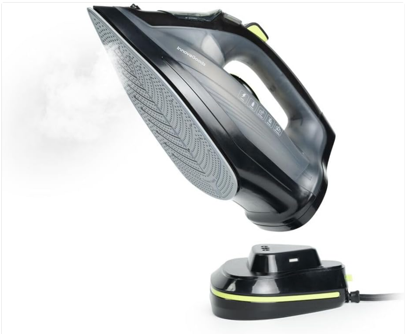
Image: The InnovaGoods Stiron iron detached from its charging base, emitting steam, showcasing its cordless capability.