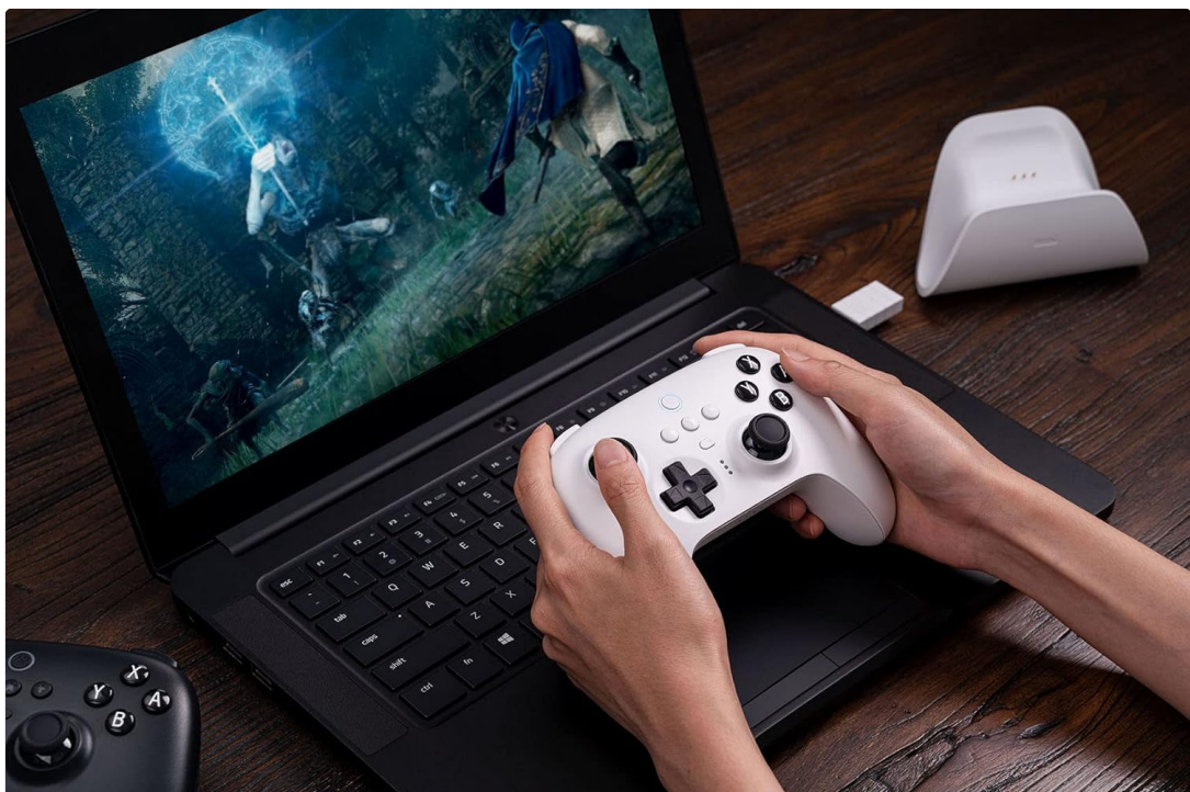
Image: A person's hands holding the white 8Bitdo Ultimate Bluetooth Controller while playing a game on a black laptop. The charging dock is visible in the background.