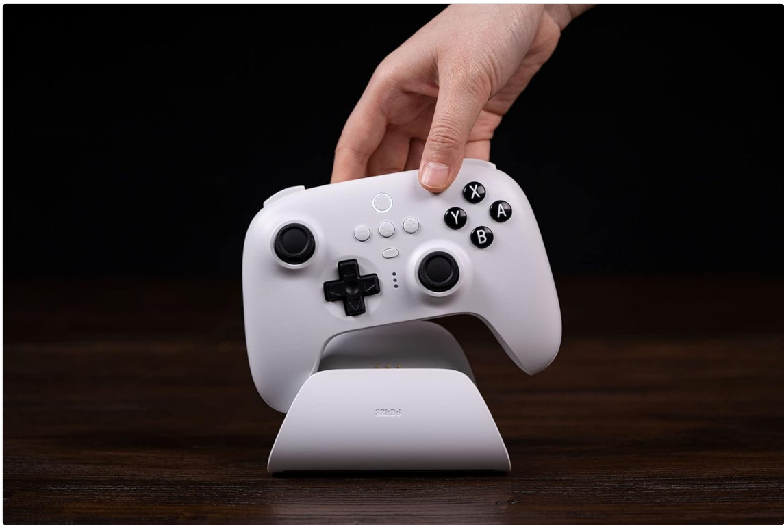
Image: A hand gently placing the white 8Bitdo Ultimate Bluetooth Controller onto its matching white charging dock, which rests on a wooden surface.