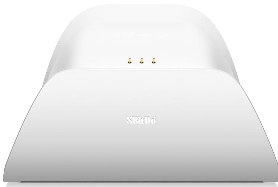
Image: The charging dock for the 8Bitdo Ultimate Bluetooth Controller, shown with the 2.4G wireless adapter removed from its storage slot.