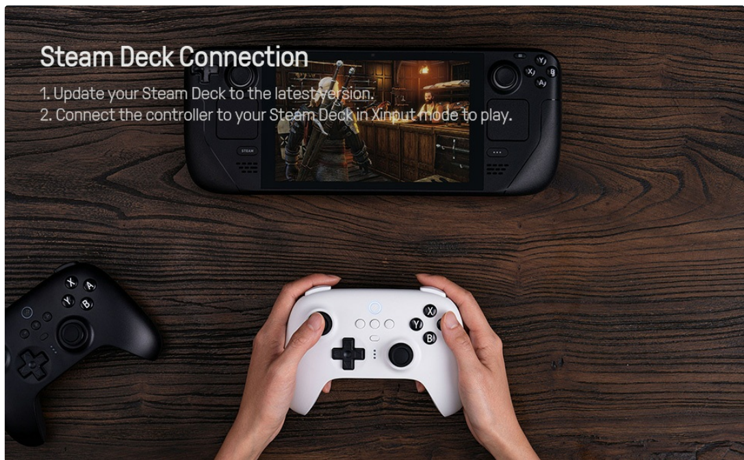
Image: A white 8Bitdo Ultimate Bluetooth Controller being held by hands, connected to a Steam Deck displaying a game. A black 8Bitdo controller is also visible in the foreground.