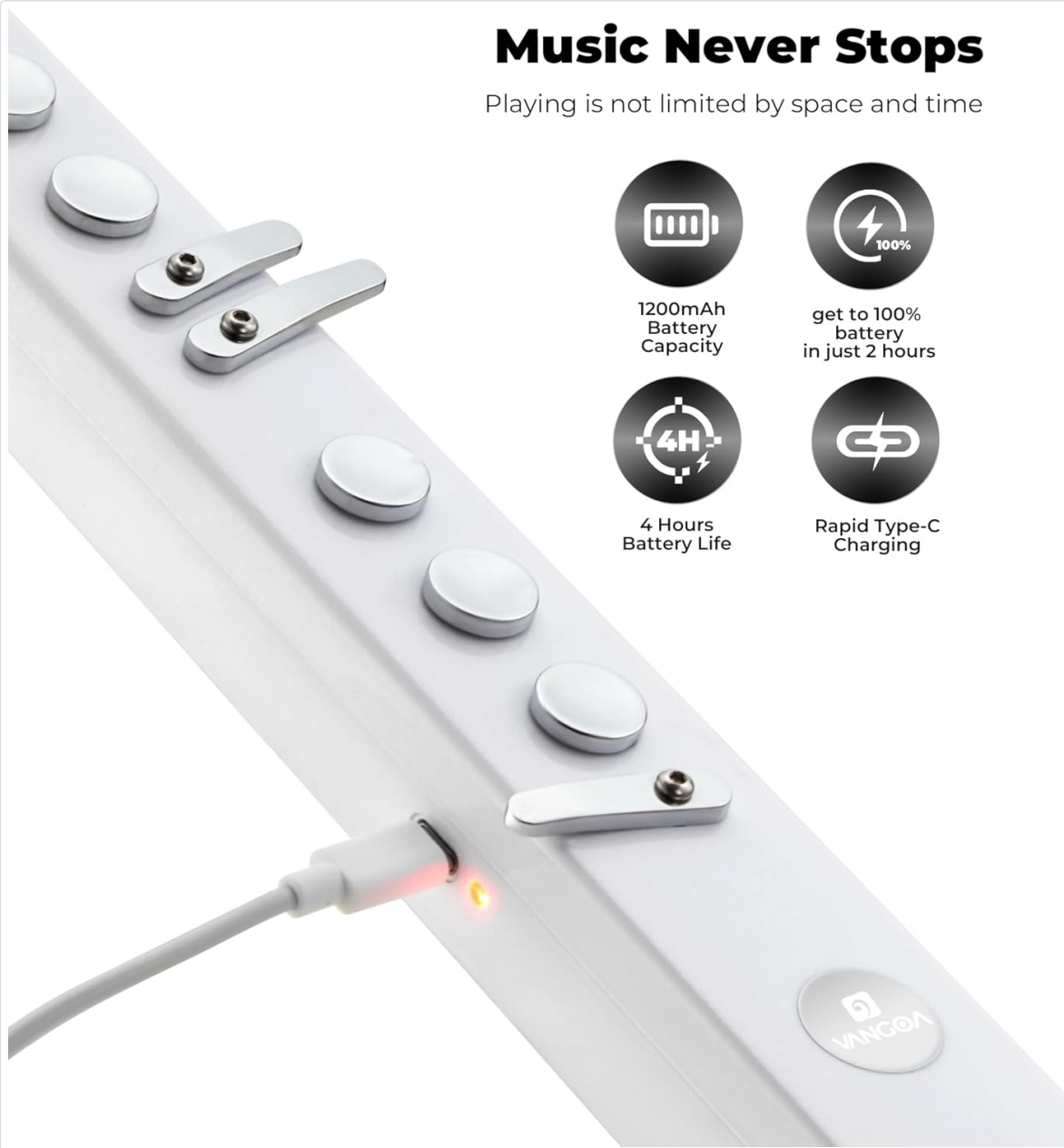
Image: The Vangoa MAE-02 instrument connected to a USB-C cable for charging, with a red indicator light visible.

Playing is not limited by space and time