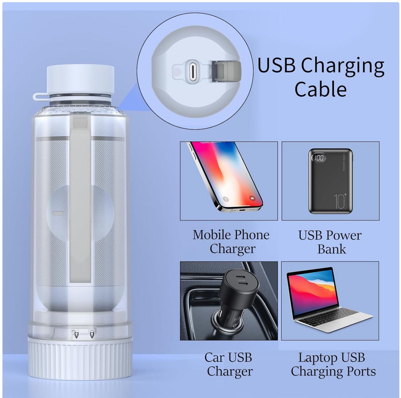
Image: An illustration showing the USB charging cable and various compatible charging sources, including a mobile phone charger, a USB power bank, a car USB charger, and a laptop USB charging port. This highlights the versatility of charging options.