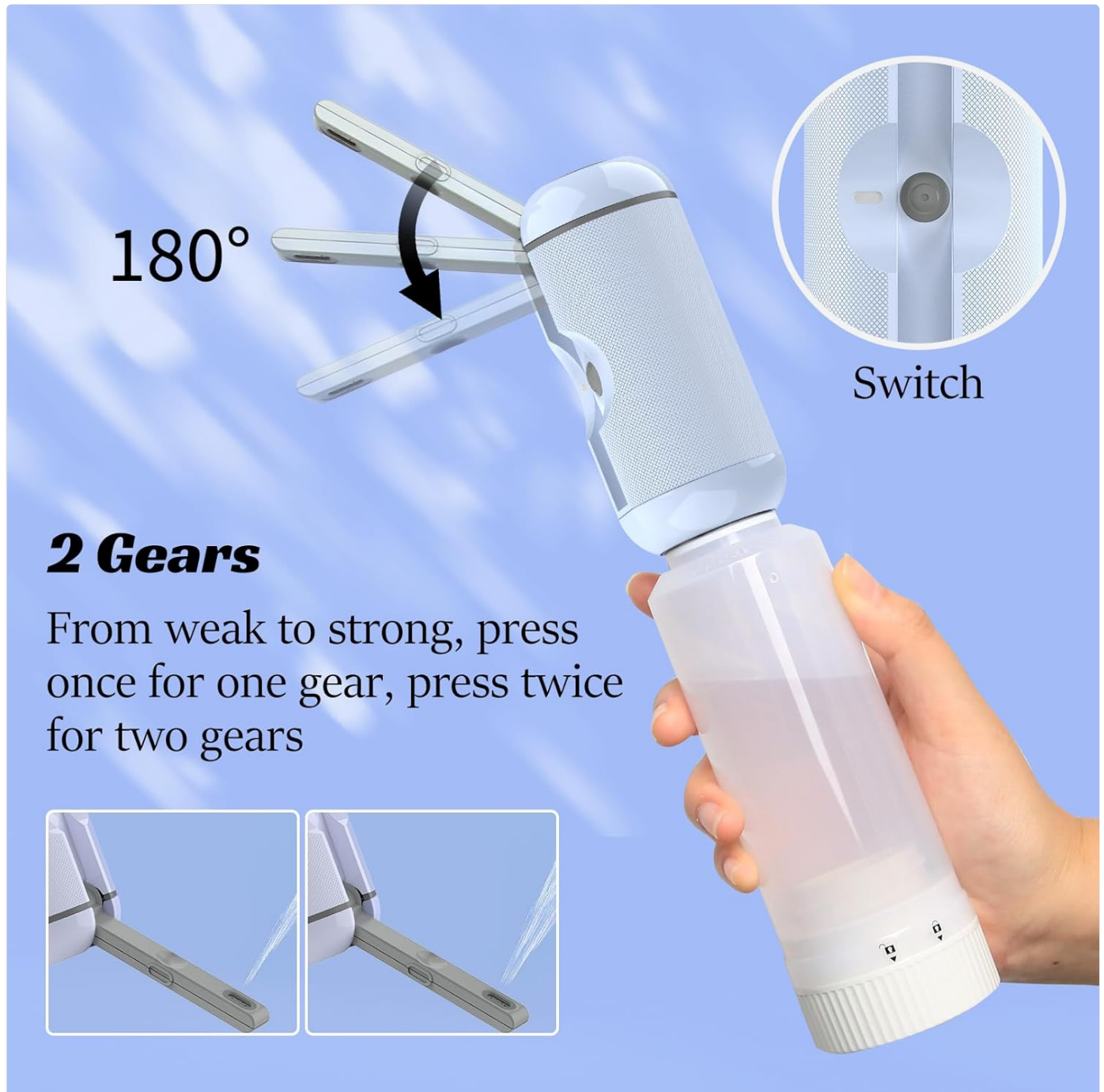
Image: The bidet unit demonstrating its 180-degree adjustable nozzle. Insets show the two different spray strengths (weak and strong) available by pressing the switch.