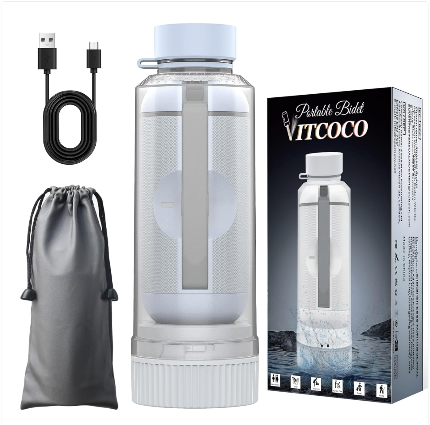
Image: A detailed view of the VITCOCO Portable Travel Bidet, showcasing the main unit, the transparent water bottle, the USB charging cable, and the soft carrying pouch. This illustrates all items included in the package.