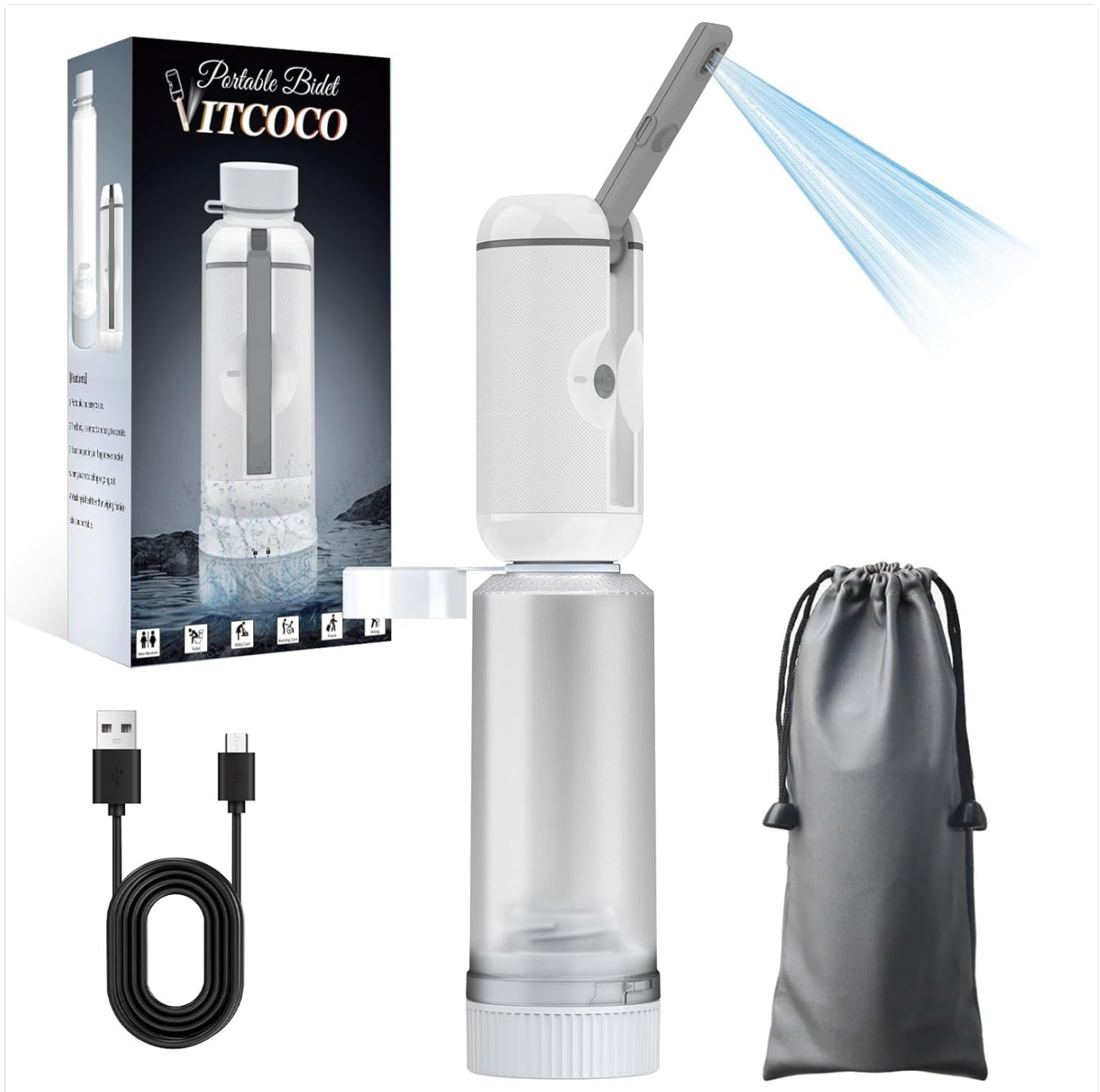
Image: The VITCOCO Portable Travel Bidet, shown with its retail packaging, USB charging cable, and a grey carrying pouch. The bidet itself is white and transparent, demonstrating its compact design.