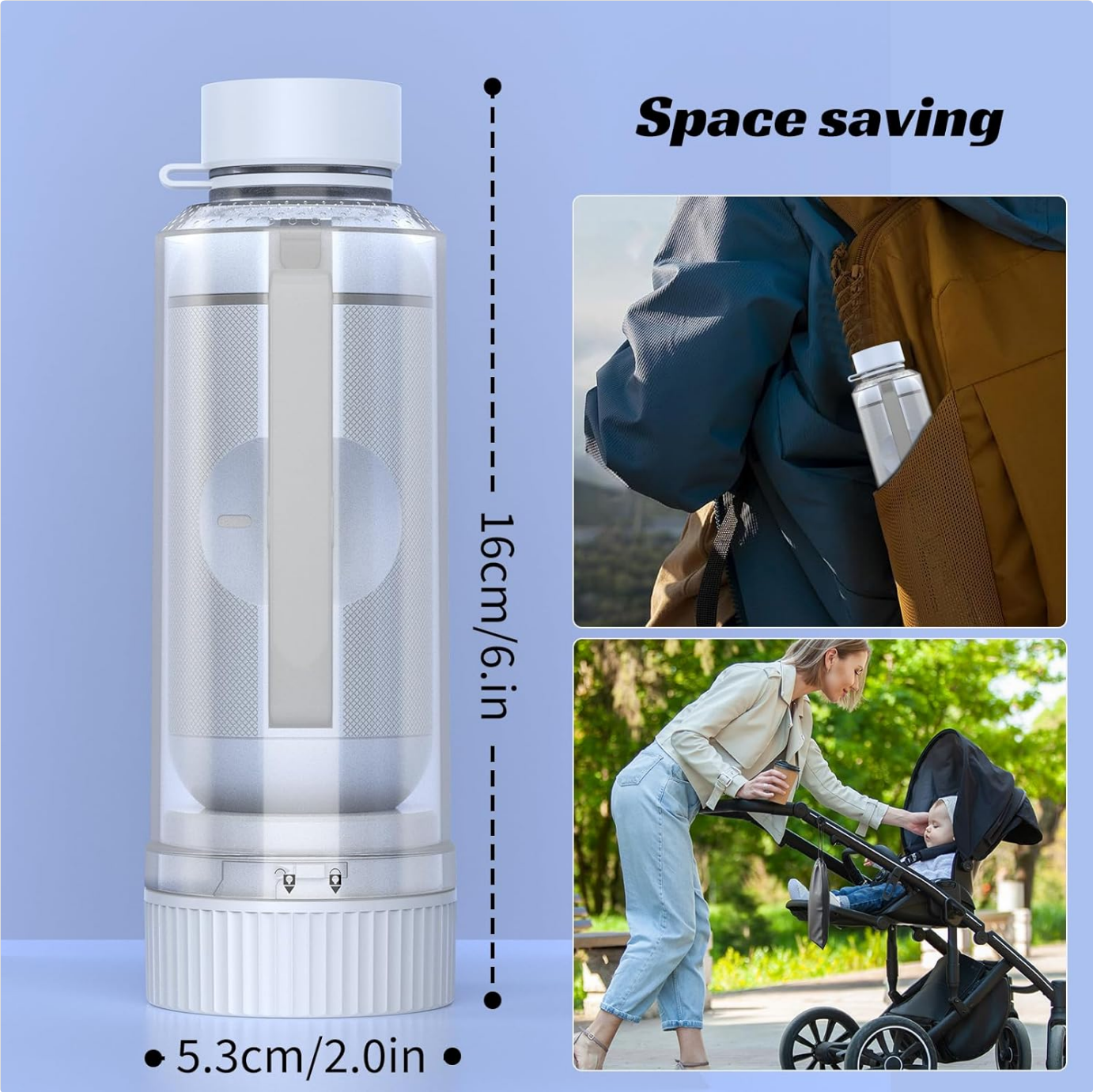
Image: The portable bidet shown with its dimensions (16cm/6.in height, 5.3cm/2.0in diameter) and examples of how it can be stored compactly in a backpack or carried with a stroller, highlighting its space-saving design.