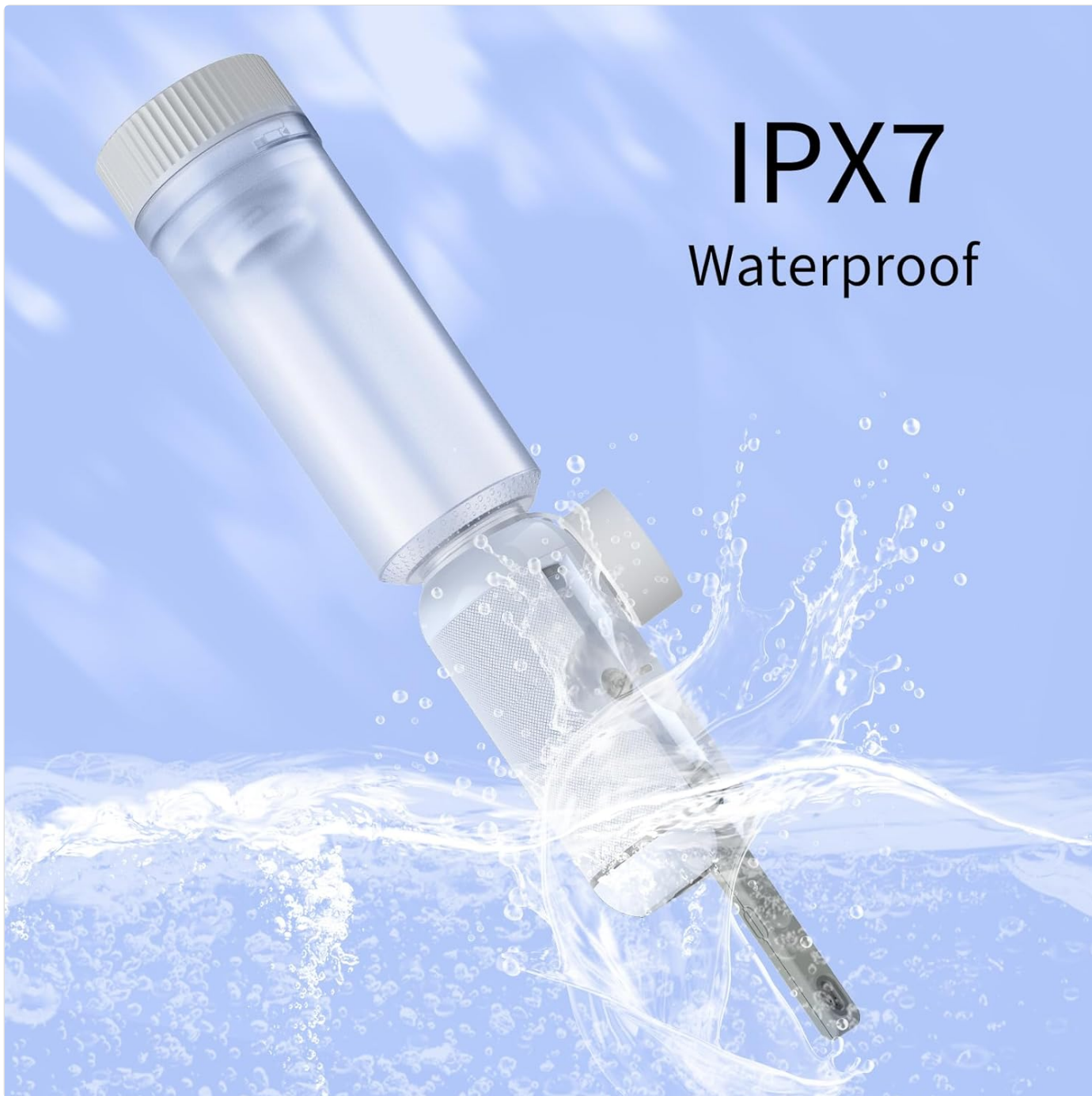
Image: The VITCOCO Portable Travel Bidet partially submerged in water, illustrating its IPX7 waterproof rating, which allows for easy cleaning.