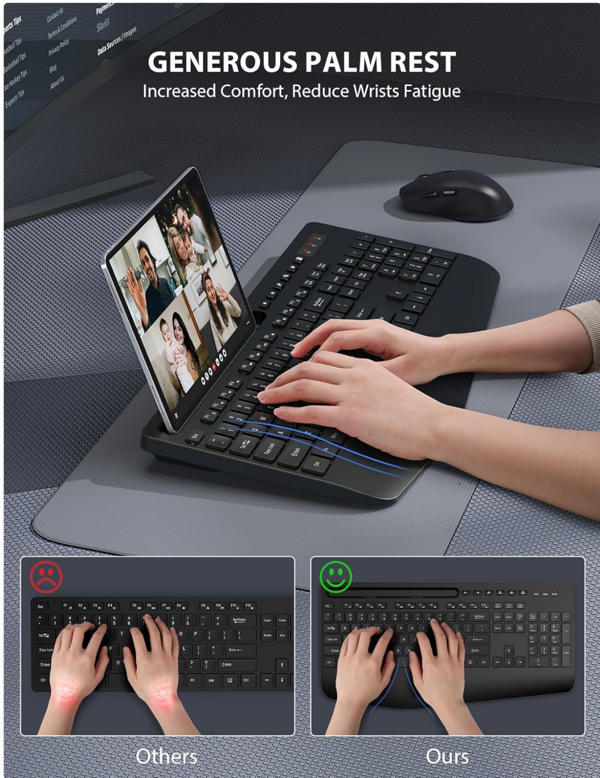
Image 3.1: Keyboard with a tablet securely placed in the integrated holder.