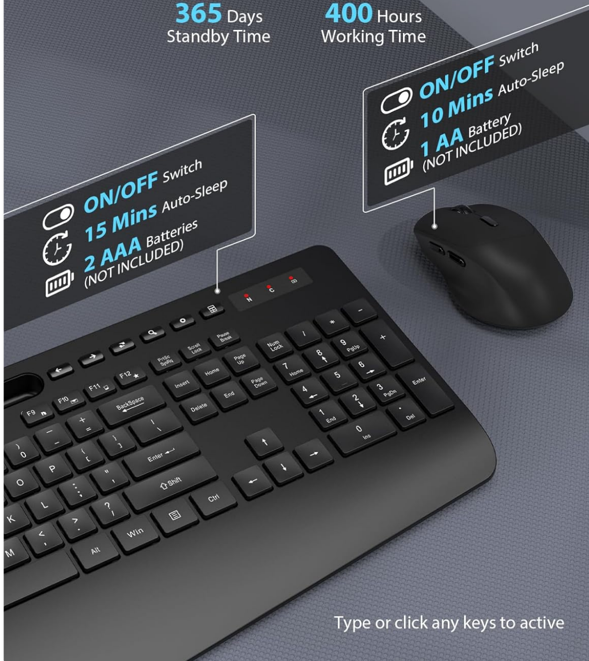
Image 3.3: Ergonomic design of the keyboard and mouse for comfortable use.