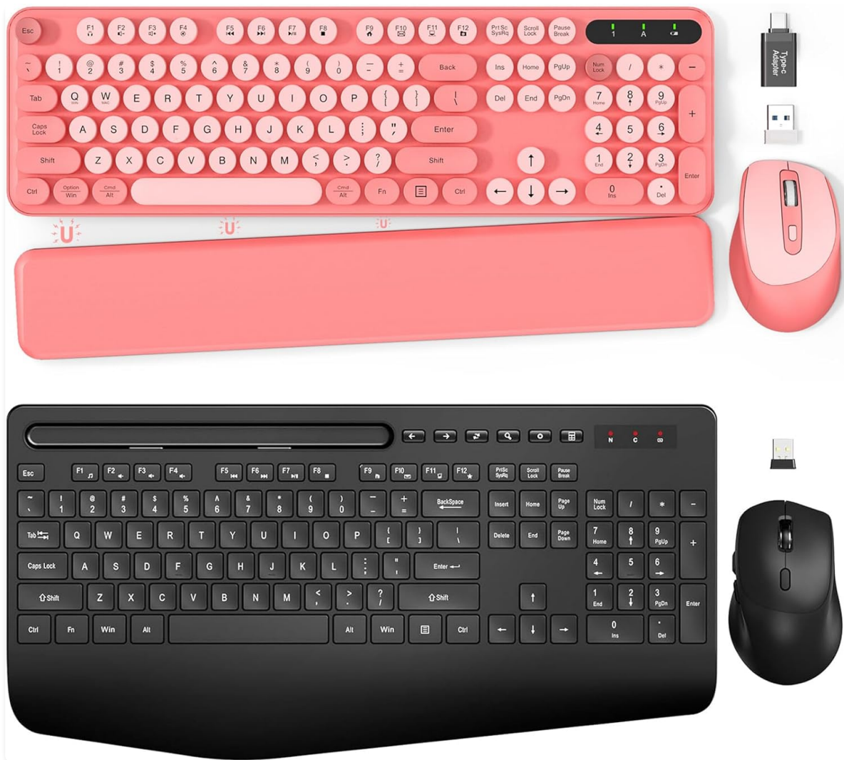
Image 1.1: Overview of the Trueque Wireless Keyboard and Mouse Combo (Pink version).