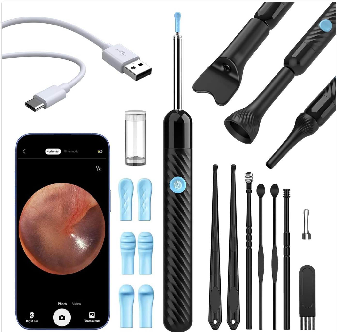
Image: The VITCOCO Ear Wax Removal Tool Camera with its various accessories, including ear spoons, inspection kits, and charging cable, alongside a smartphone displaying the camera's view of an ear canal.