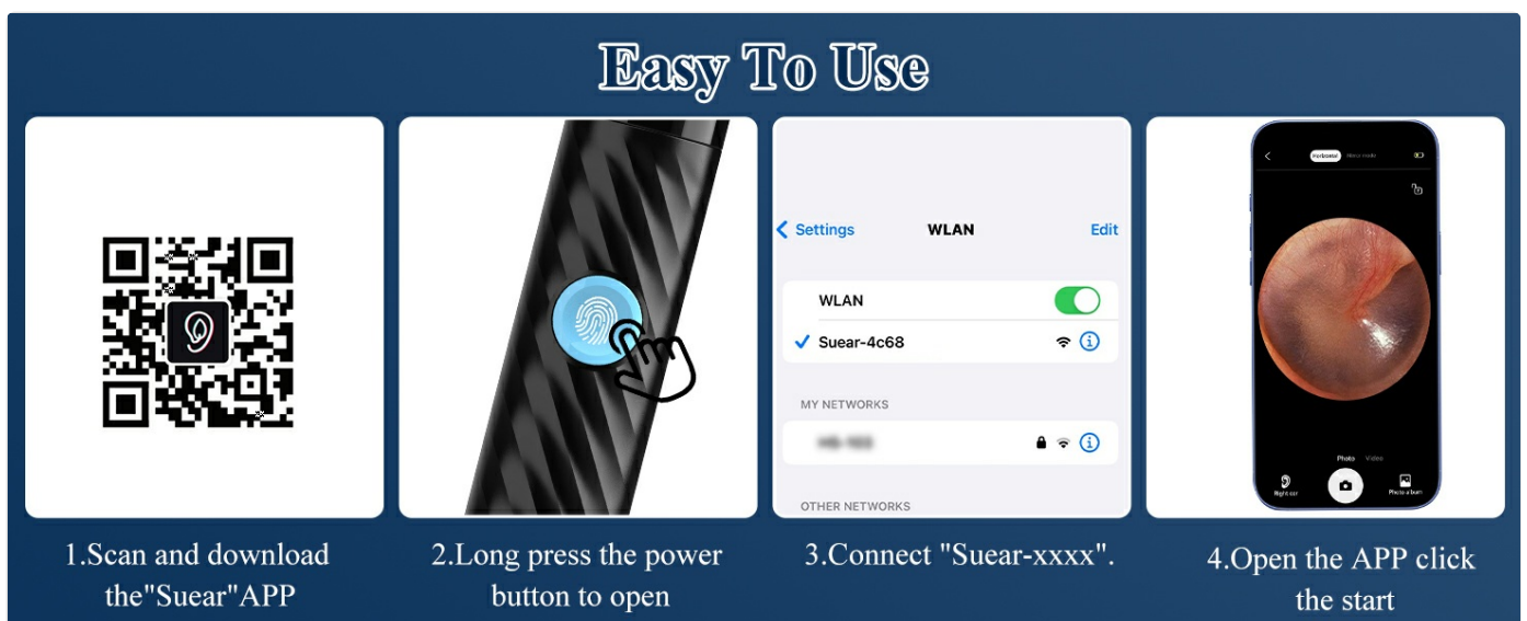
Image: A step-by-step visual guide demonstrating how to set up the device, including scanning the QR code for the app, powering on, connecting to Wi-Fi, and opening the application to view the camera feed.