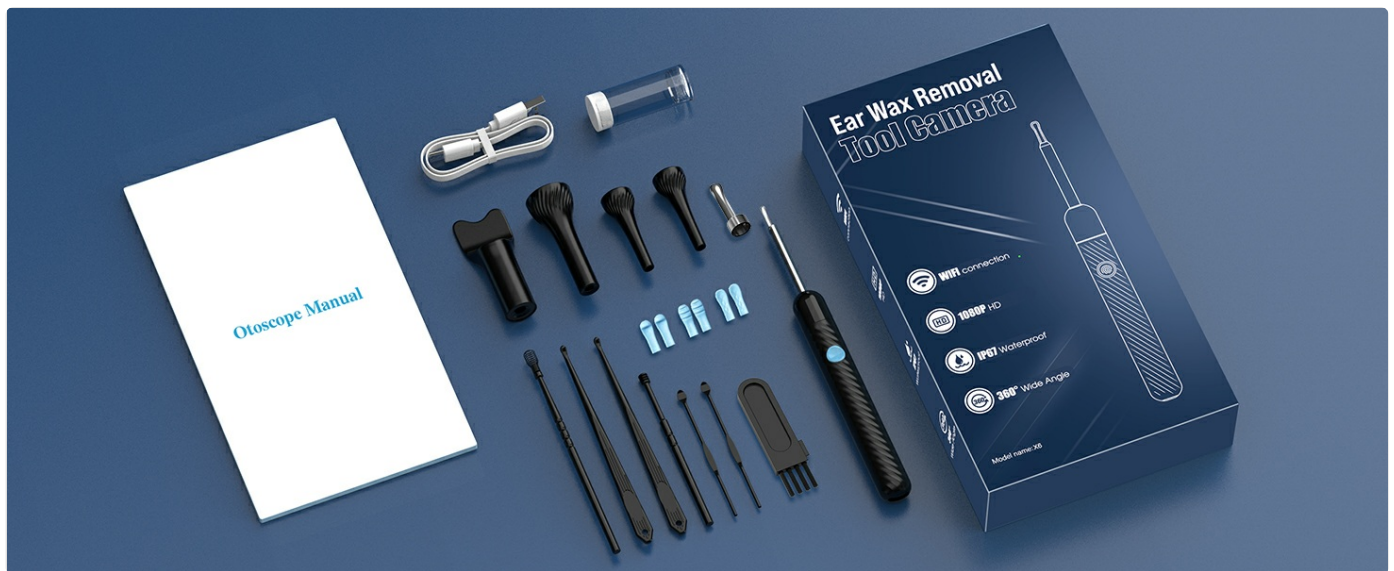
Image: A comprehensive view of the VITCOCO Ear Wax Removal Tool Camera and all its included accessories, neatly arranged alongside the product packaging and user manual.