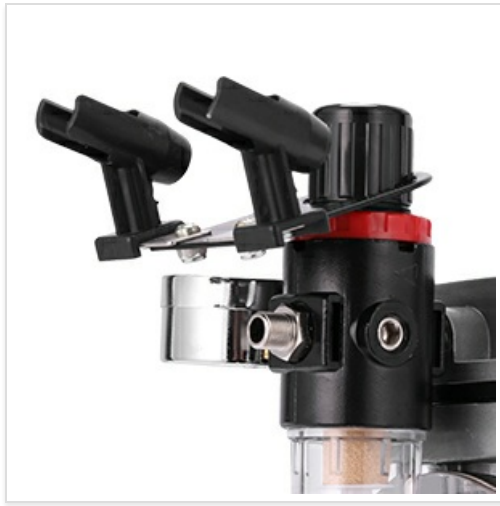
Close-up of the airbrush holder and pressure regulator with moisture trap.