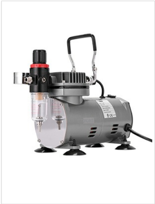
The 1/5 HP air compressor, featuring a pressure gauge and regulator.