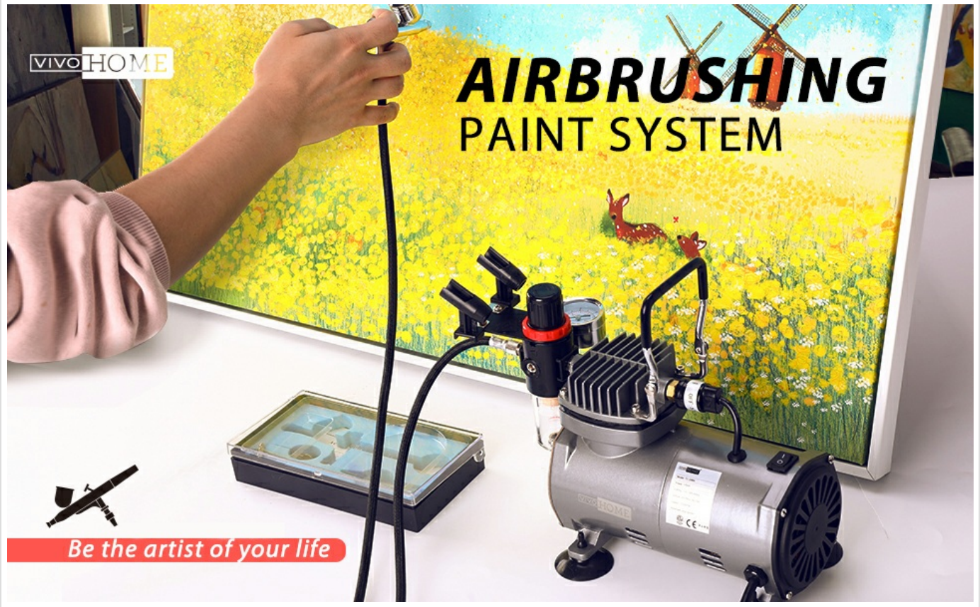
Overall view of the VIVOHOME Airbrush Kit, showing the compressor, airbrush, and hose connections.