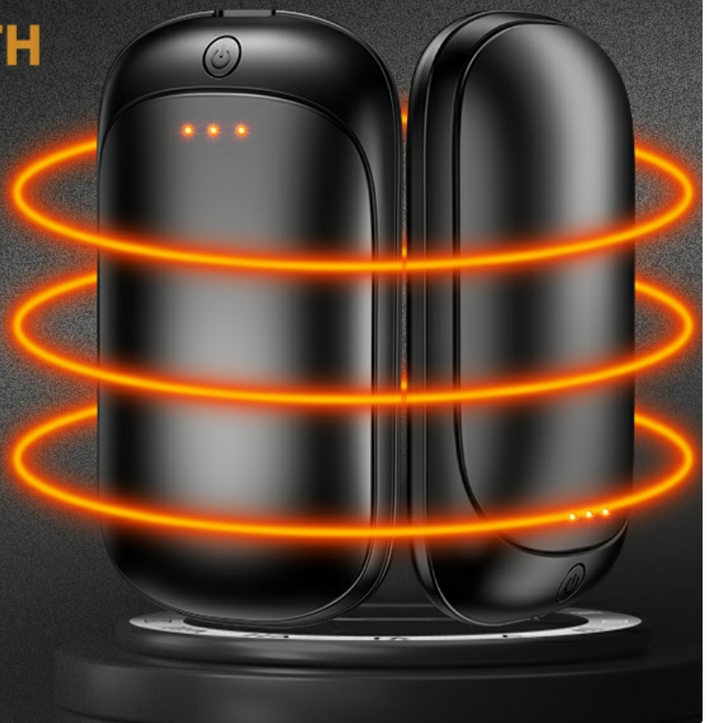
Image: Two hand warmers illustrating the three heating levels with red indicator lights and their respective temperature ranges (95-107.5°F, 104-118.5°F, 118.5-131°F).