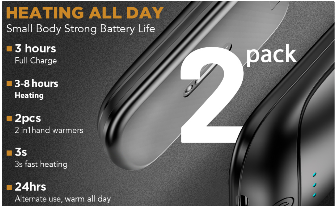
Image: A visual representation of the hand warmers, indicating a 3-hour full charge time and 3-8 hours of heating duration, emphasizing the 2-pack design for all-day warmth.