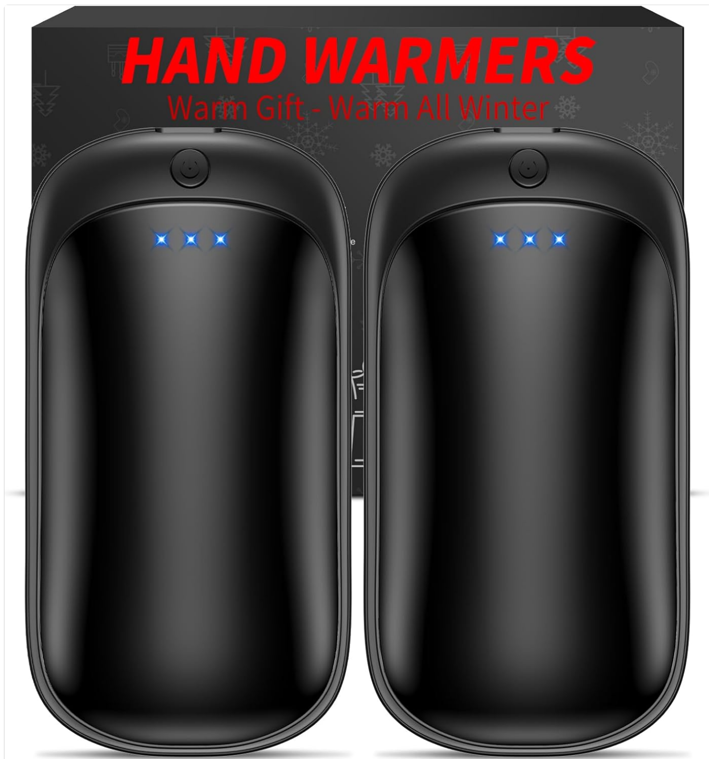
Image: Two Lerat rechargeable hand warmers, black in color, displayed in their product packaging.