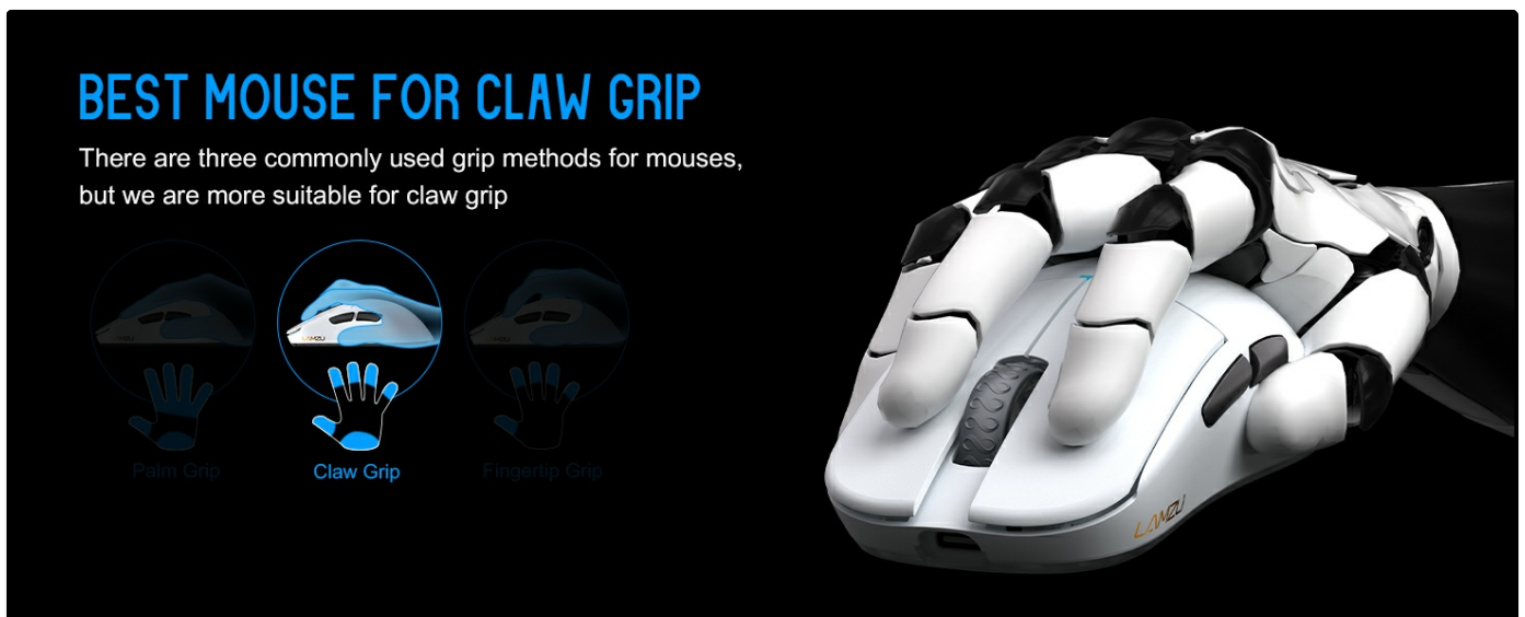
Image: An illustration demonstrating different mouse grip methods: palm grip, claw grip, and fingertip grip, highlighting the mouse's suitability for claw grip.