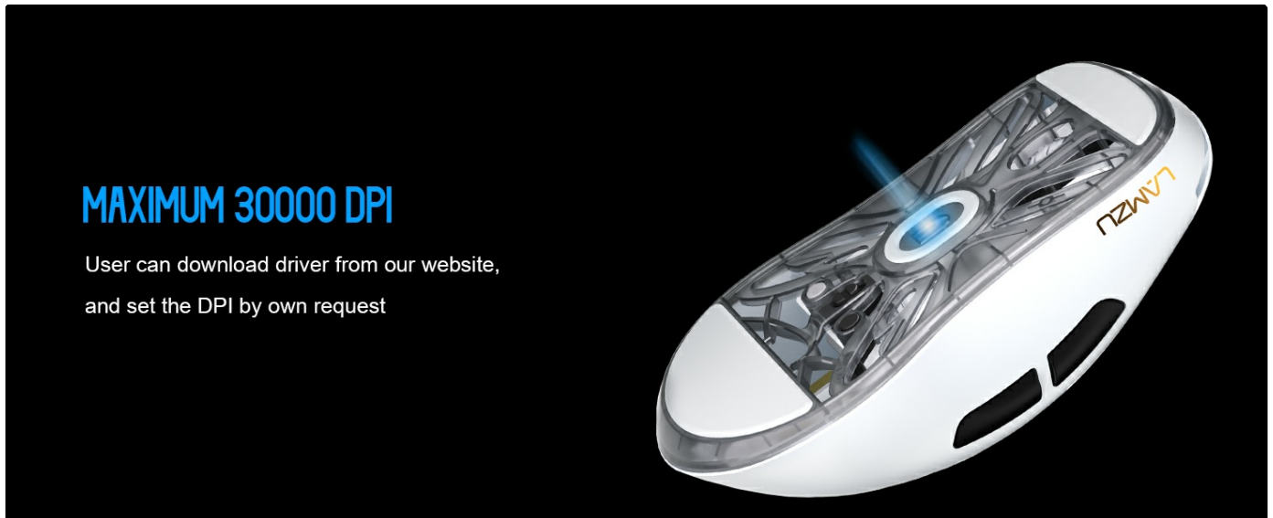
Image: An illustration highlighting the mouse's capability for a maximum of 30,000 DPI, adjustable via software.