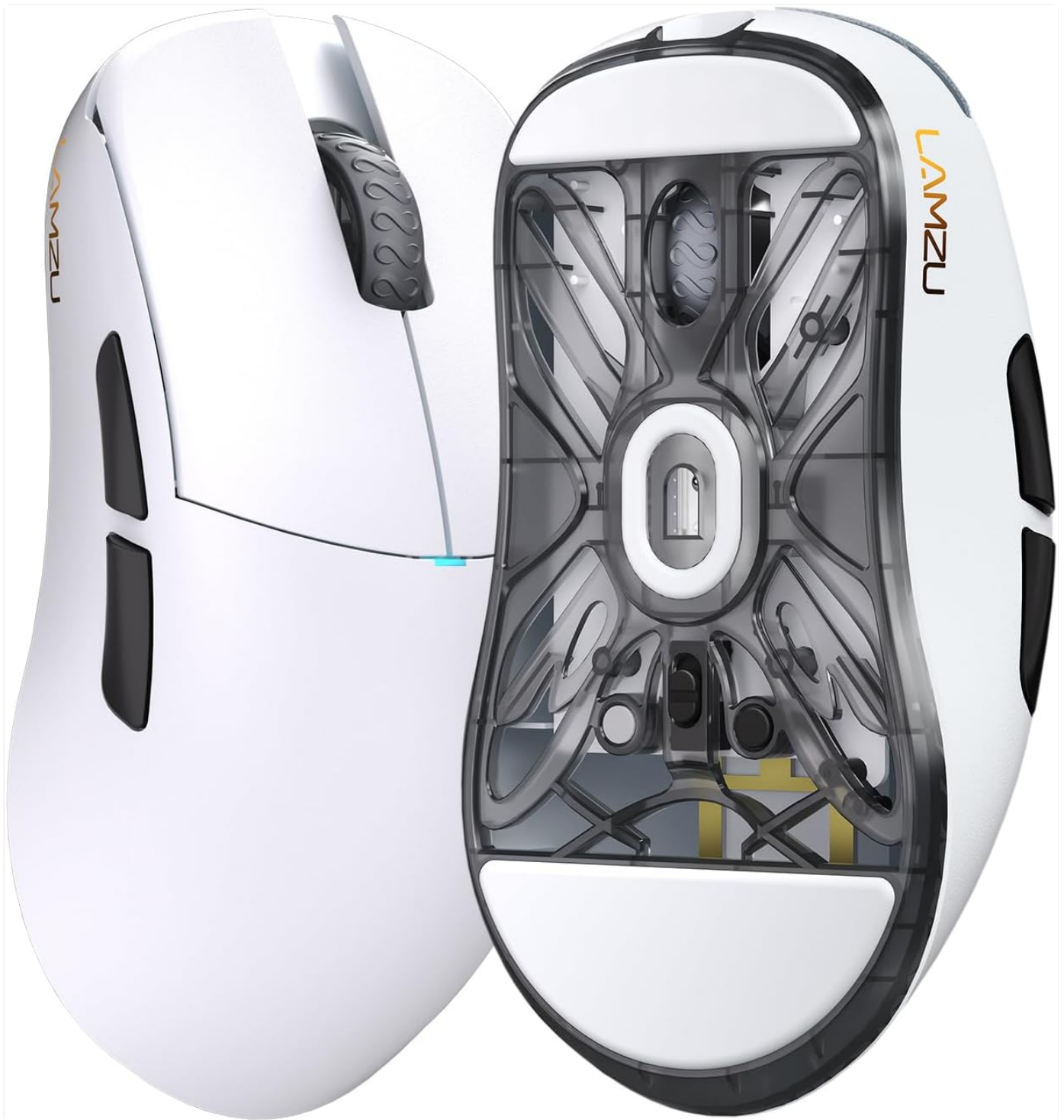
Image: Top and bottom view of the mouse, showing the sensor and power switch on the underside.