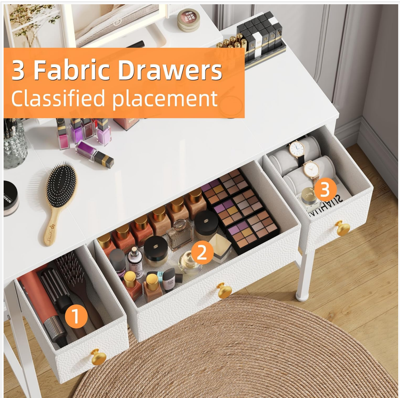
Image 4.4: The three fabric drawers provide organized storage for various items.