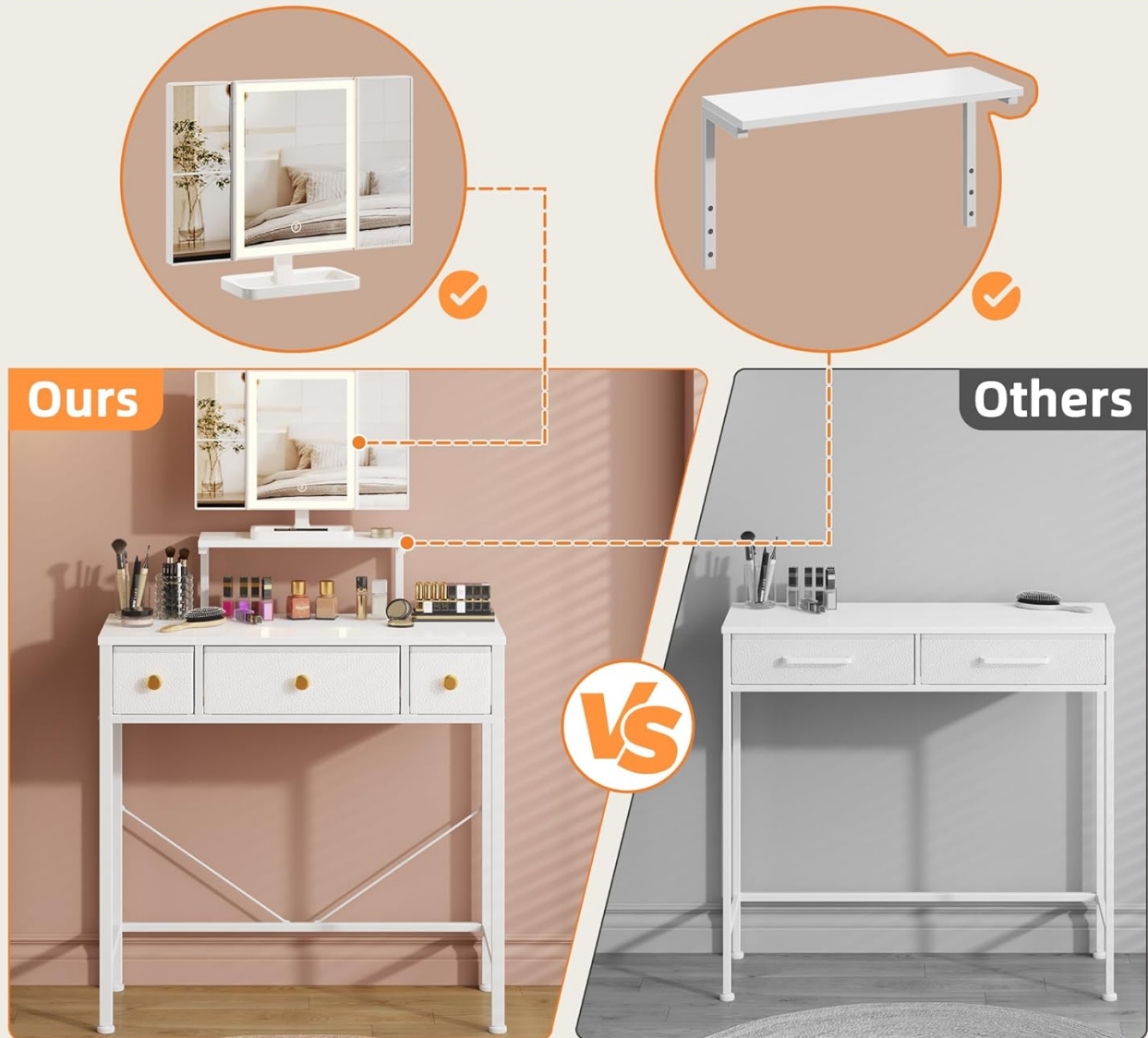
Image 4.5: The mirror stand offers three height adjustments: 4.7", 5.9", and 7.1" to align the mirror with your face.