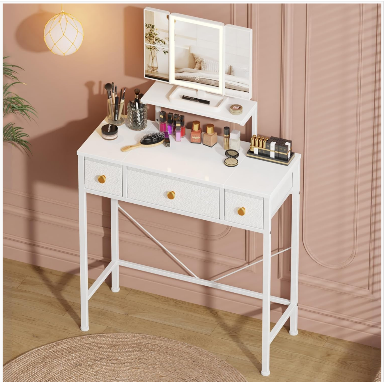
Image 1.1: Overview of the HIGDBFE Small Makeup Vanity Desk D5008-WH.