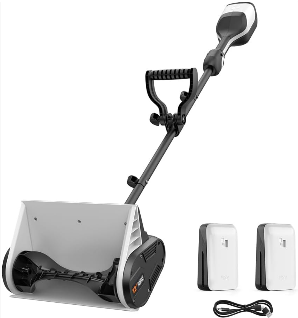
Figure 1: Litheli Cordless Snow Shovel components including the main unit, handle, two 4.0Ah batteries, and charging cable.

securely into place. Check the battery indicator lights to confirm charge level.