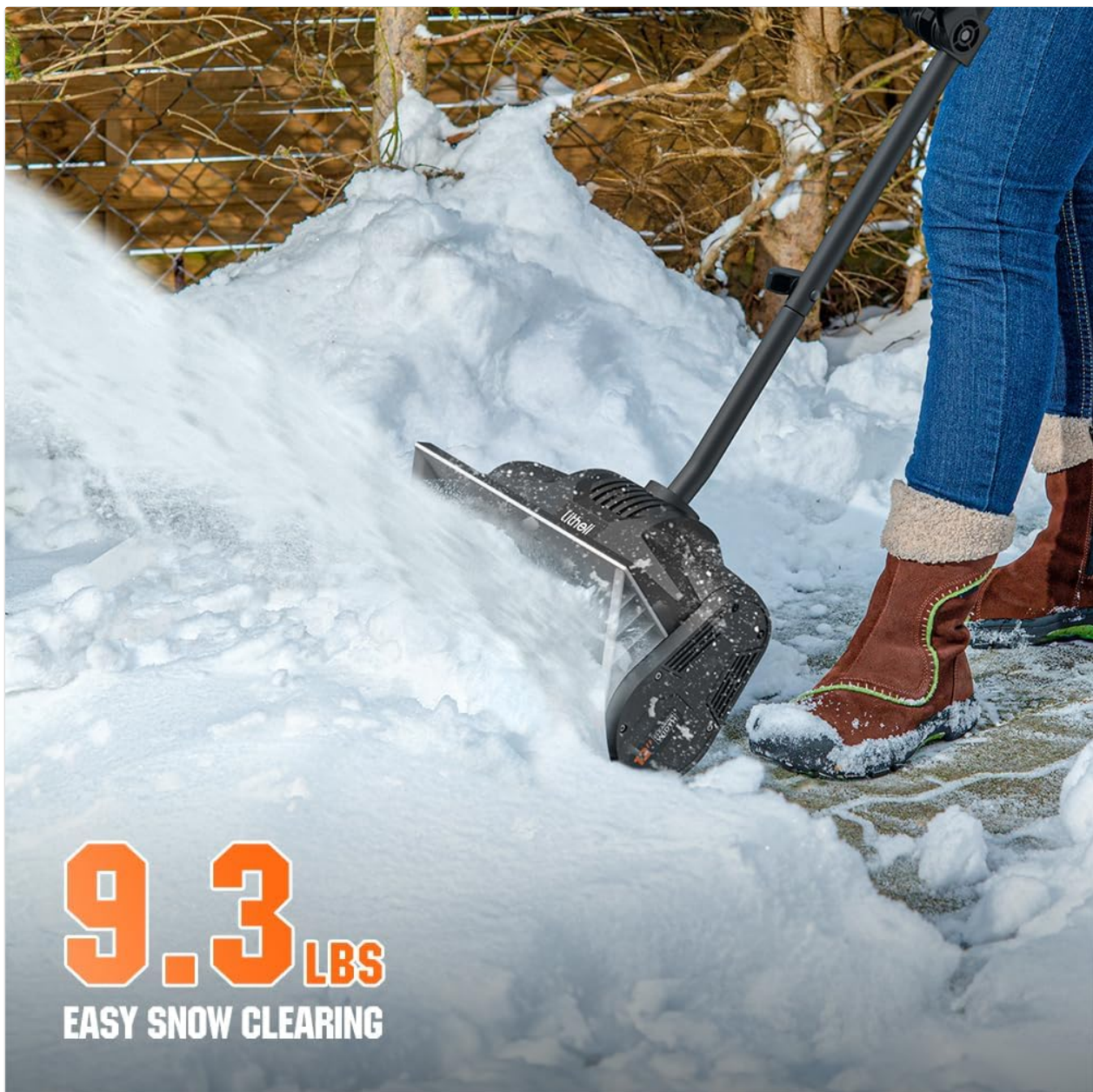
Figure 5: Weighing only 9.3 lbs, the cordless snow shovel is lightweight and easy to maneuver.