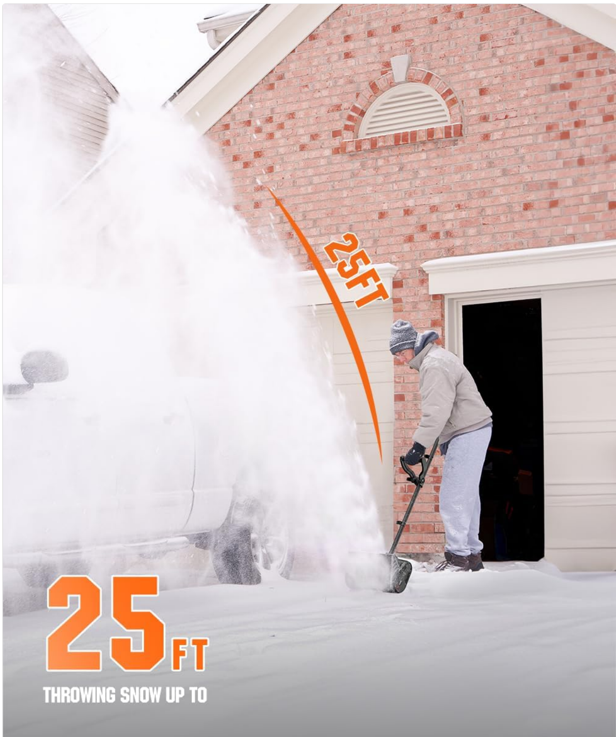
Figure 4: The powerful motor allows the snow shovel to throw snow up to 25 feet, clearing paths quickly.