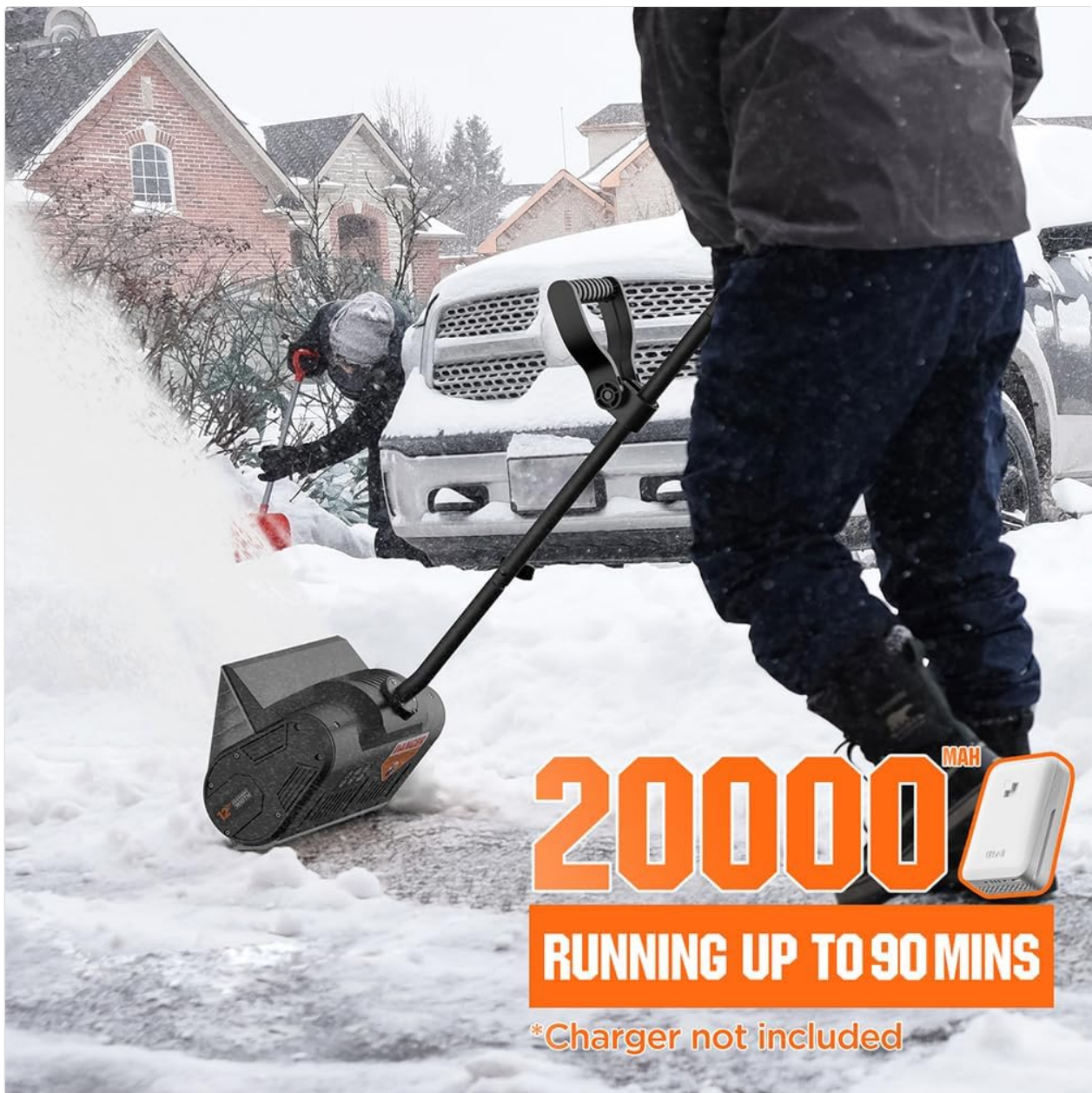
Figure 6: The 2x20V batteries provide up to 90 minutes of runtime for efficient snow clearing.