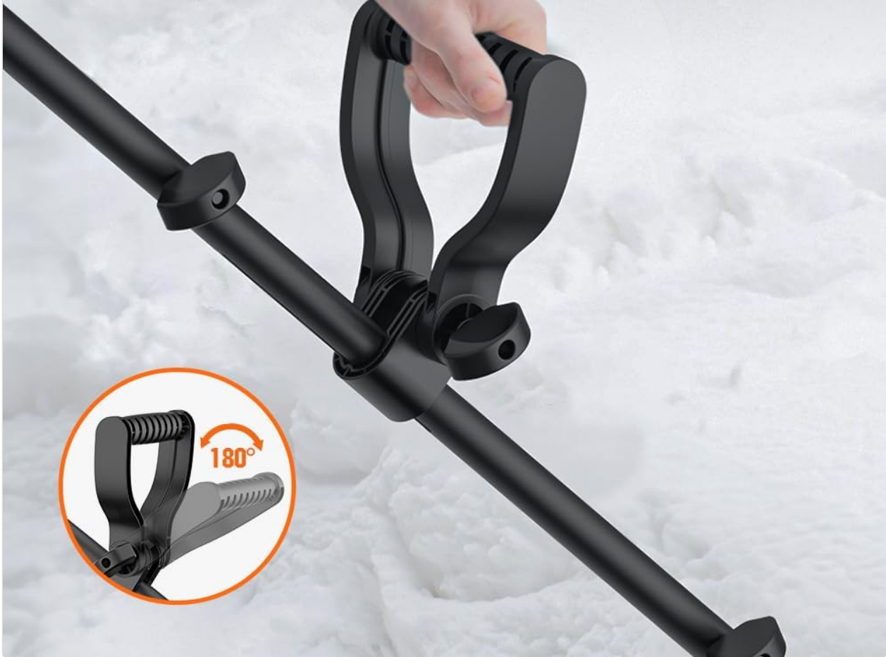
Figure 2: The adjustable ergonomic handle can be positioned for optimal comfort and leverage during snow removal.

Ease arm and back strain with adjustable grip