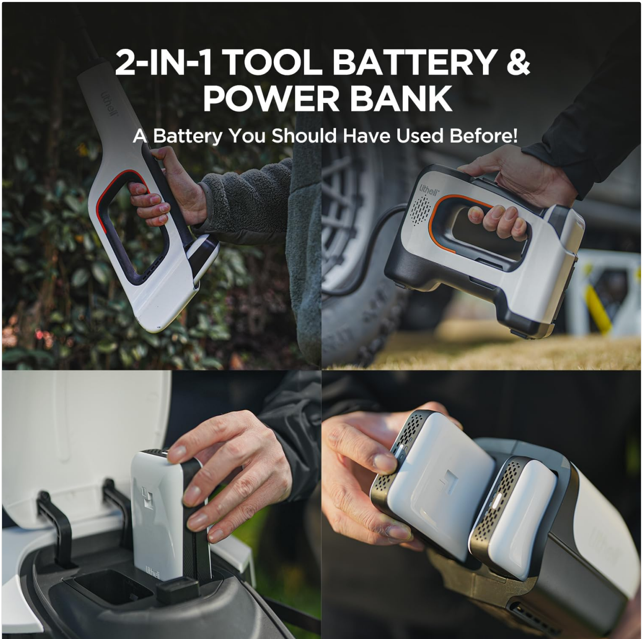
Figure 7: The versatile 20V batteries double as a power bank for charging other devices.