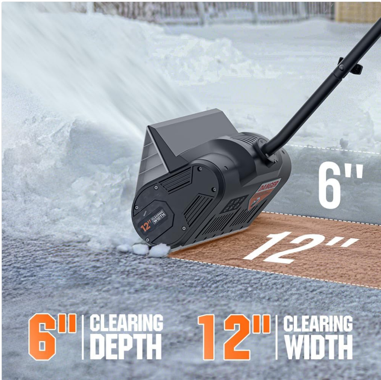
Figure 3: The snow shovel efficiently clears snow with a 12-inch width and 6-inch depth.