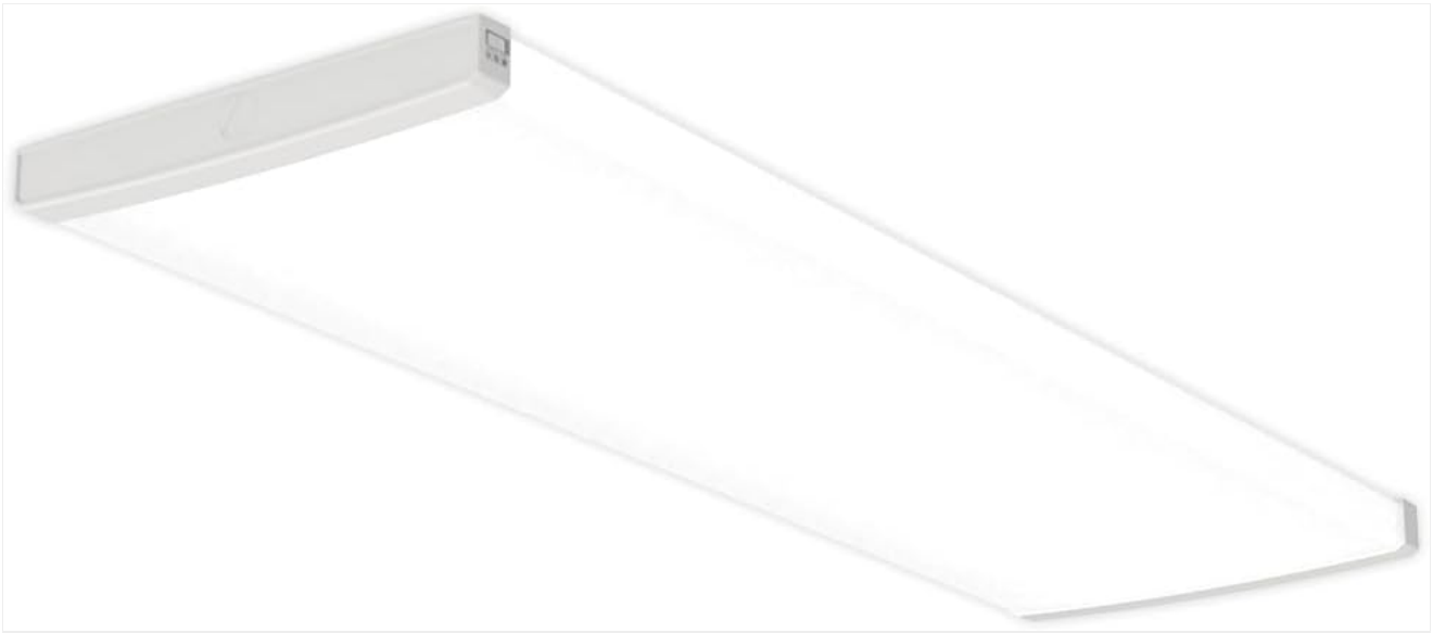
Image 2.1: Front view of the Lithonia Lighting TruWrap 4-Foot LED Ceiling Light Fixture.