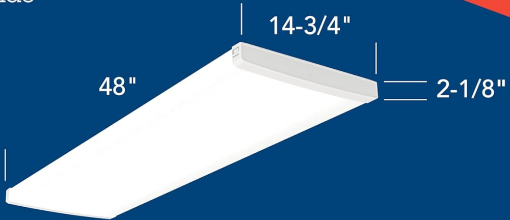
Image 7.1: Dimensions of the TruWrap 4-Foot LED Ceiling Light Fixture.