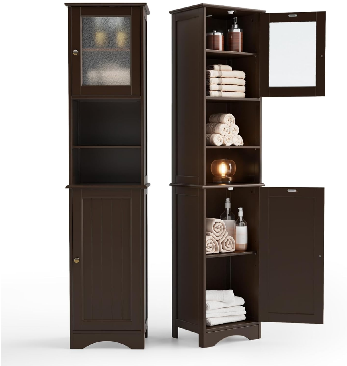
Image: The Gizoon Tall Bathroom Storage Tower, showcasing its design and functionality in a typical bathroom environment.