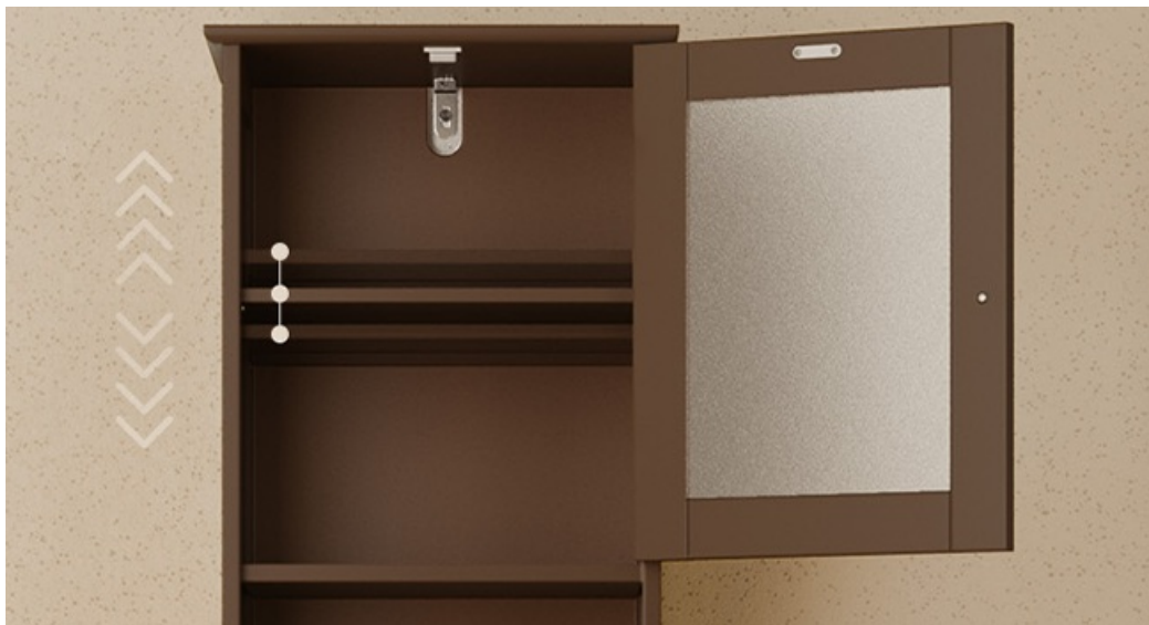
Image: Illustration of adjustable shelves within the cabinet, highlighting flexibility for varied storage needs.

Insert the adjustable shelves into the desired positions. The cabinet features multiple pre-drilled holes for customization. Ensure the shelf pins are fully seated.