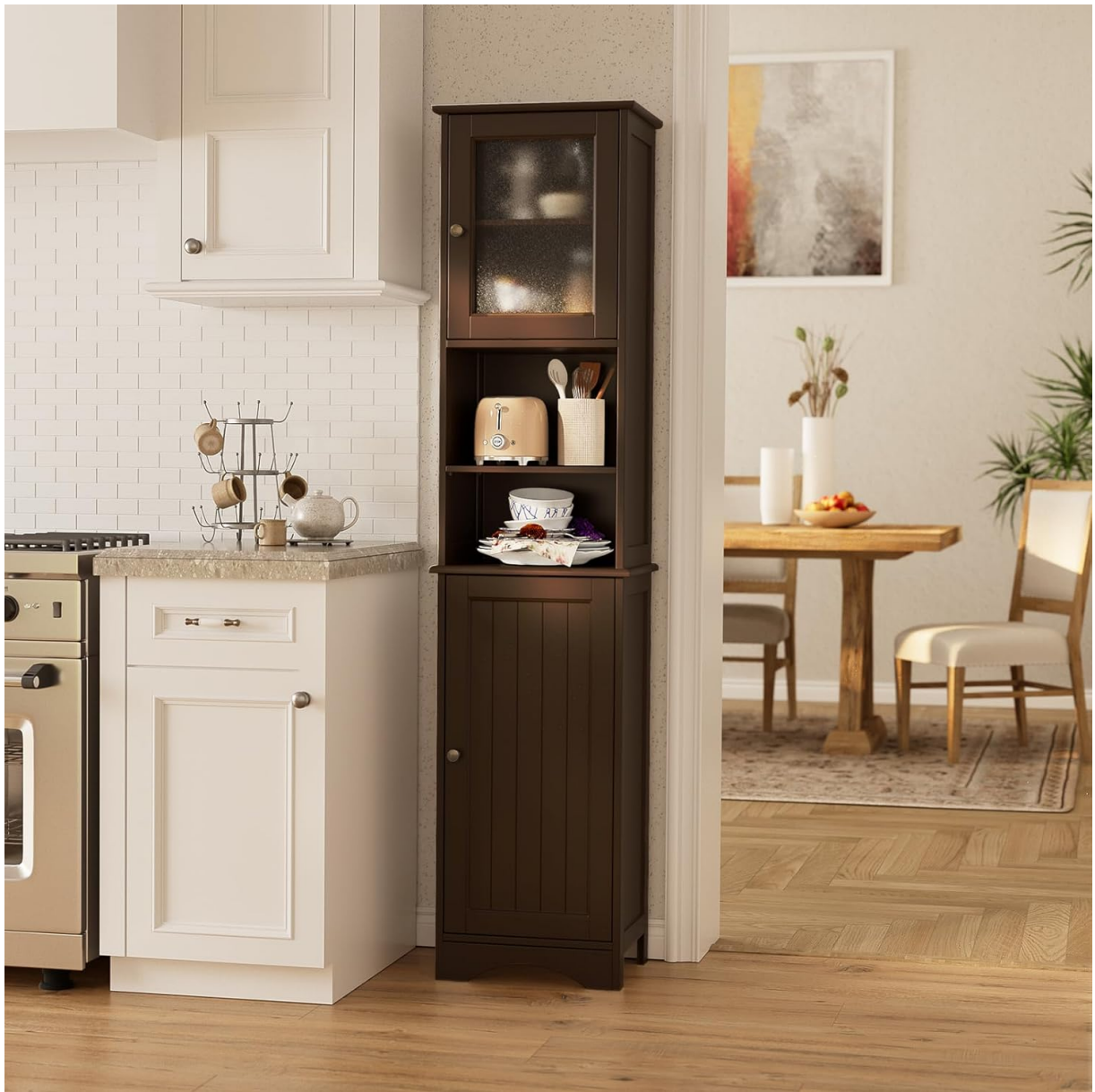
Image: The storage tower integrated into a kitchen environment, demonstrating its utility for kitchen items.