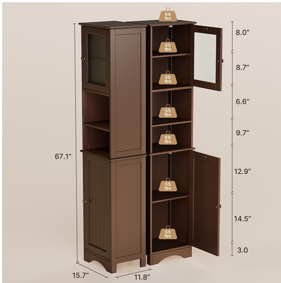
Image: Detailed diagram illustrating the dimensions of the storage tower.