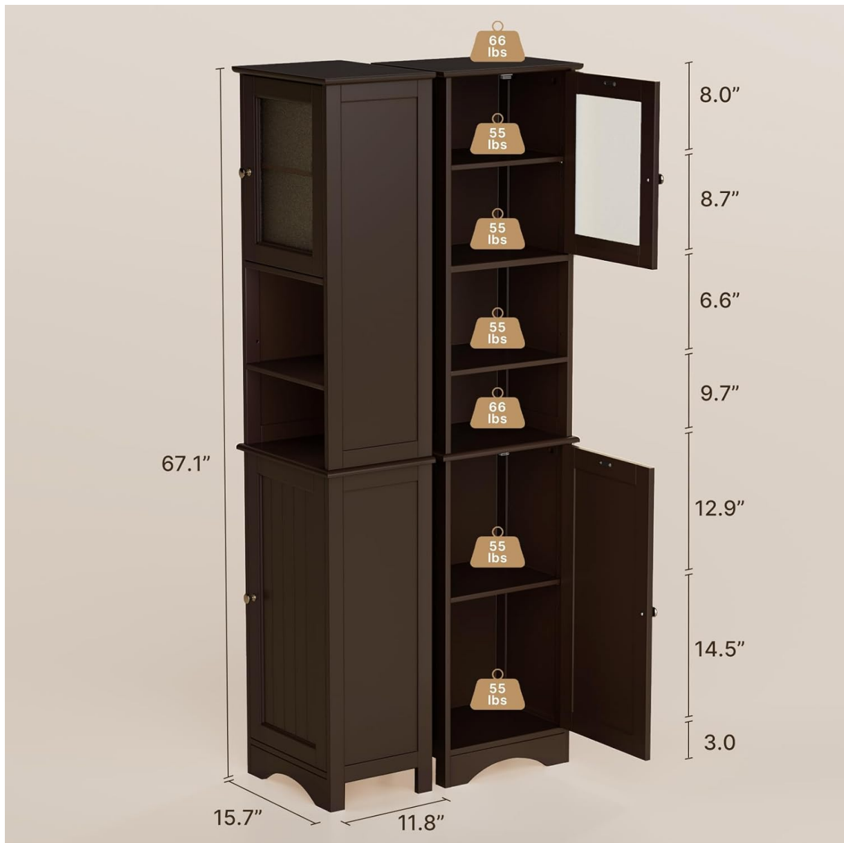
Image: The storage tower with its doors open, displaying various items neatly arranged on the adjustable shelves.