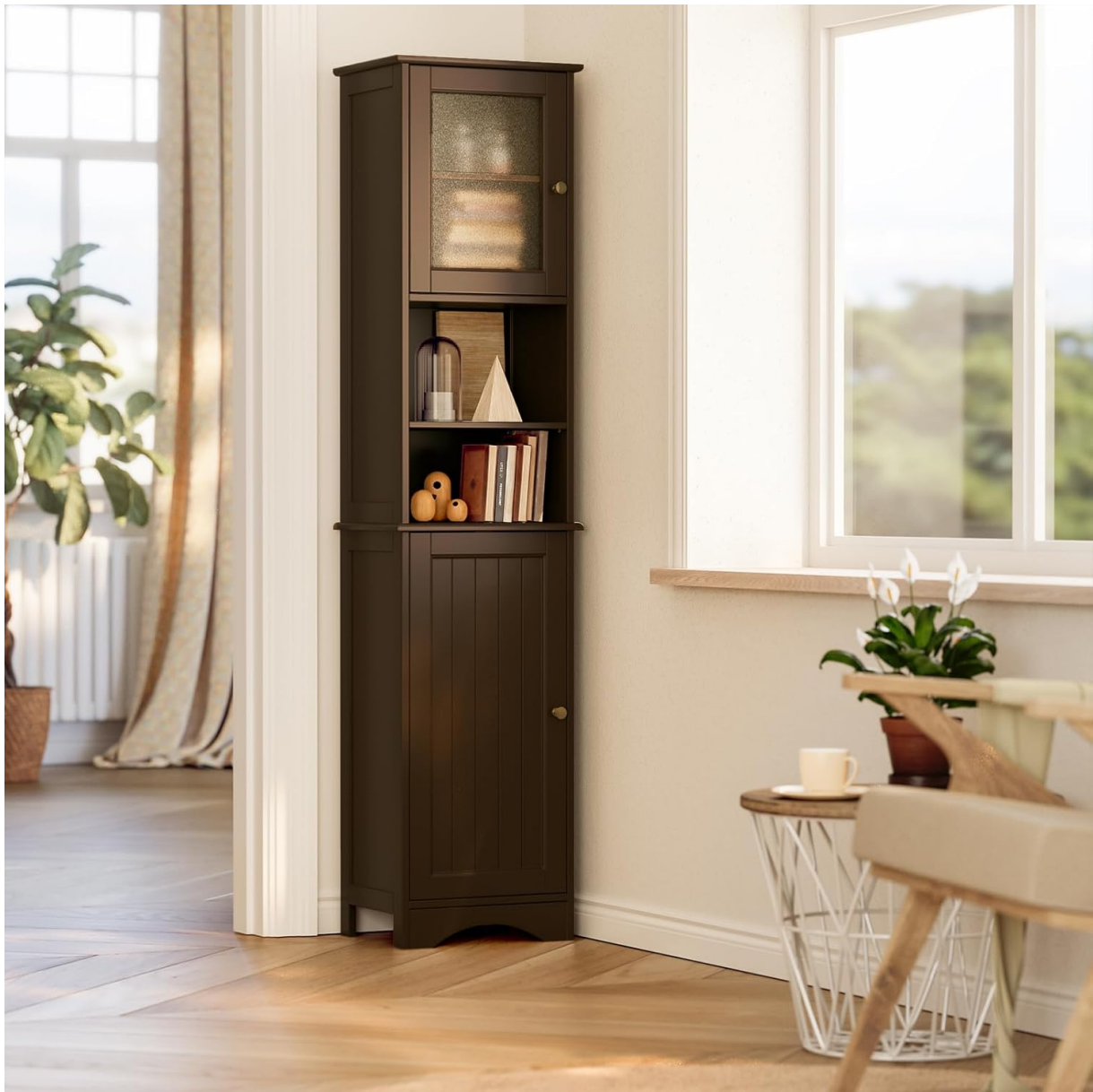
Image: The storage tower placed in a living room, serving as a decorative and functional piece of furniture.