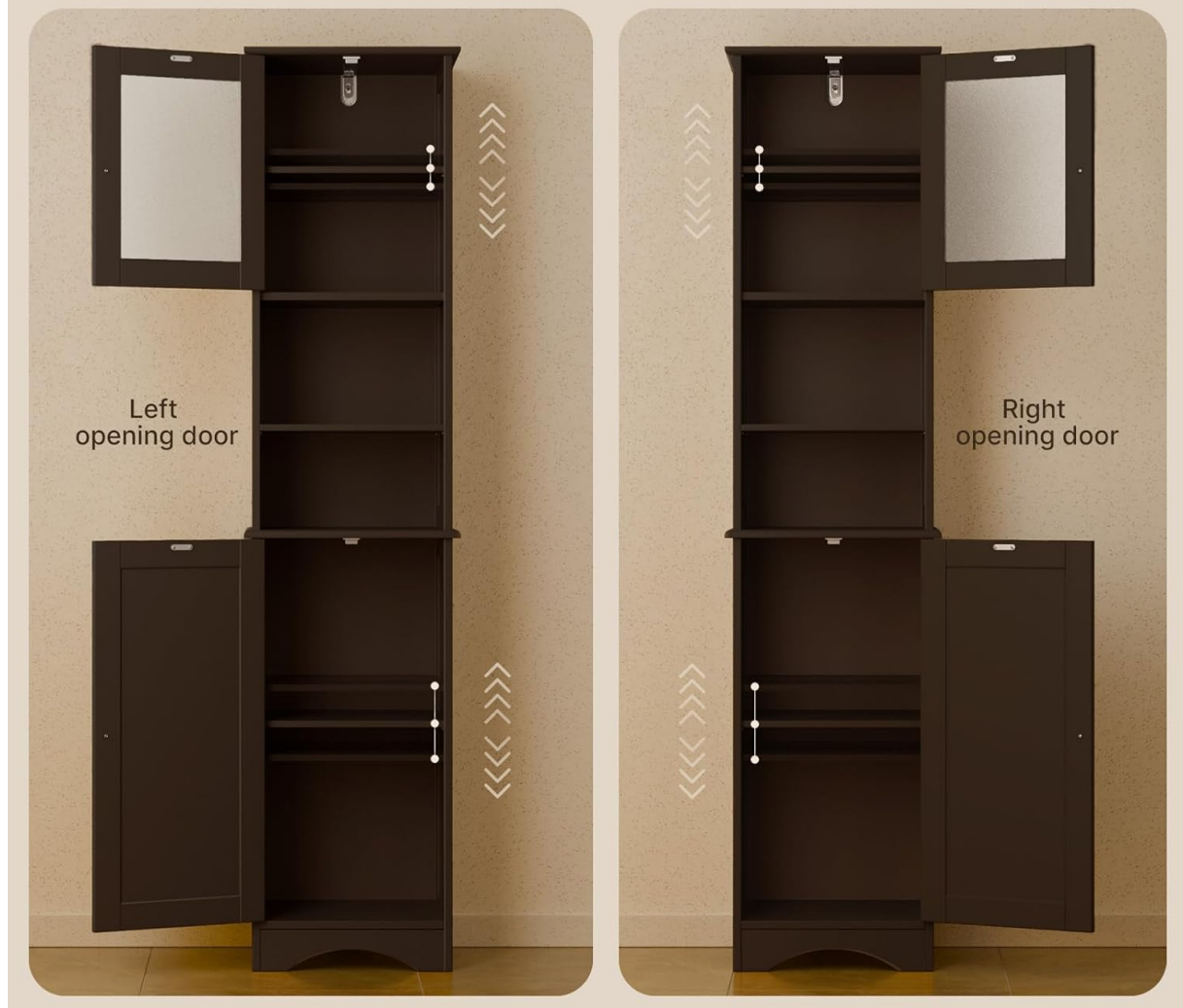
Image: The cabinet with both upper and lower doors open, illustrating the optional two-way door opening feature for user convenience.