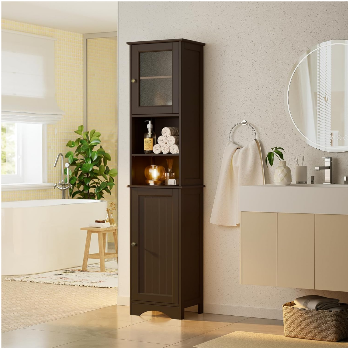
Image: The Gizoon Tall Bathroom Storage Tower positioned in a bathroom, demonstrating its functional design and storage capabilities.