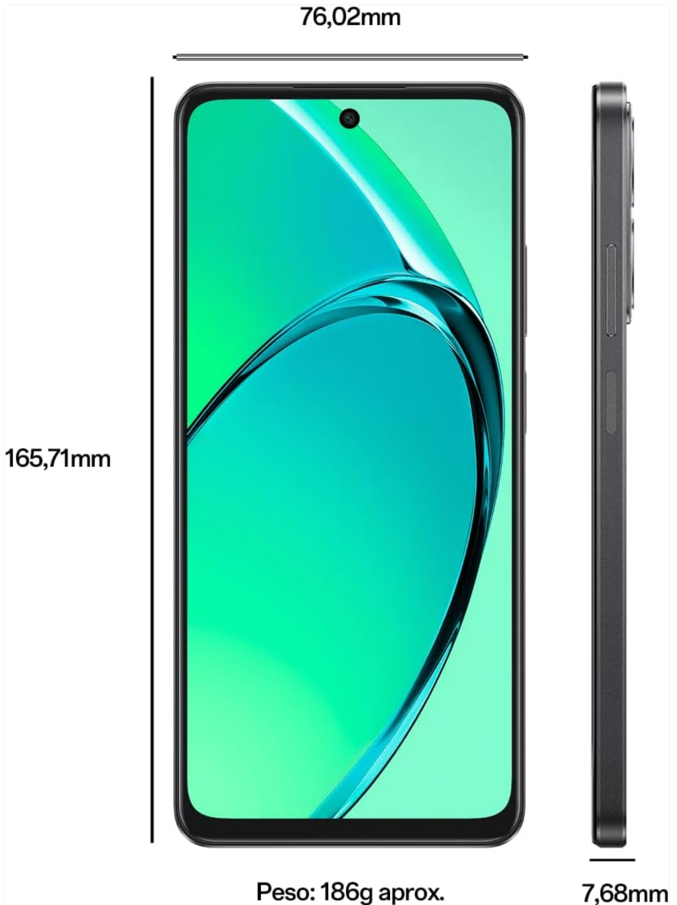
Figure 2: OPPO A40 physical dimensions (approx. 165.71mm height, 76.02mm width, 7.68mm thickness, 186g weight).

Navigate the device using touch gestures: tap, swipe, pinch-to-zoom. The Android 14 operating system with ColorOS 14 provides an intuitive user interface.