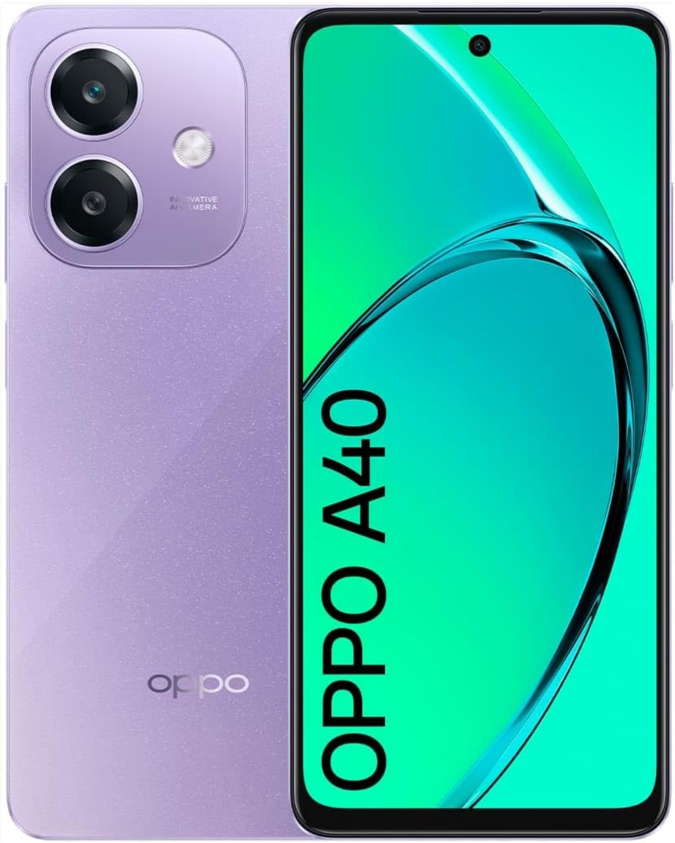
Figure 1: Front and rear view of the OPPO A40 smartphone in Starry Purple.