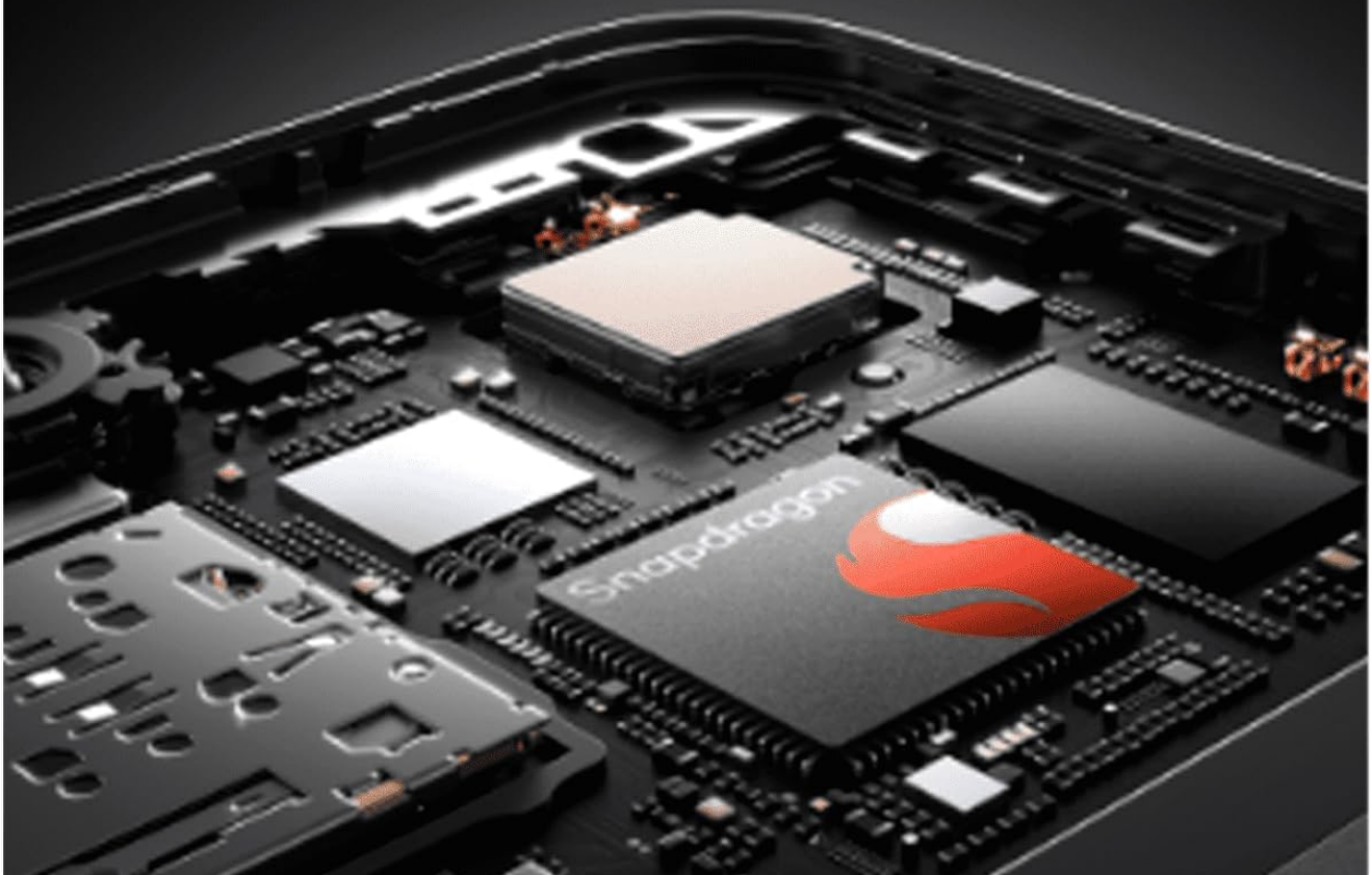
Figure 4: Illustration of the OPPO A40's RAM expansion technology, which utilizes unused storage space to enhance performance.

Este teléfono te ofrece un rendimiento más rápido y fluido gracias a un toque de magia de memoria RAM de expansión que toma prestado el espacio de almacenamiento no utilizado como memoria de ejecución, para mantenerte en flujo