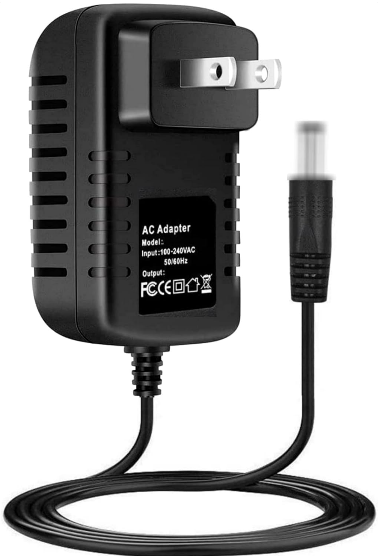
Image 1: The Onerbl AC-DC Adapter with its integrated cable and DC barrel connector.