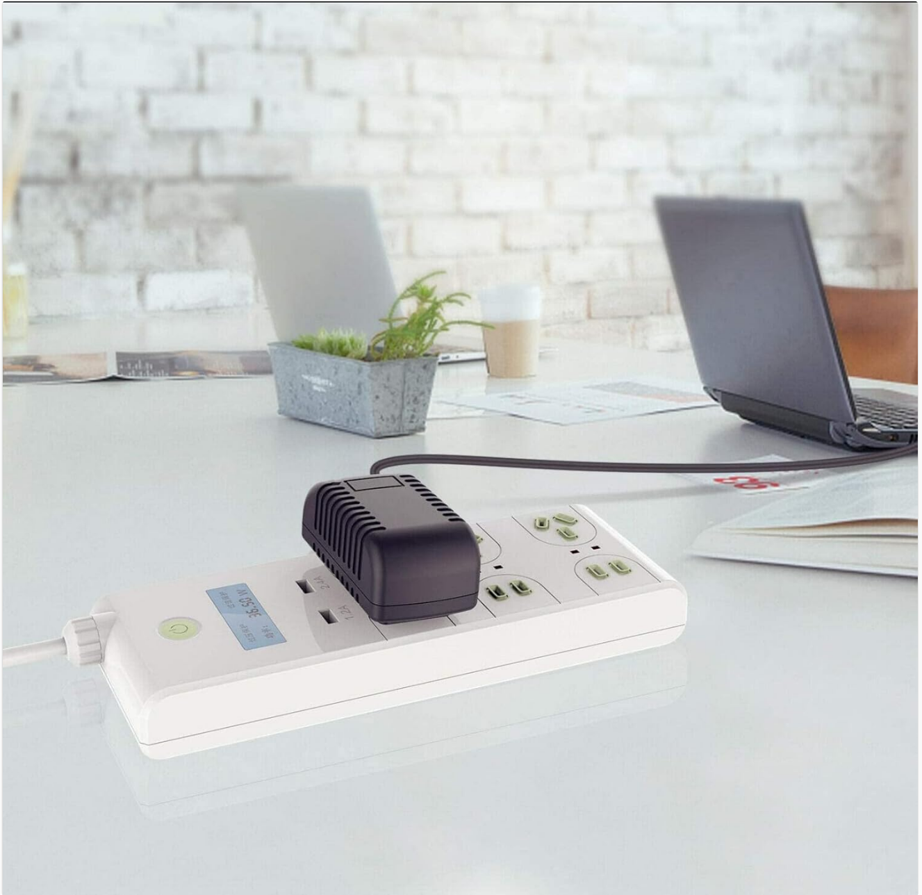
Image 3: The adapter connected to a power strip, demonstrating a typical setup.

4. Power On: Your device should now receive power. If your device has a power switch, turn it on.