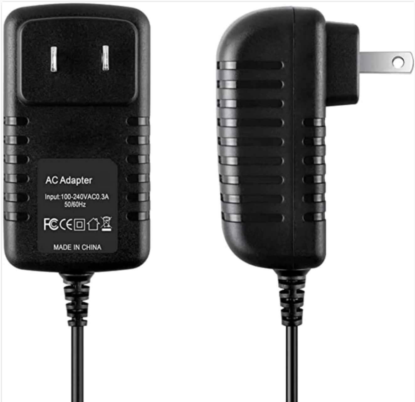
Image 2: Front and side views illustrating the compact design of the adapter.