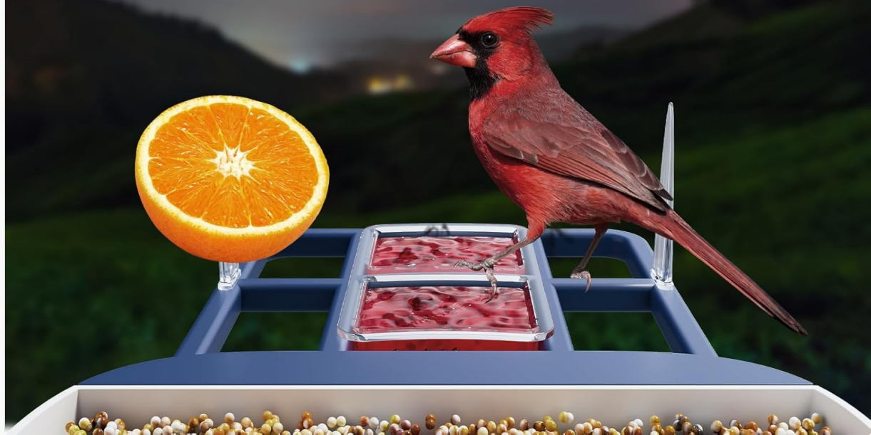
Image: All components included with the Solareye B6-US Smart Bird Feeder, including the main unit, solar panel, various mounting hardware, and feeding accessories.