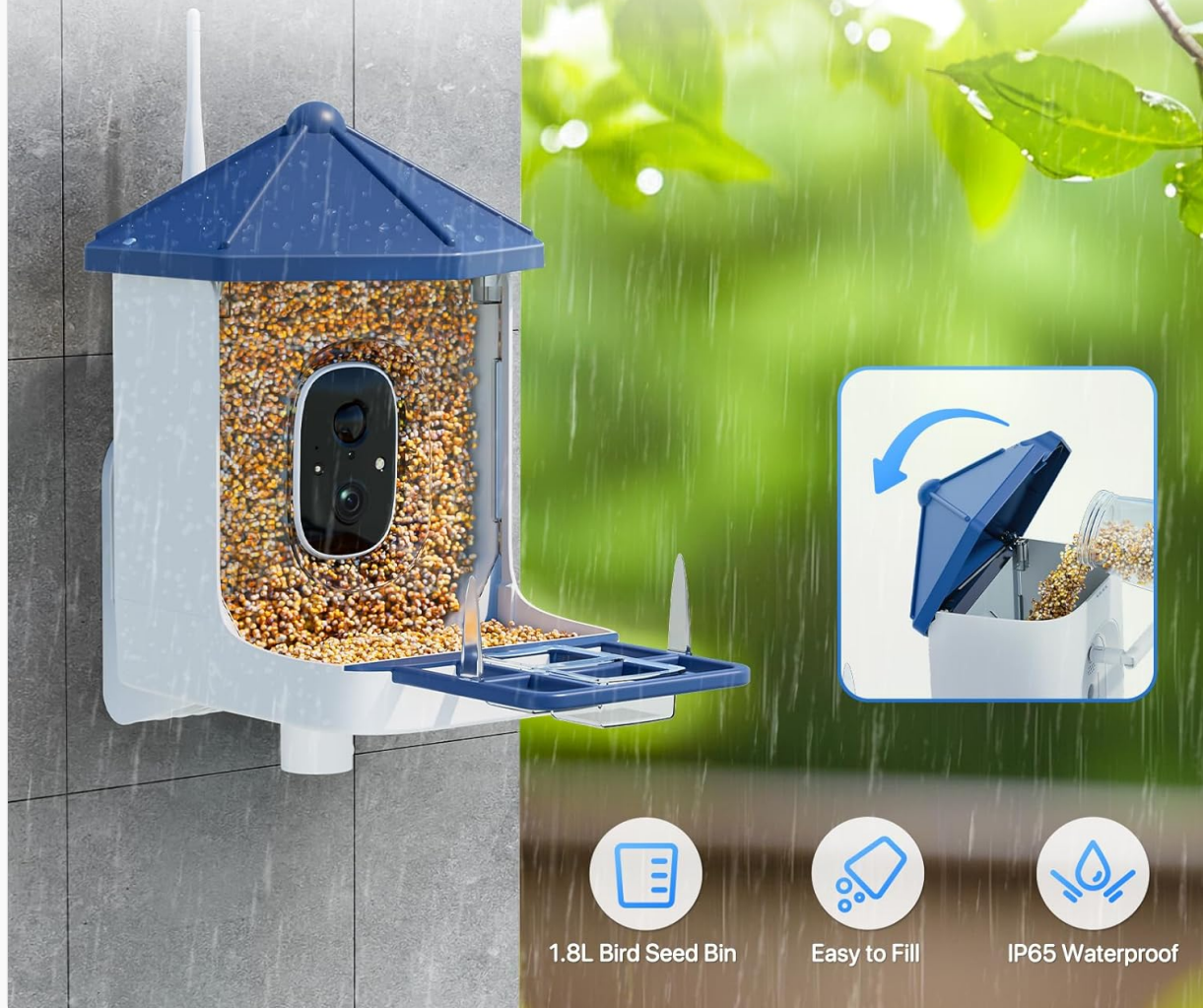
Image: The Solareye B6-US Smart Bird Feeder highlighting its long-lasting battery and solar charging capability, indicating up to 6 months of use on one charge.