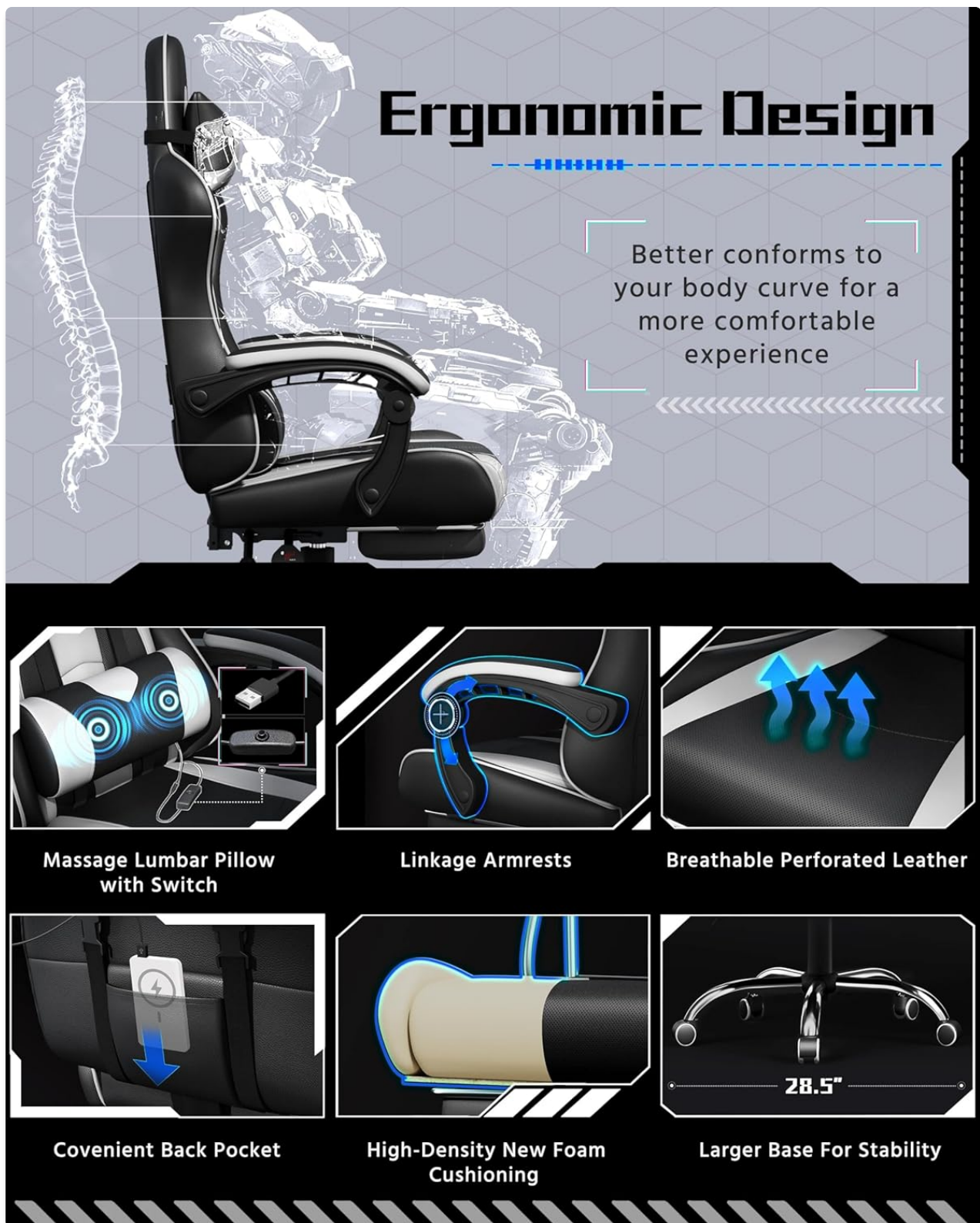
Figure 2: Ergonomic Design and Key Components