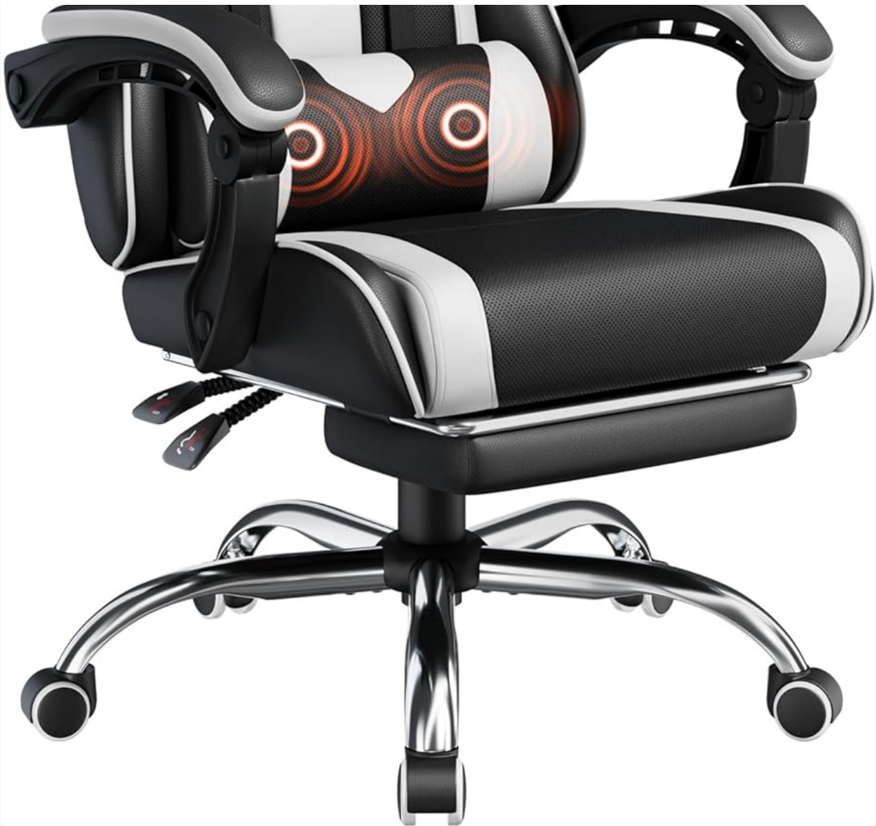
Figure 1: Yaheetech Gaming Chair (Black/White model)