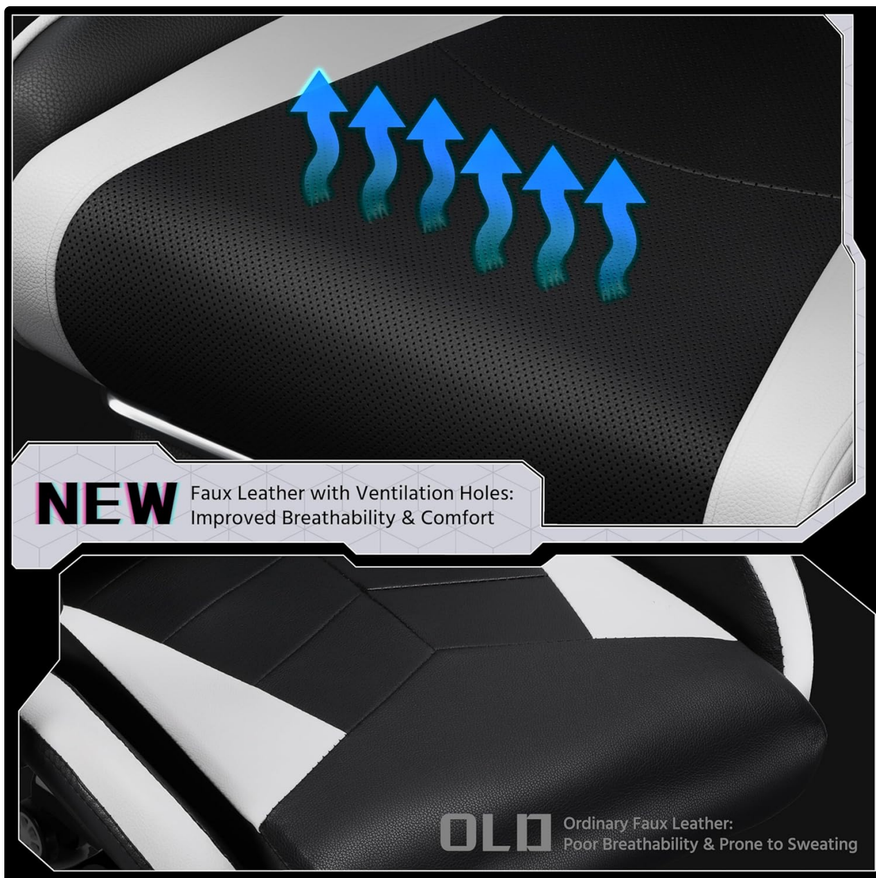
Figure 6: Breathable Faux Leather