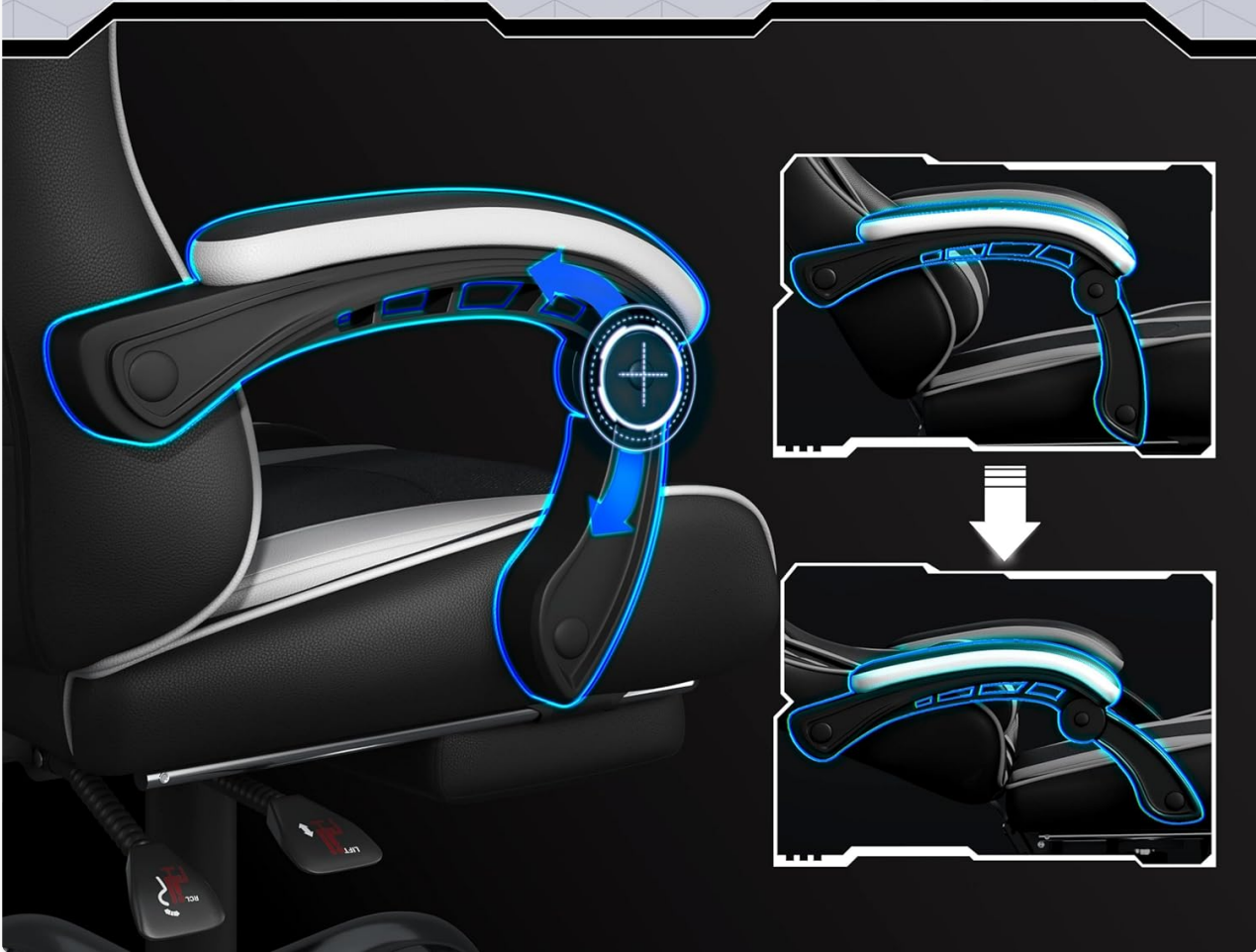
Figure 5: Linkage Armrests

Automatically adjust with the chair's recline angle to constantly support the elbows and relax the arms