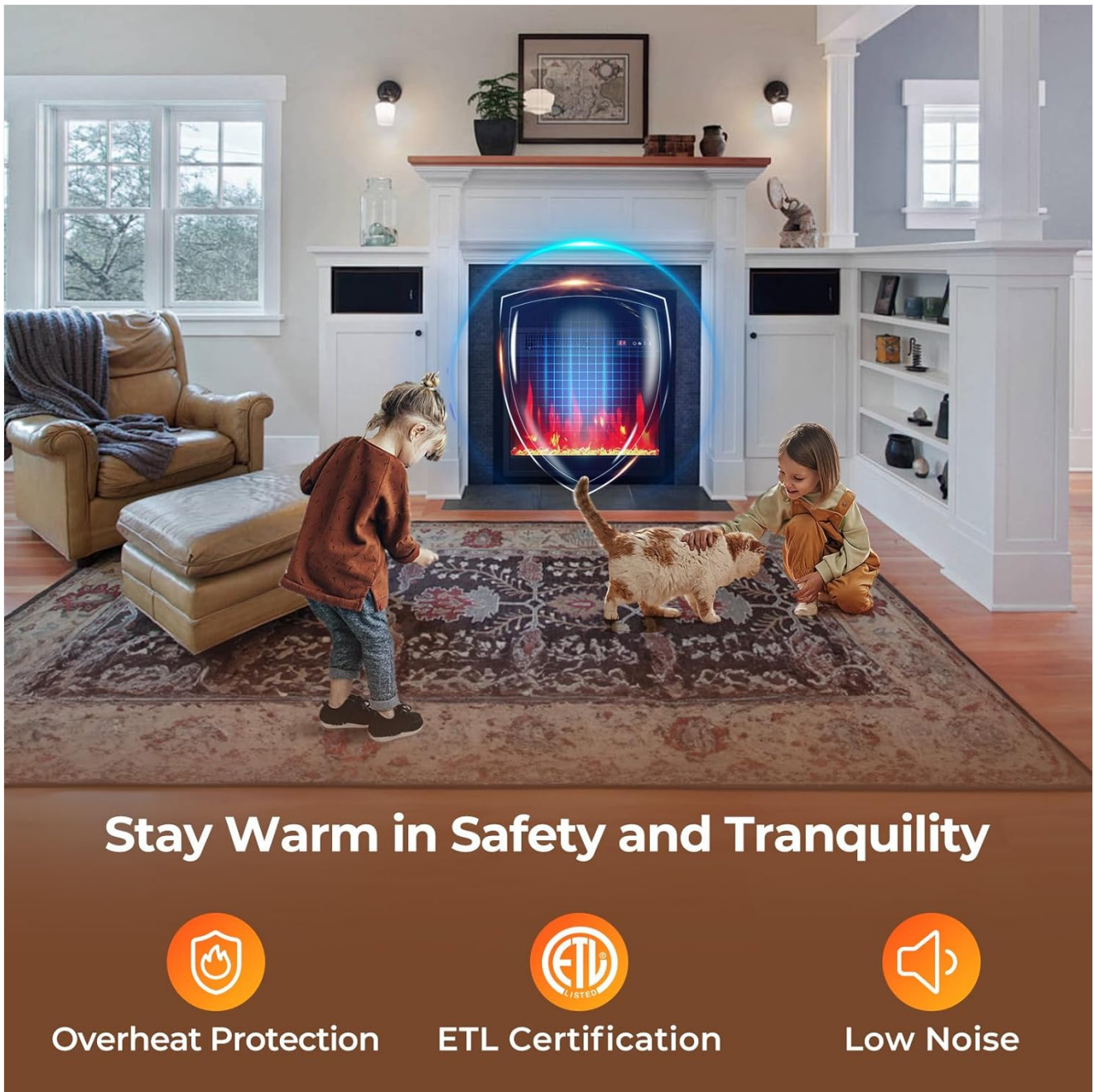
Image 2.1: Visual representation of the fireplace's safety features: Overheat Protection, ETL Certification, and Low Noise operation.