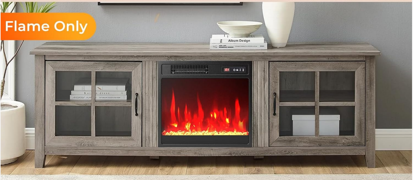
Image 5.3: Visual comparison of the fireplace operating with both flame and heat, versus flame only for decorative purposes.