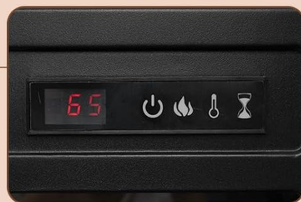
Control Panel with LED Display