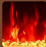
Image 5.4: Display of the three available flame colors and five brightness settings, allowing for personalized ambiance.