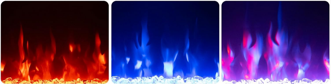
Image 1.1: The COSTWAY 18-inch Electric Fireplace Insert, showcasing its front panel and included remote control.