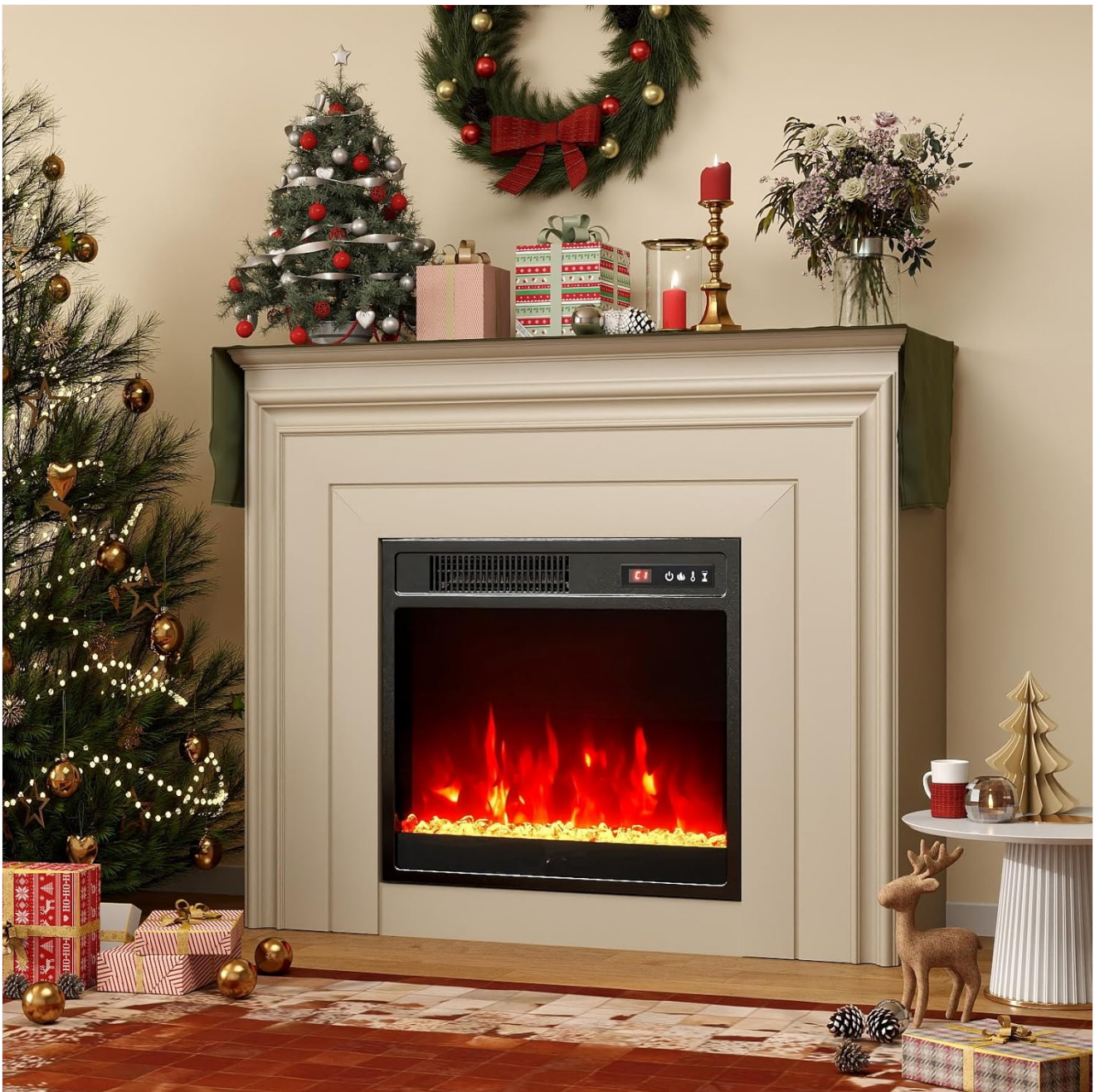
Image 1.2: The electric fireplace insert seamlessly integrated into a decorative mantel, enhancing the room's ambiance.