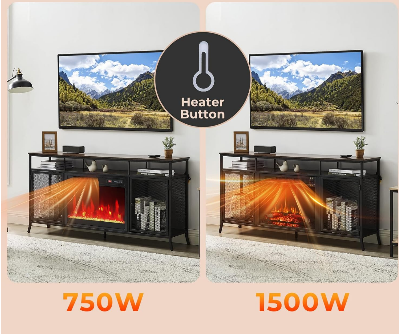
Image 5.2: Illustration demonstrating the two heating options: 750W for moderate warmth and 1500W for higher heat output.

Designed for customizable warmth and comfort