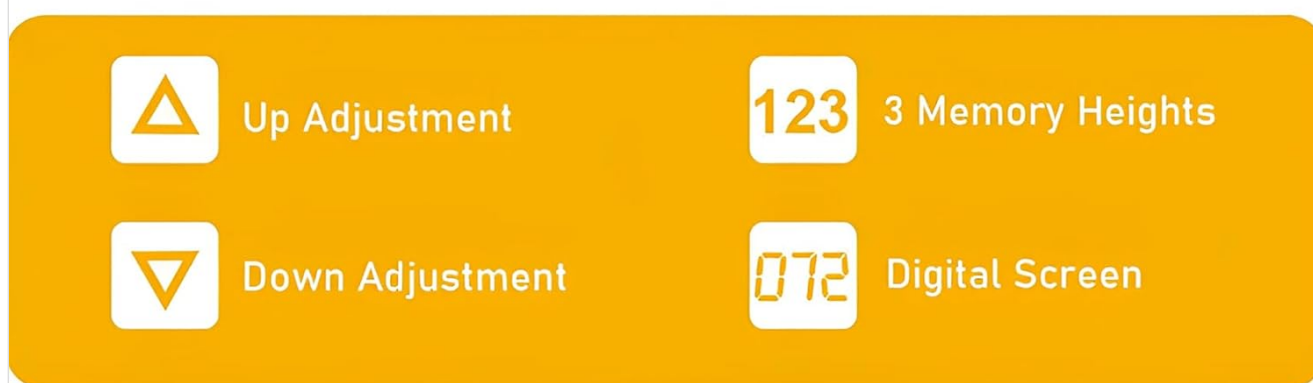
Image 4.1: The 5-button control panel with up/down arrows and memory presets, showing the digital height display.