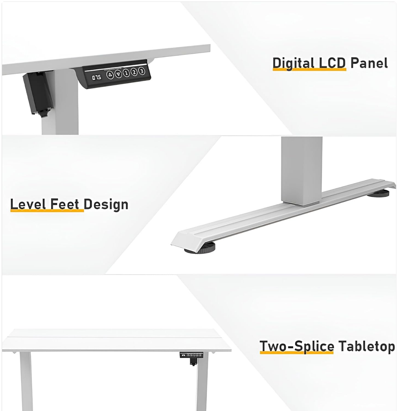
Image 3.4: The PrimeCables Electric Adjustable Standing Desk featuring a two-piece splice board desktop, providing a spacious work surface.

Once the frame is assembled, carefully place the splice board desktop onto the frame. Align the pre-drilled holes on the desktop with the mounting points on the frame. Secure the desktop using the provided screws. Ensure the splice board is correctly aligned to form a seamless surface.