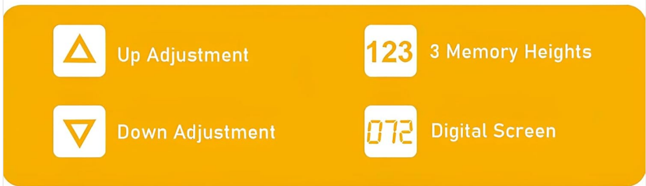
Image 3.5: A close-up view of the 5-button control panel with 3 memory presets and a digital display, mounted on the underside of the desk.

Your browser does not support the video tag.