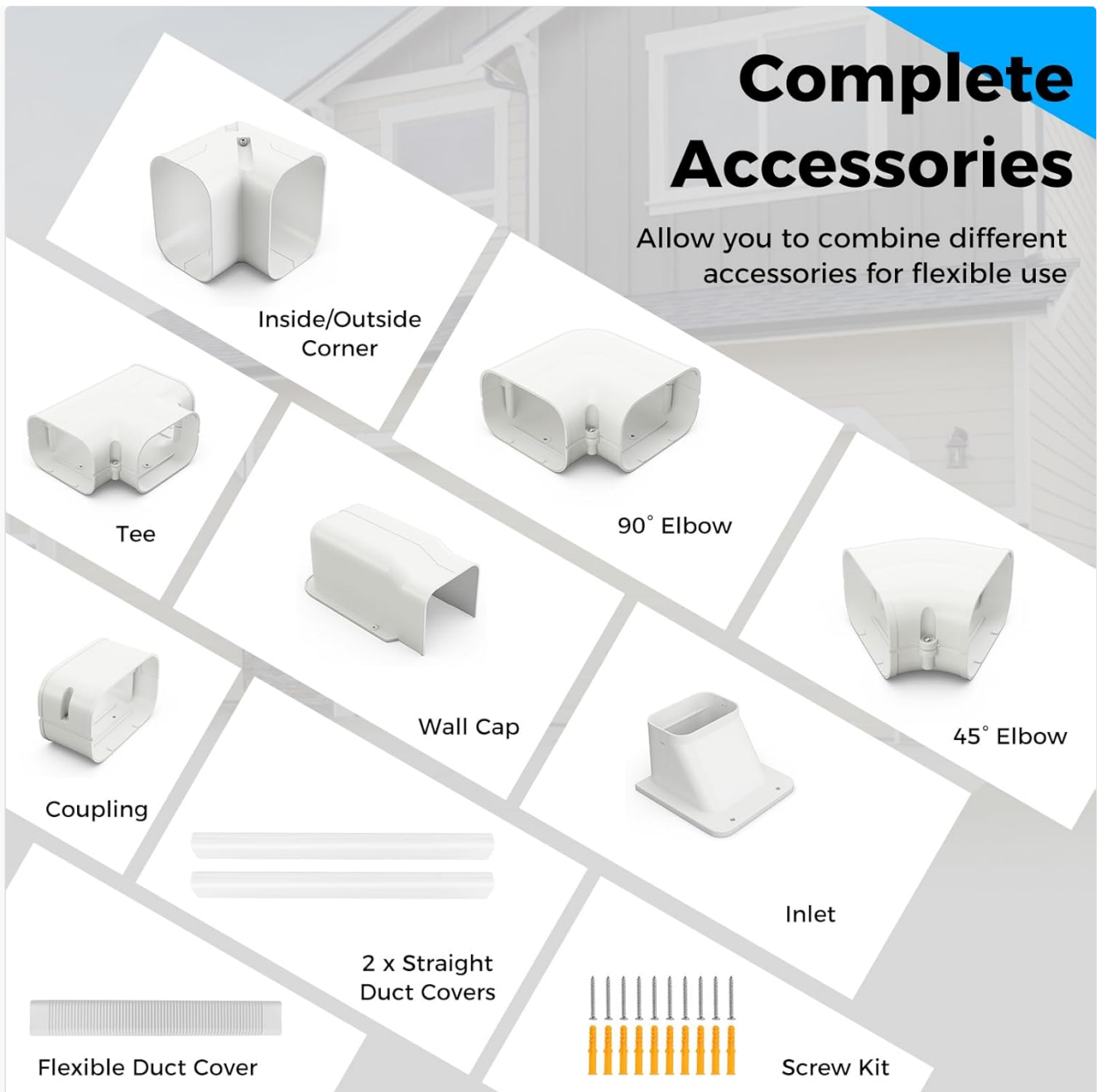
Figure 2.1: Complete Accessories. This image displays all the components included in the DORTALA Mini Split Line Set Cover kit. It shows an Inside/Outside Corner, Tee, Coupling, Wall Cap, 90° Elbow, 45° Elbow, Inlet, two Straight Duct Covers, a Flexible Duct Cover, and a Screw Kit. These parts allow for various configurations to cover AC lines effectively.

Allow you to combine different accessories for flexible use