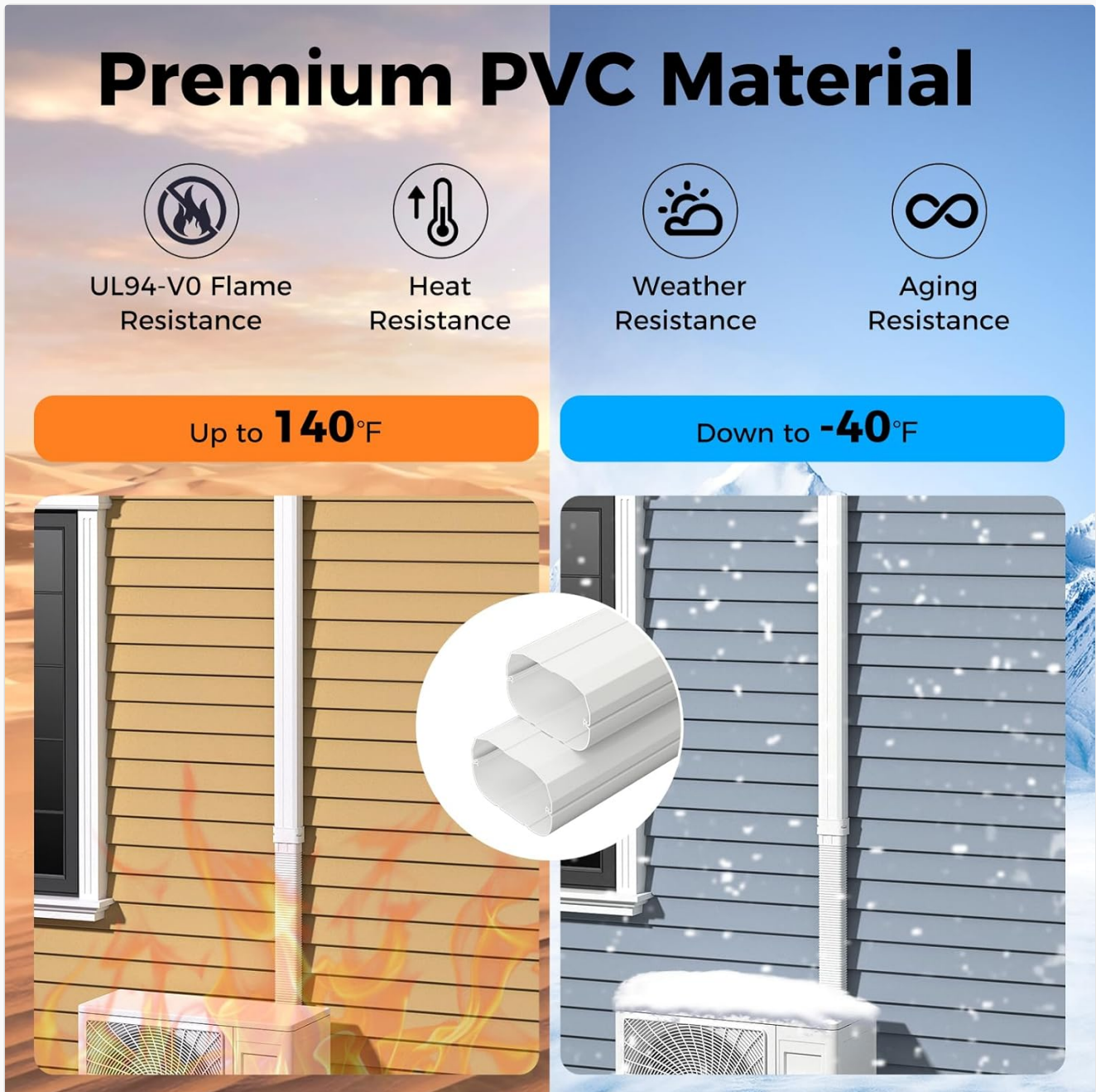
Figure 3.1: Premium PVC Material. This image demonstrates the robust properties of the PVC material used for the line set cover, including its resistance to flame, heat, weather, and aging, with specified temperature ranges.