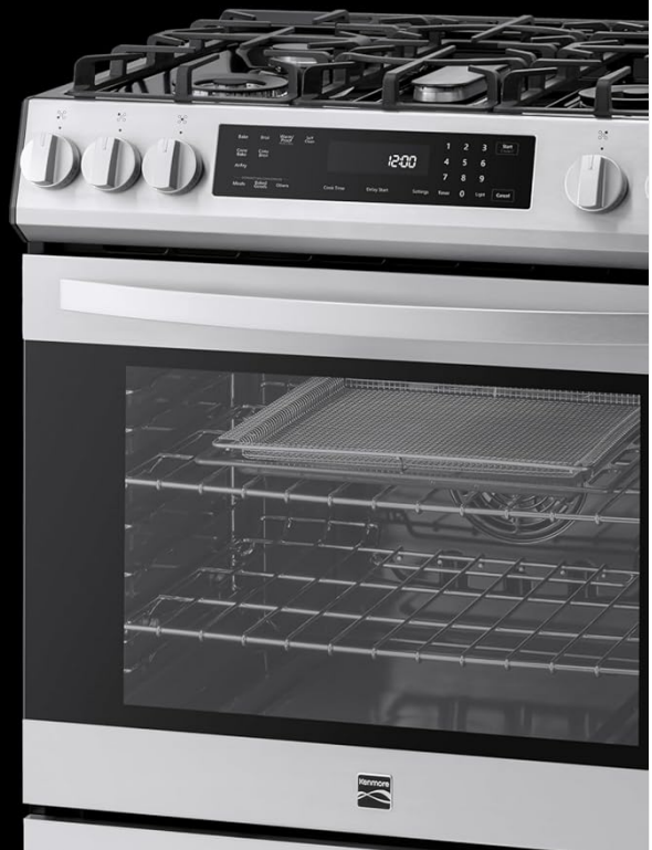
Close-up of the control panel and cooktop burners.