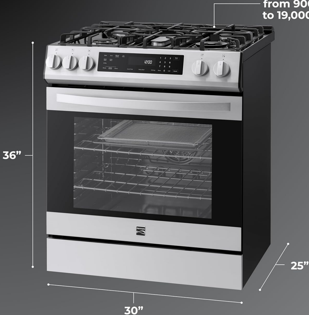
Front view of the Kenmore 5.6 cu. ft. Front Control Gas Range Oven.

Burners range from 900 BTUs to 19,000 BTUs