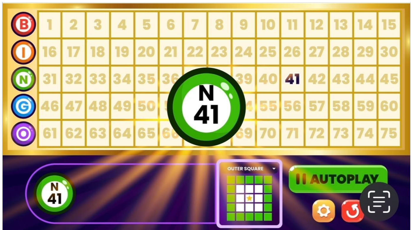
Figure 3: The TV Bingo game screen displaying called numbers.