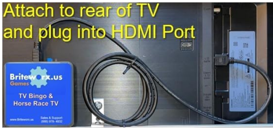
Figure 2: Connecting the game device to a TV's HDMI port.