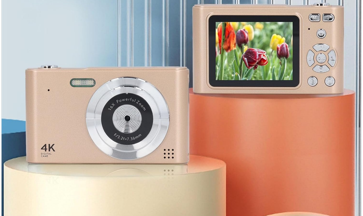
Image: Front and back view of the PUSOKEI 4K Digital Camera, highlighting its 4K capability, 16X digital zoom, and anti-shake feature.