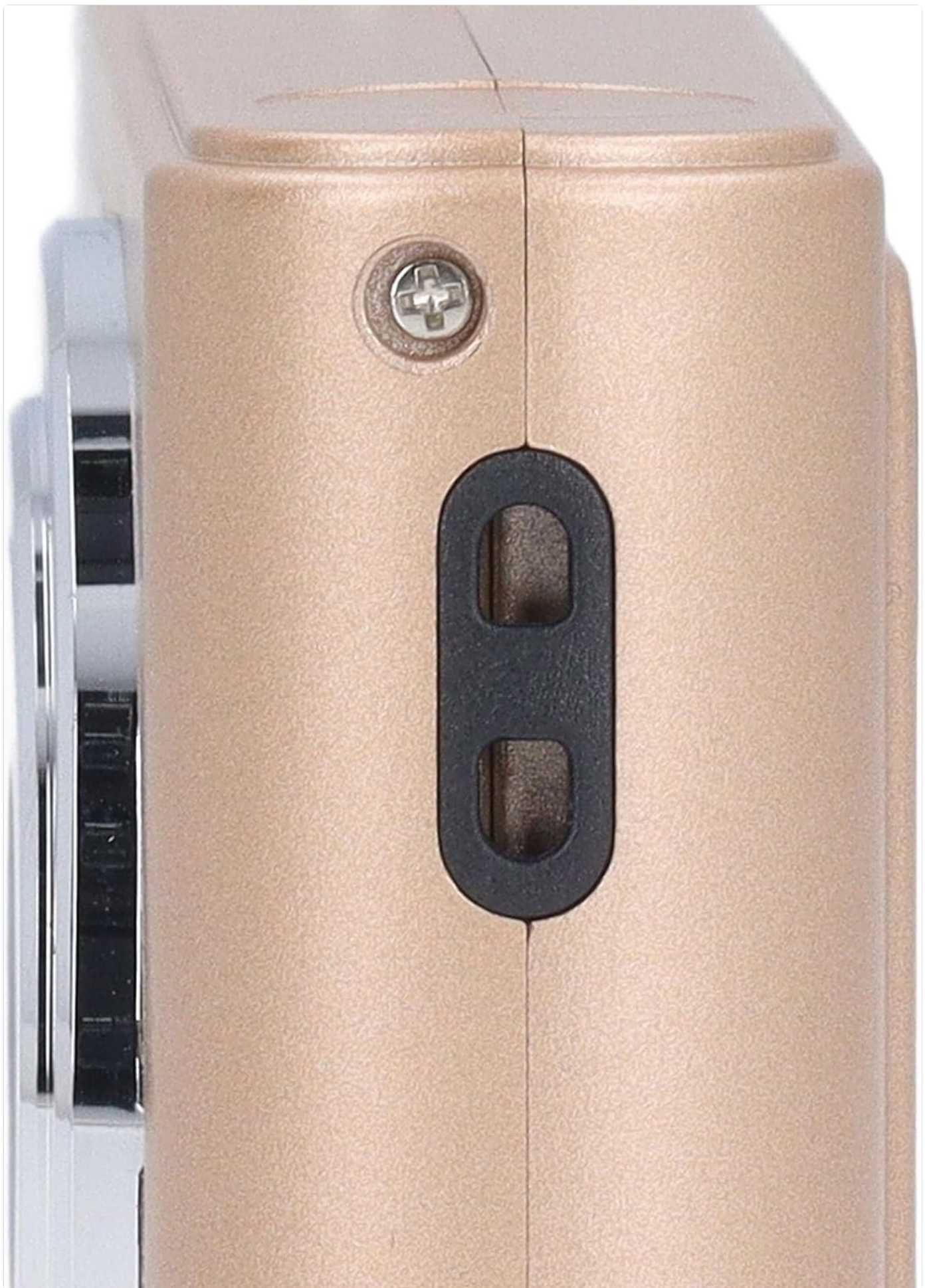
Image: Close-up view of the side of the PUSOKEI 4K Digital Camera, showing the strap loop and tripod screw hole.