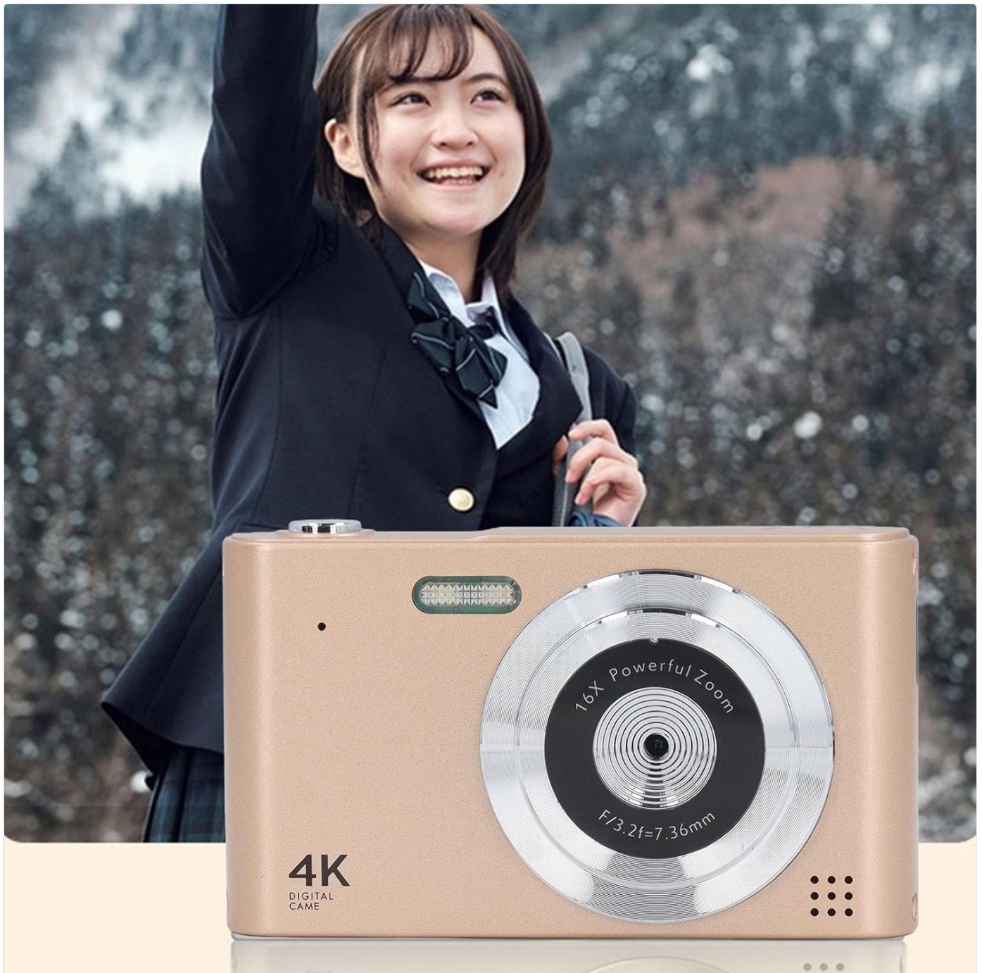
Image: The PUSOKEI 4K Digital Camera shown in use, capturing a moment with a person in a natural, outdoor setting.