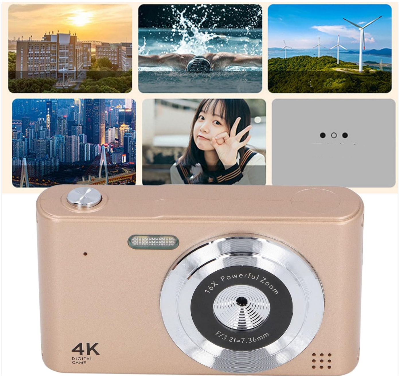
Image: The PUSOKEI 4K Digital Camera positioned against a background of various scenic photographs, illustrating its versatility.