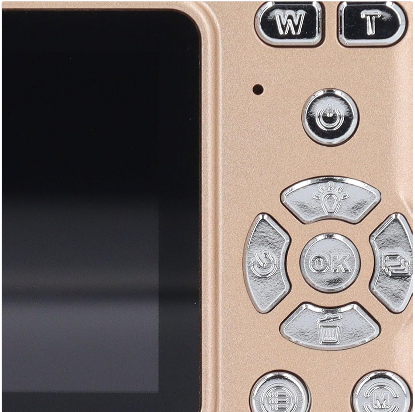
Image: Close-up of the camera's back panel, showing the power button, zoom controls (W/T), navigation buttons, OK button, and menu/delete buttons.

Press and hold the Power button (usually marked with a circle and a vertical line) to turn the camera on or off. The 2.4-inch screen will illuminate.