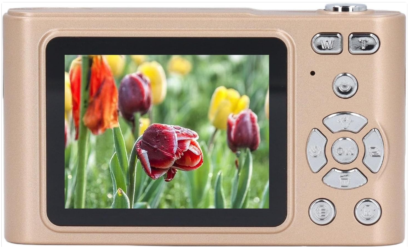
Image: Back view of the PUSOKEI 4K Digital Camera displaying a vibrant image of tulips on its screen.