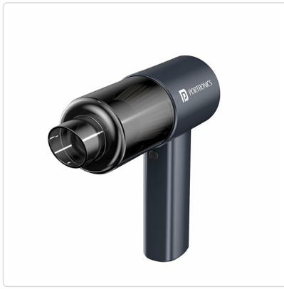
The main unit of the Portronics Mopcop Pro.