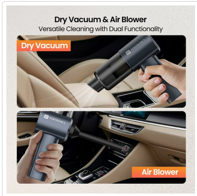
The device demonstrating its dual dry vacuum and air blower functionality.