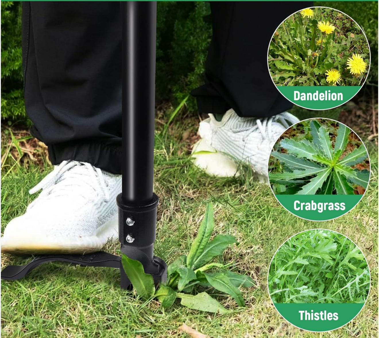
Image: The weed puller shown effectively removing different types of weeds, including dandelion, crabgrass, and thistles, highlighting its versatility.