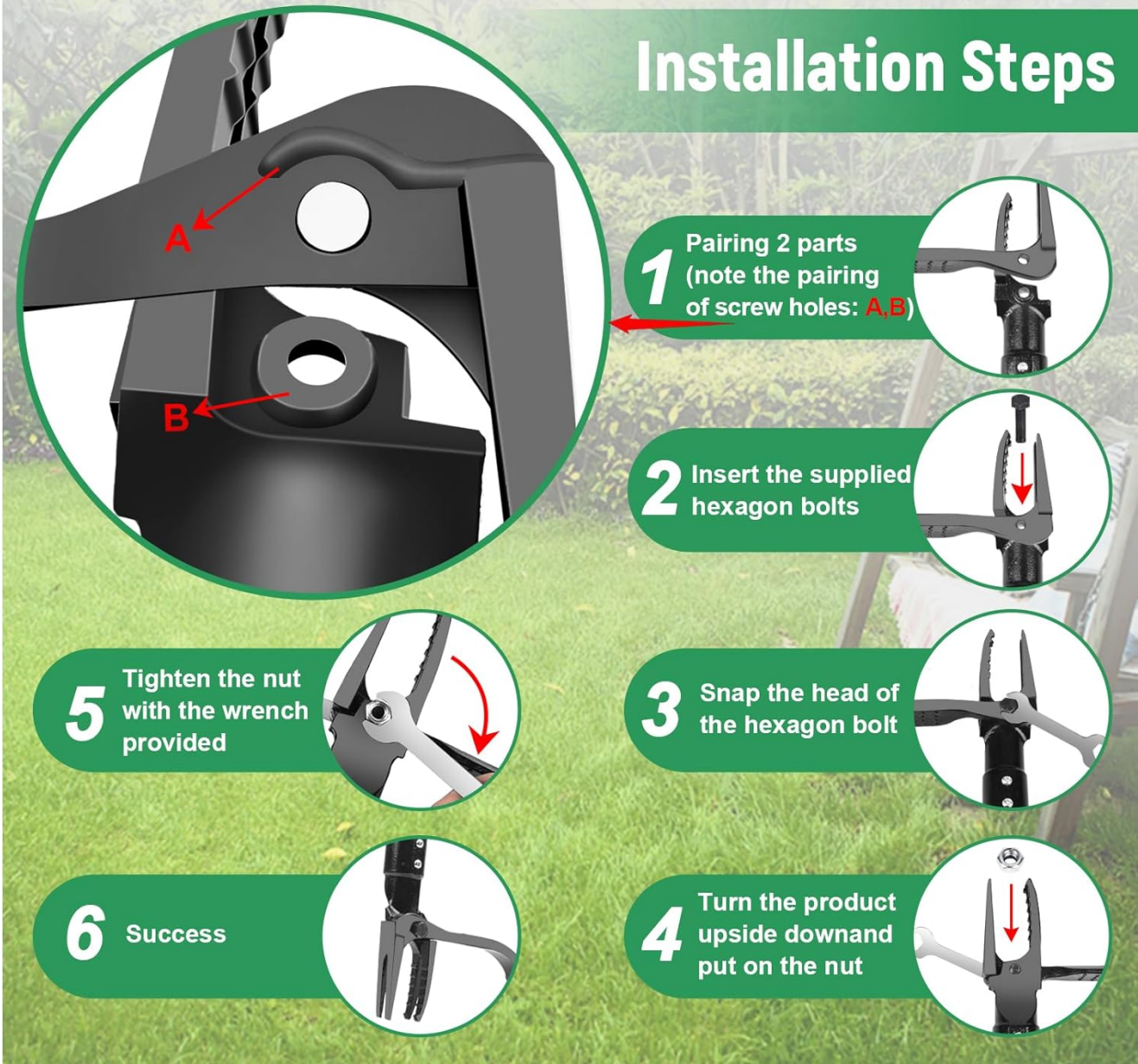
Image: Visual guide illustrating the six steps for assembling the weed puller, from pairing parts to tightening the nut with the provided wrench.