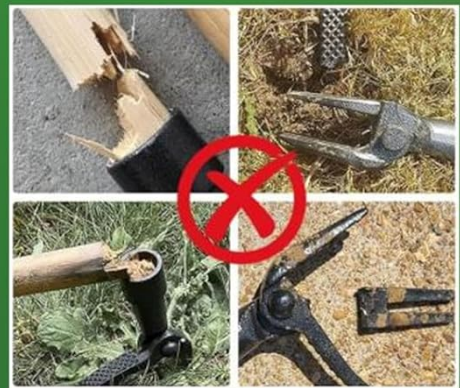
Image: Detailed view of the patented foot pedal and cast steel four-claw head, emphasizing its design for reduced breakage and effective root grabbing.