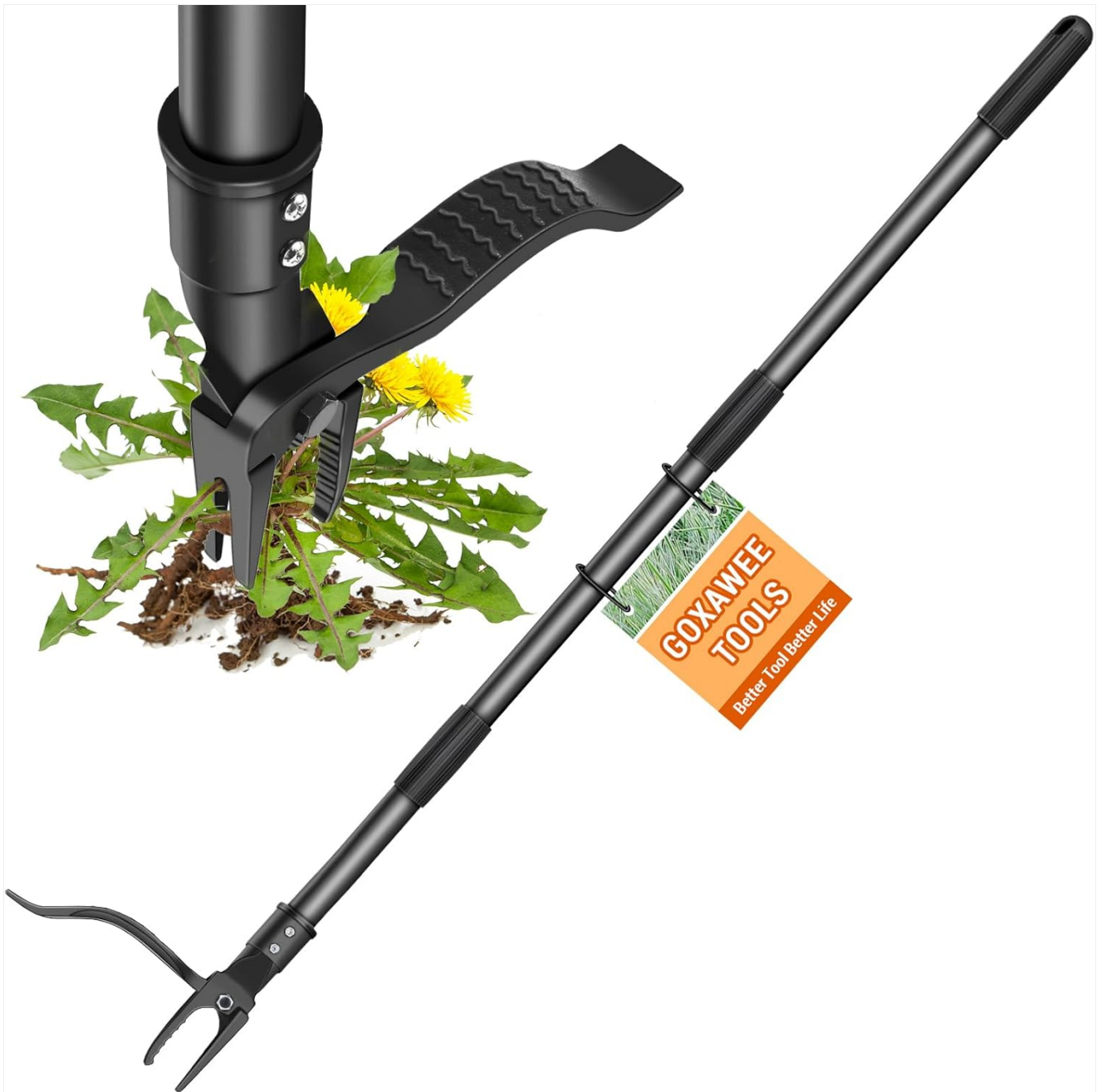
Image: The GOXAWEE 4-Claw Stand Up Weeder, showing its long handle and claw mechanism, with a small weed being pulled in the background.