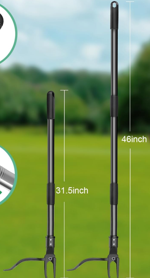
Image: Breakdown of the weed puller's components, including the comfortable hand grip, thickened stainless steel connector, three-section threaded pole, and upgraded cast steel head, illustrating its adjustable length from 31.5 inches to 46 inches.