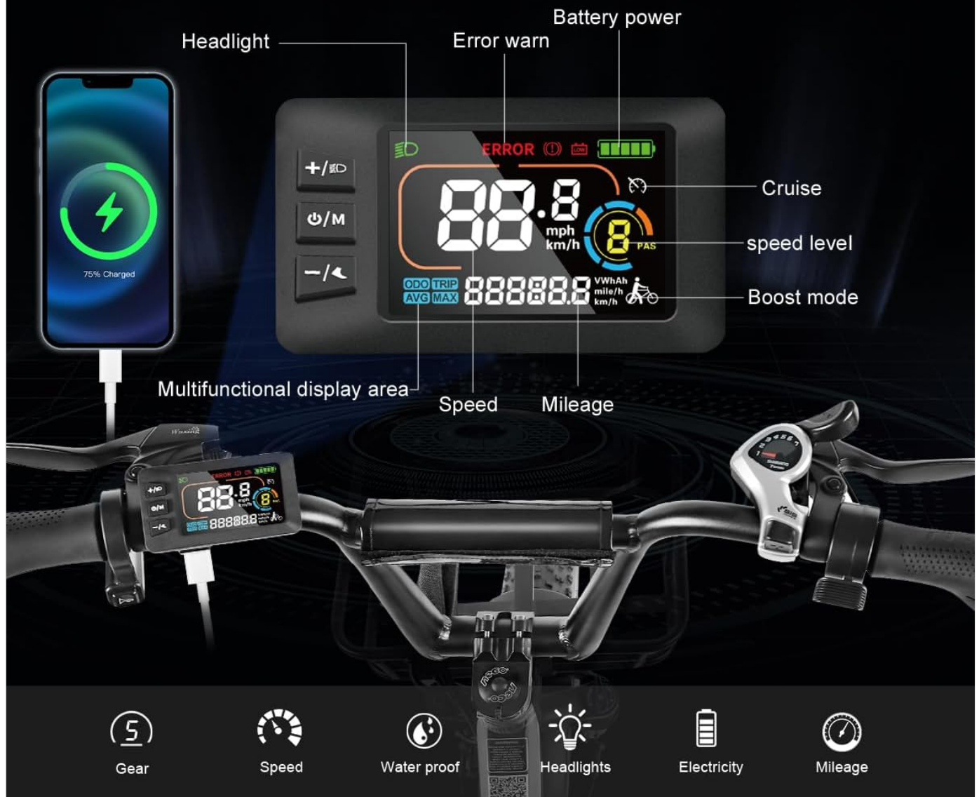
Figure 5.3: Overview of the intelligent colorful LCD display and handlebar controls.

Colorful LCD screen, larger screen, richer display information, real-time control of ebike status