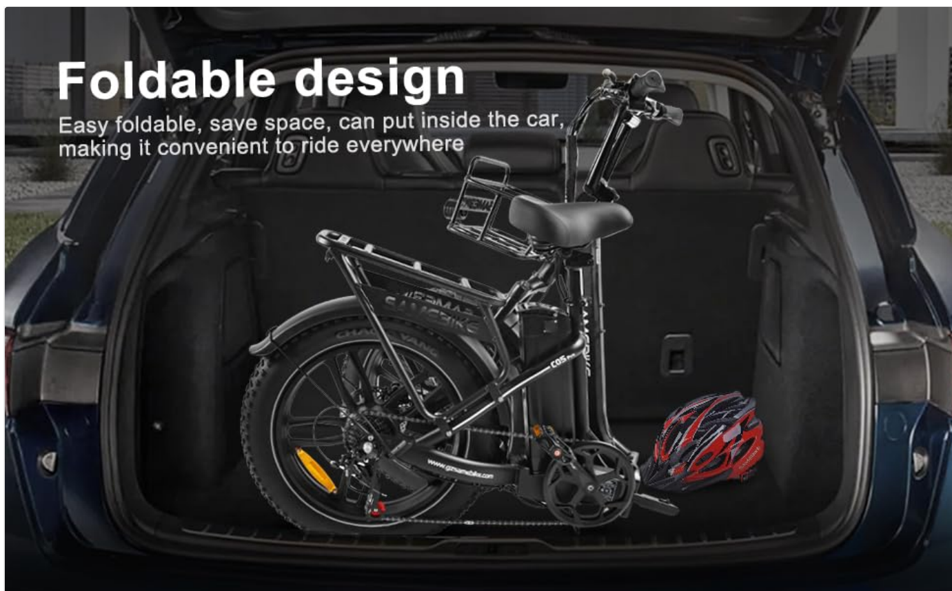
Figure 5.6: The e-bike in its folded configuration, demonstrating space-saving.