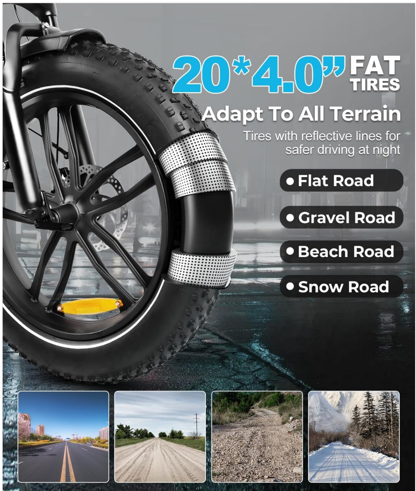
Figure 5.4: Close-up of the 20x4.0 inch fat tire, suitable for all terrains.