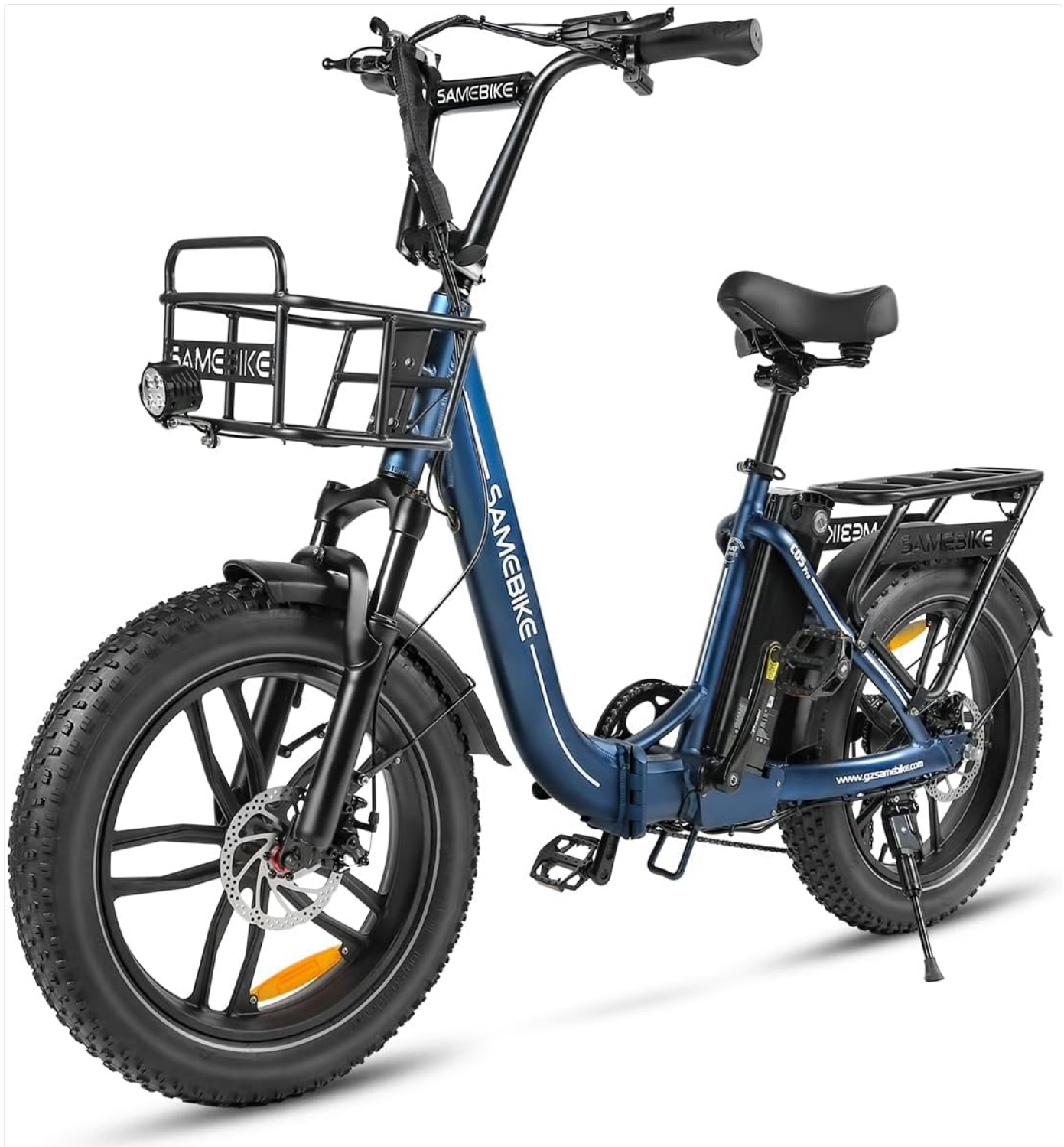
Figure 4.1: Fully assembled SAMEBIKE C05 Pro Electric Bicycle.