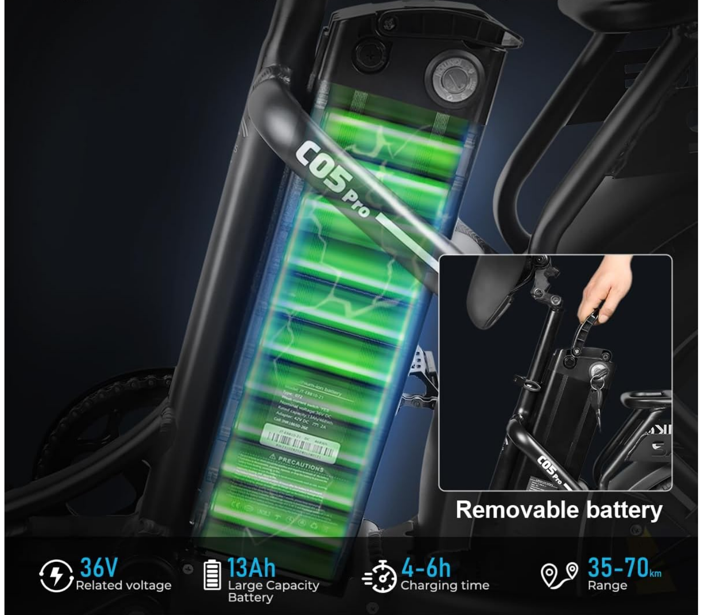
Figure 5.2: The 36V 13Ah removable lithium-ion battery.

Upgraded 468Wh Large Capacity Battery Supply Longer Riding