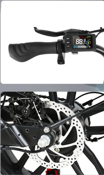
Figure 5.5: Detail of the mechanical disc brake system.