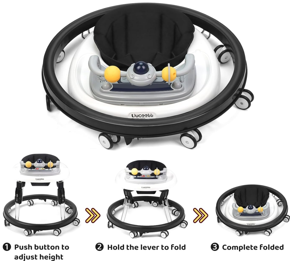
Figure 6: Convenient One-touch Folding Operation

The baby walker with wheels easy to assemble & foldable