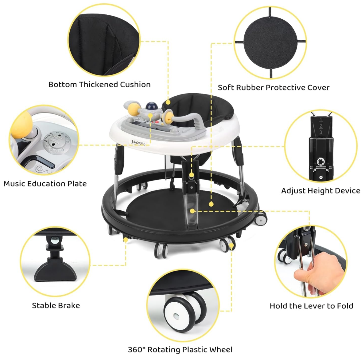
Figure 7: Key Components of the Baby Walker