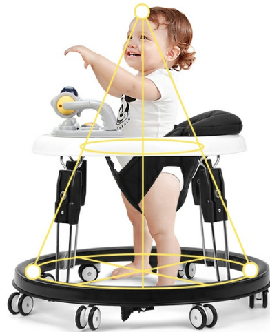
Figure 3: Proper height adjustment helps prevent O-legs