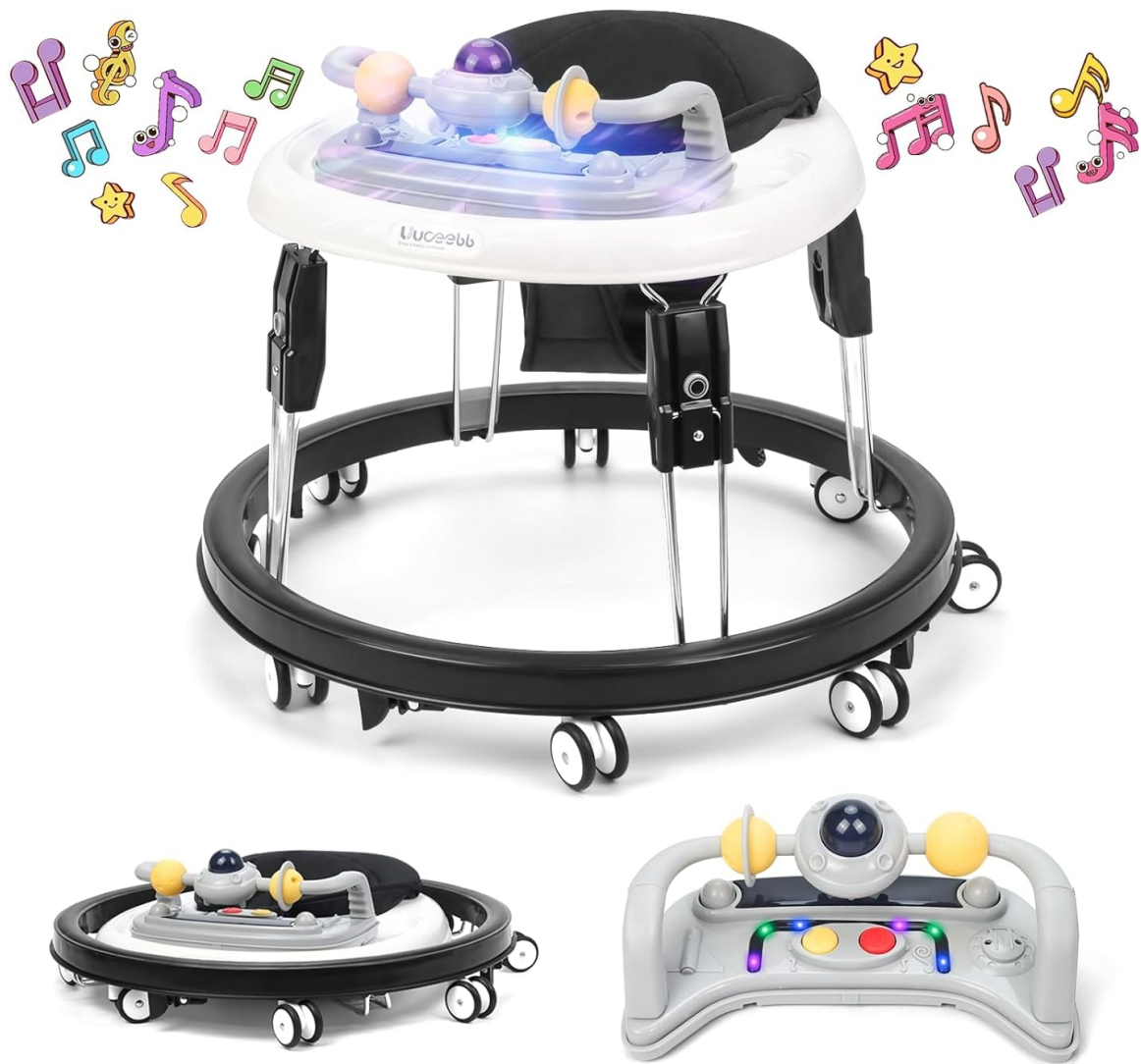
Figure 1: Uuoeebb Baby Walker Overview