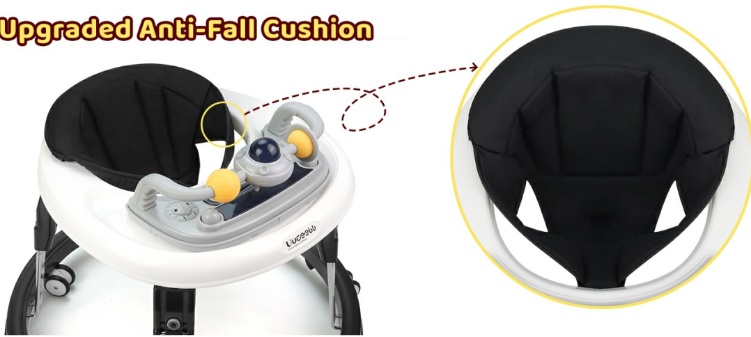
Figure 2: Upgraded Anti-Fall Cushion for enhanced safety