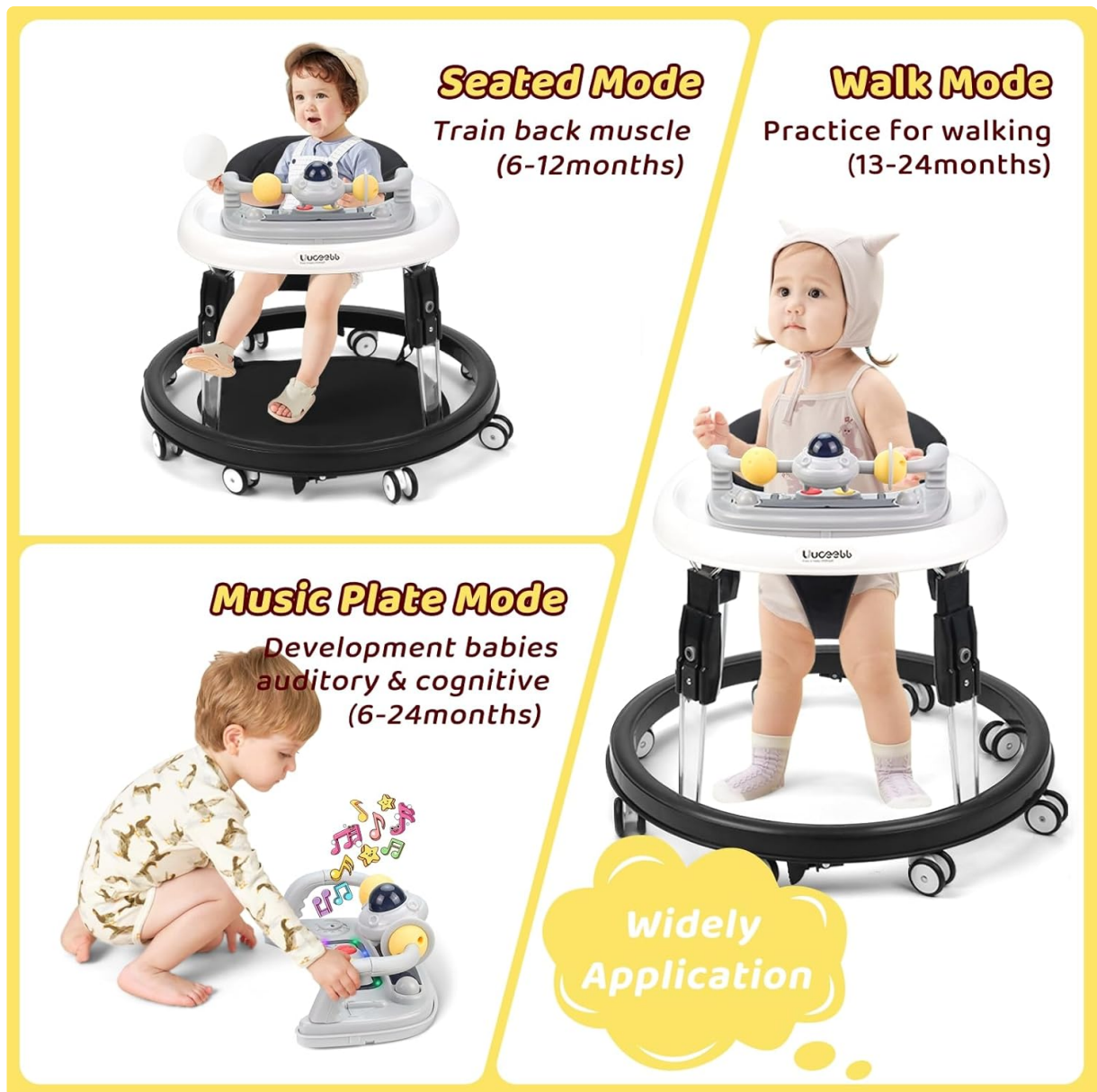
Figure 8: Seated, Walk, and Music Plate Modes