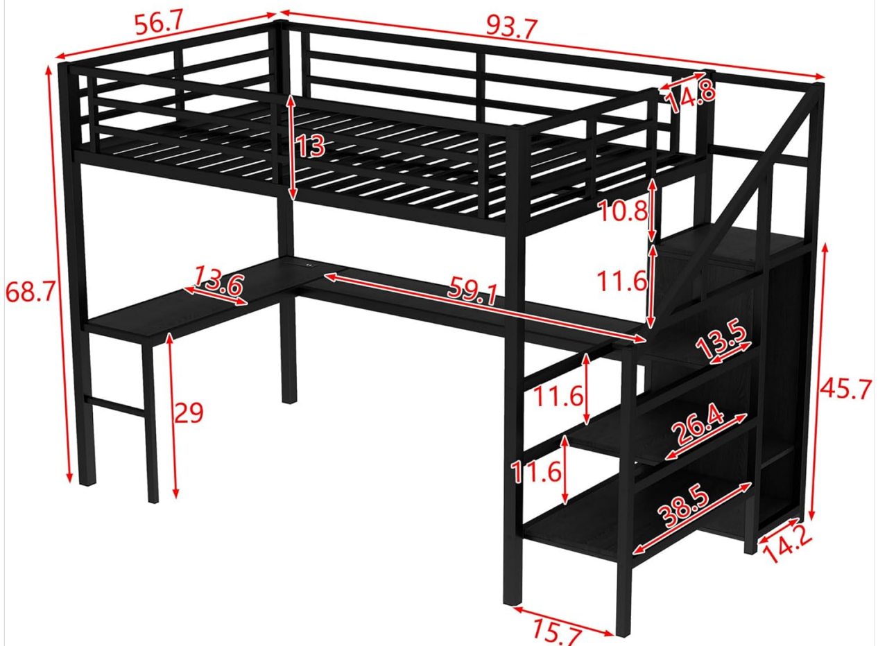
Image: Detailed dimensions of the loft bed, including length, width, height, and individual component measurements in inches.