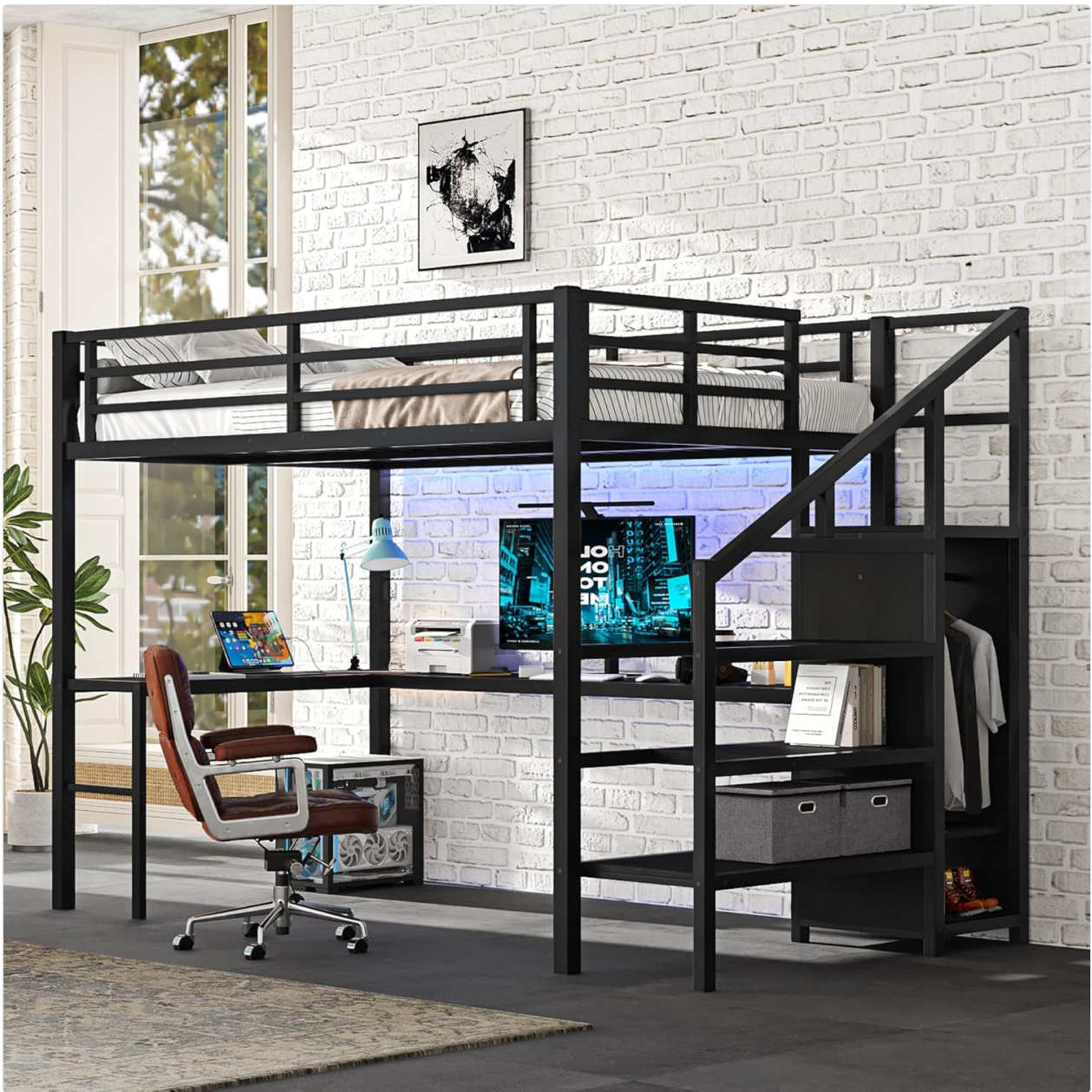
Image: The HZSMHDZKJ Full Size Metal Loft Bed in a modern room, showcasing the L-shaped desk with a computer setup, the upper bed, and the integrated storage stairs and wardrobe.