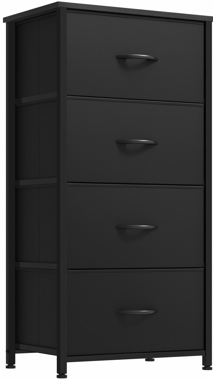
Image: The YITAHOME 4-Drawer Storage Tower in Cool Black, shown in a bedroom setting next to a bed.