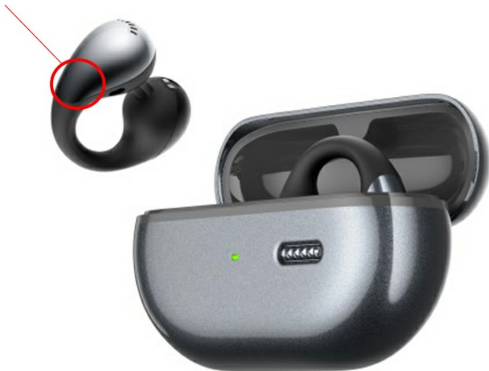
Image: This image highlights the touch panel area on the PearlClip earbud, indicated by a red circle and the label 'タッチパネル'. The earbud is shown next to its open charging case.