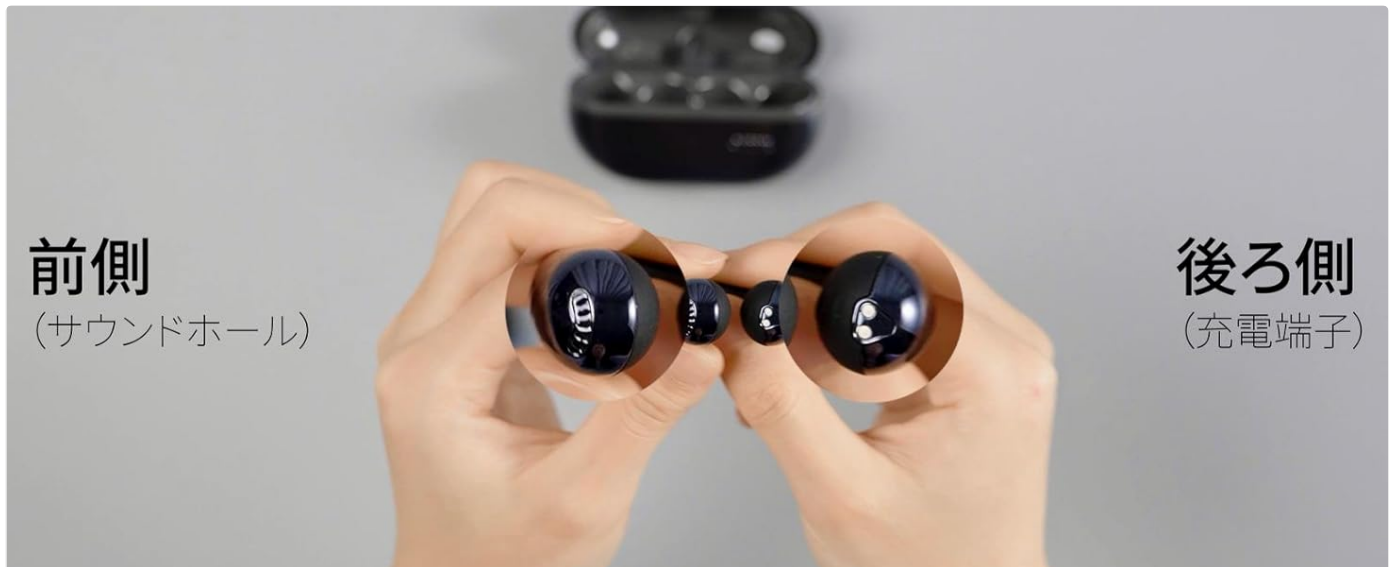
Image: This image displays the front and back of the PearlClip earbuds. The front side is labeled ' ( ) ' indicating the sound hole, and the back side is labeled ' ( ) ' indicating the charging terminals.

Identify the front and back of each earbud. The sound hole is located on the front side, and the charging terminals are on the back side.