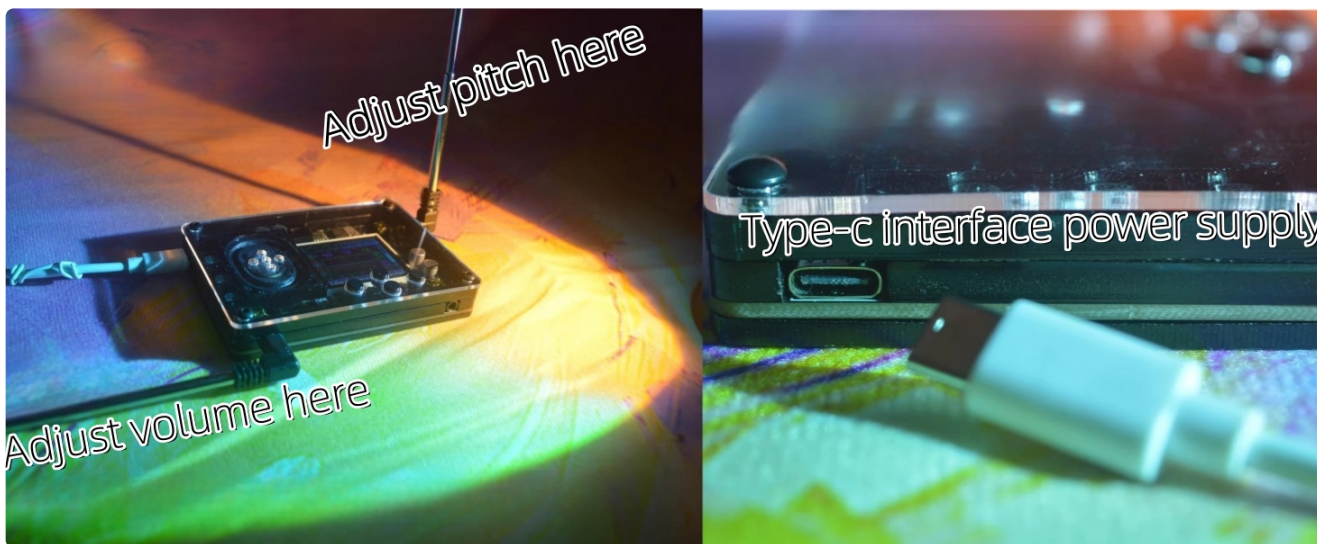
Image: The Type-C interface is used for power supply.

Connect the provided Type-C USB cable to the DC IN (Type-C) port on the theremin and to a suitable power source.