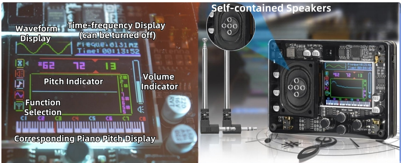
Image: The color display provides visual feedback on waveform, frequency, pitch, volume, and piano notes.

The integrated color display provides real-time visual feedback. It shows the waveform, time frequency, and current volume levels. Additionally, it displays a tone indicator and a corresponding piano tone display to help with pitch accuracy.