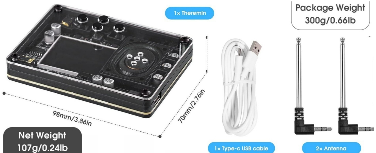
Image: The package includes the Mini Theremin unit, a Type-C USB cable, and two antennas.