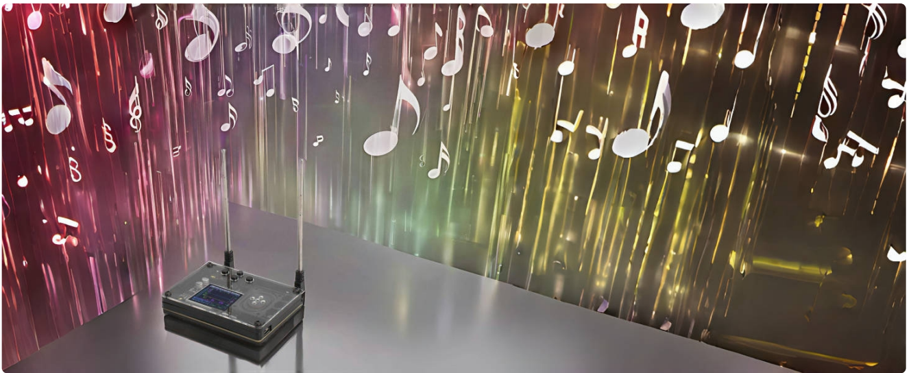
Image: The Mini Theremin offers an easy-to-use interface with assisted pitch correction.