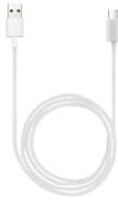
1×TYPE-C POWER CORD