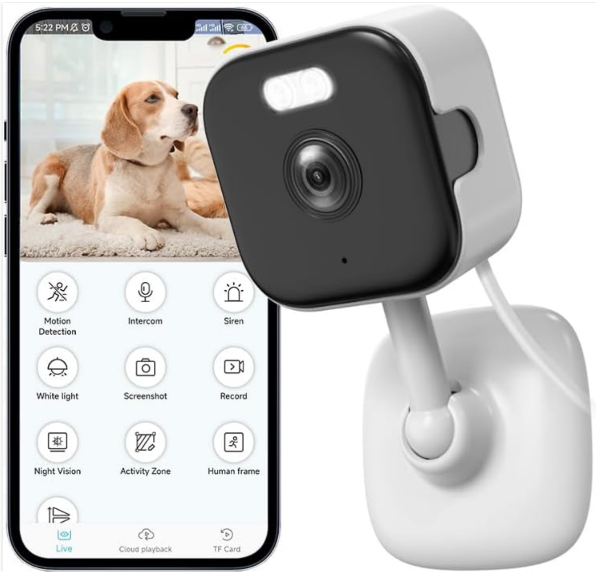
Image: The PHANSATIM 5MP WiFi Indoor Security Camera shown next to a smartphone displaying its live view and control options, including motion detection, intercom, siren, night vision, and recording.