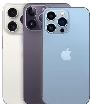
iPhone 15/14/13/ 12 Series with Magsafe