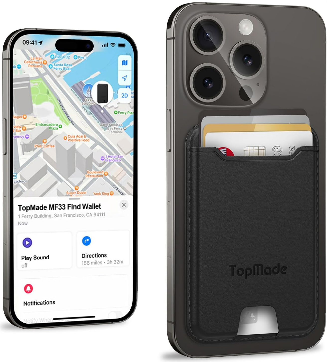
Image: The TopMade MF33 Magnetic Wallet shown attached to an iPhone, alongside a display of the Apple Find My application indicating the wallet's location.