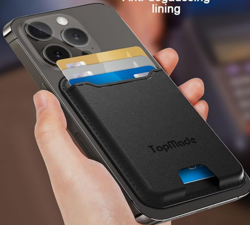
Image: The TopMade MF33 Magnetic Wallet with cards inserted, illustrating its anti-degaussing and RFID barrier lining, positioned near a point-of-sale terminal.