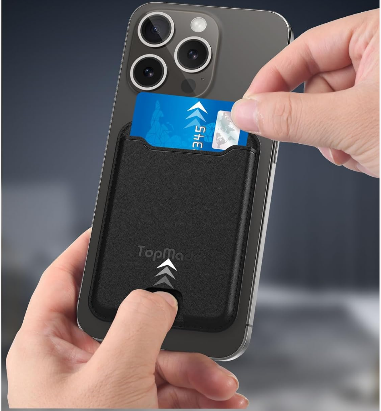
Image: A hand using the thumb slot to push a credit card out of the TopMade MF33 Magnetic Wallet for quick access.