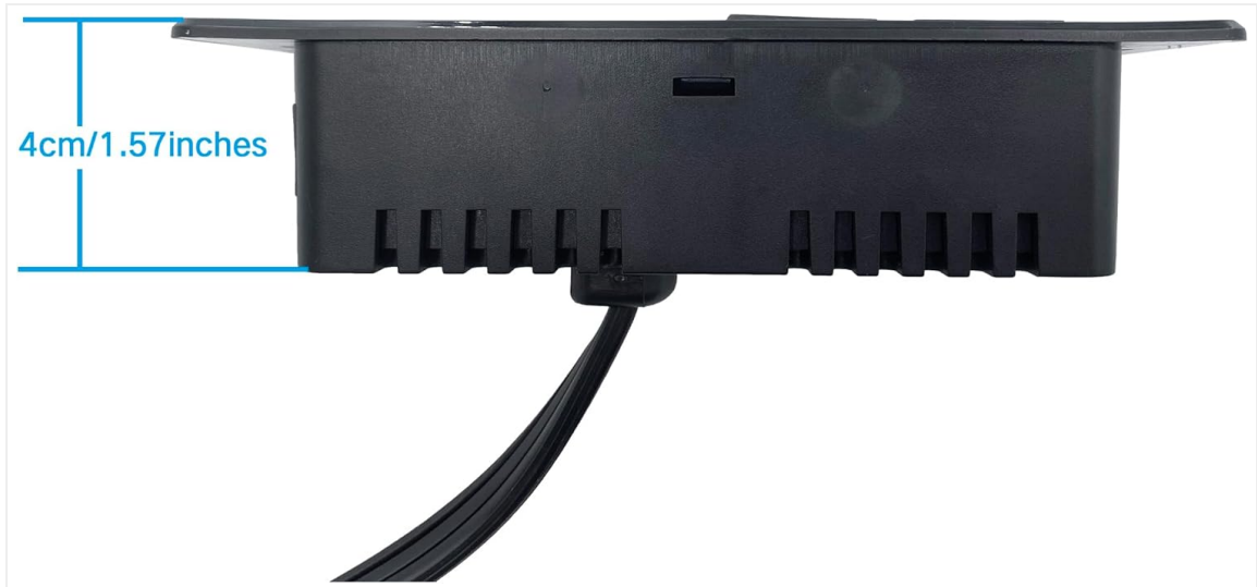
Figure 5.3: Side view displaying the depth of the recessed power strip, which is approximately 4 cm (1.57 inches).