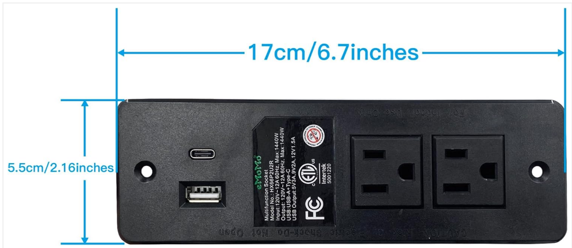
Figure 5.1: Top-down view illustrating the overall length (17 cm / 6.7 inches) and width (5.5 cm / 2.16 inches) of the power strip's faceplate.