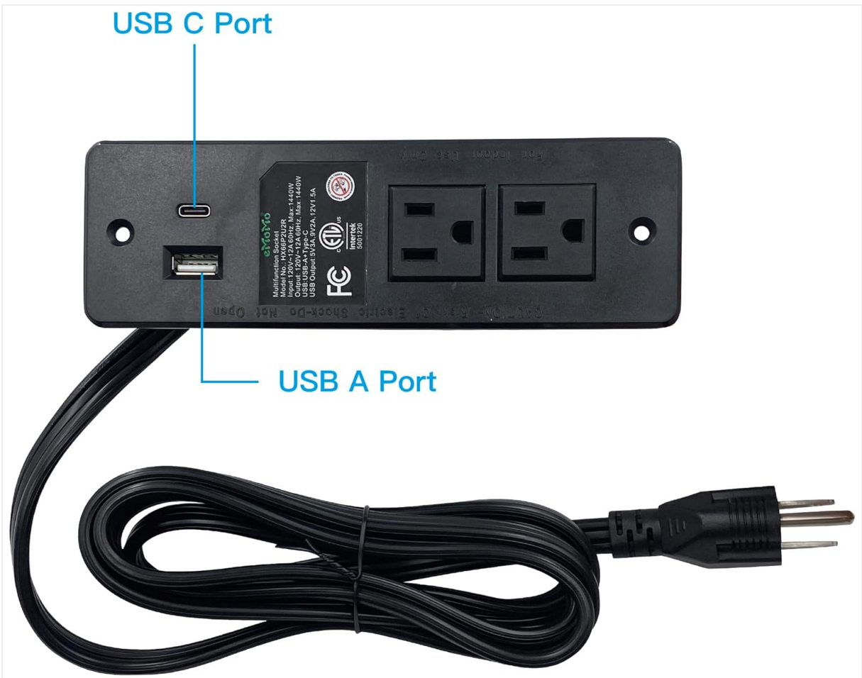
Figure 3.2: Detailed view highlighting the USB-A and USB-C charging ports on the power strip's front panel.