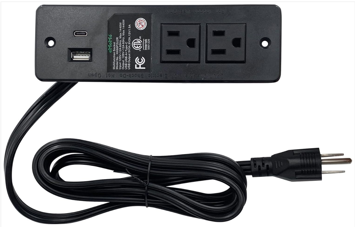
Figure 3.1: Front view of the Emomo HX66P2U2R recessed power strip, showing the two AC outlets, USB-A and USB-C ports, and the attached power cord.