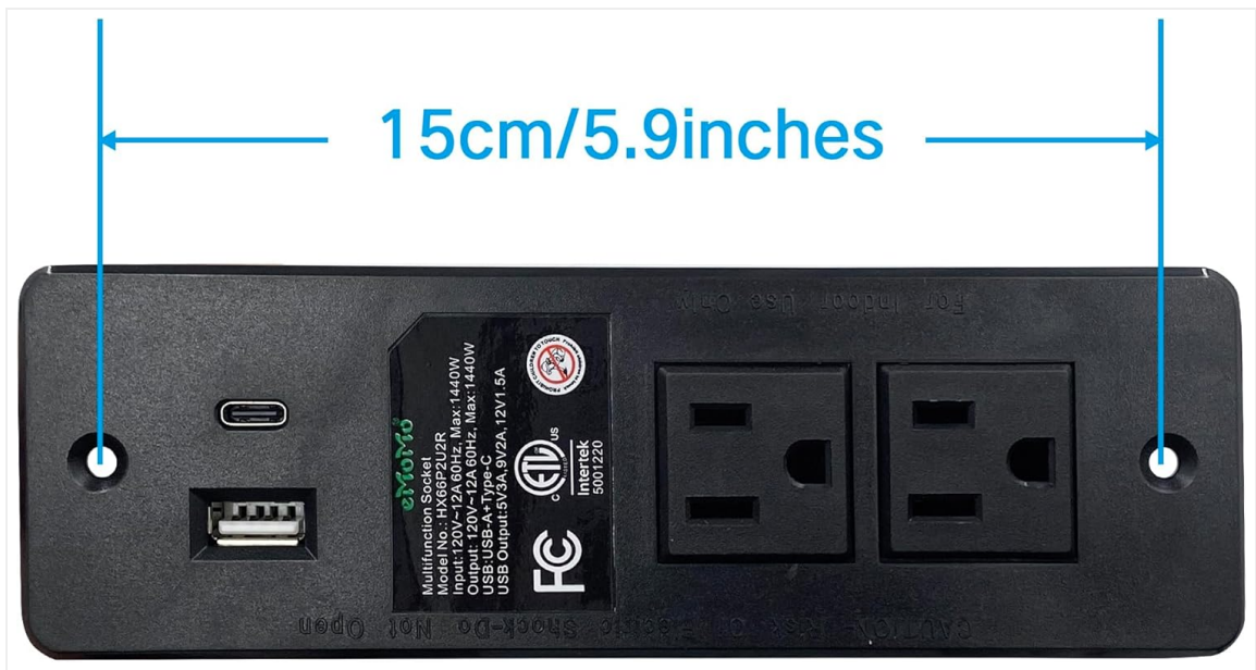
Figure 5.2: Front view indicating the recommended cutout length of 15 cm (5.9 inches) for installation.