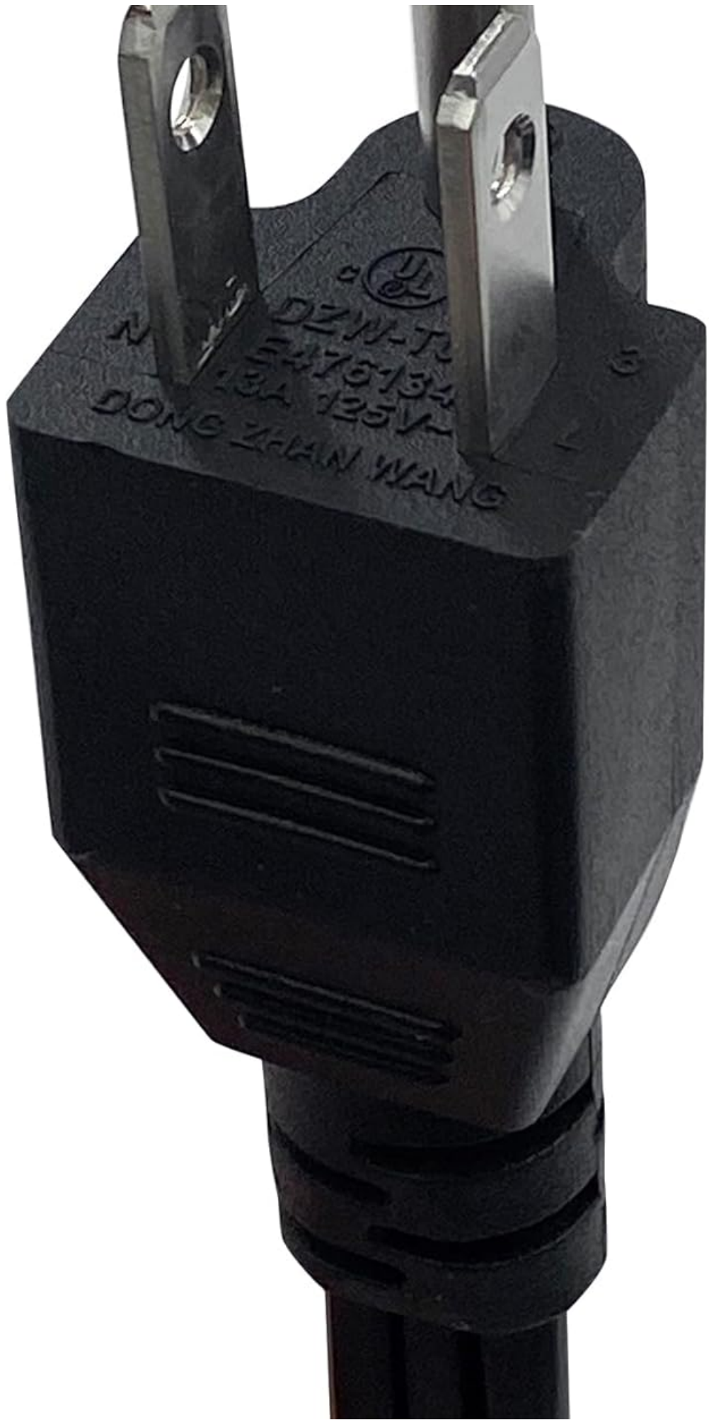
Figure 5.4: Close-up image of the standard 3-prong power plug attached to the power strip's cord.