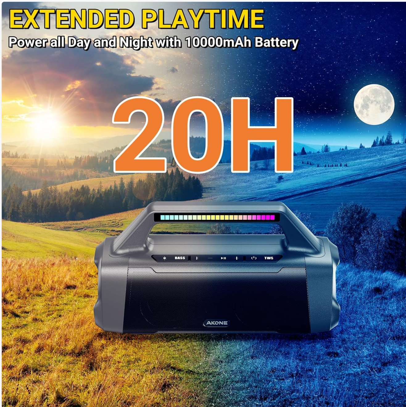
Image: The AKONE AK-ZG-01M speaker is designed for extended playtime, offering up to 20 hours of audio on a single charge thanks to its integrated 10000mAh battery.

Before first use, fully charge the speaker. Connect the USB charging cable to the speaker's charging port and to a compatible USB power adapter (not included). The charging indicator will show the charging status and turn off when fully charged. The speaker features a 10000mAh battery for extended playtime.