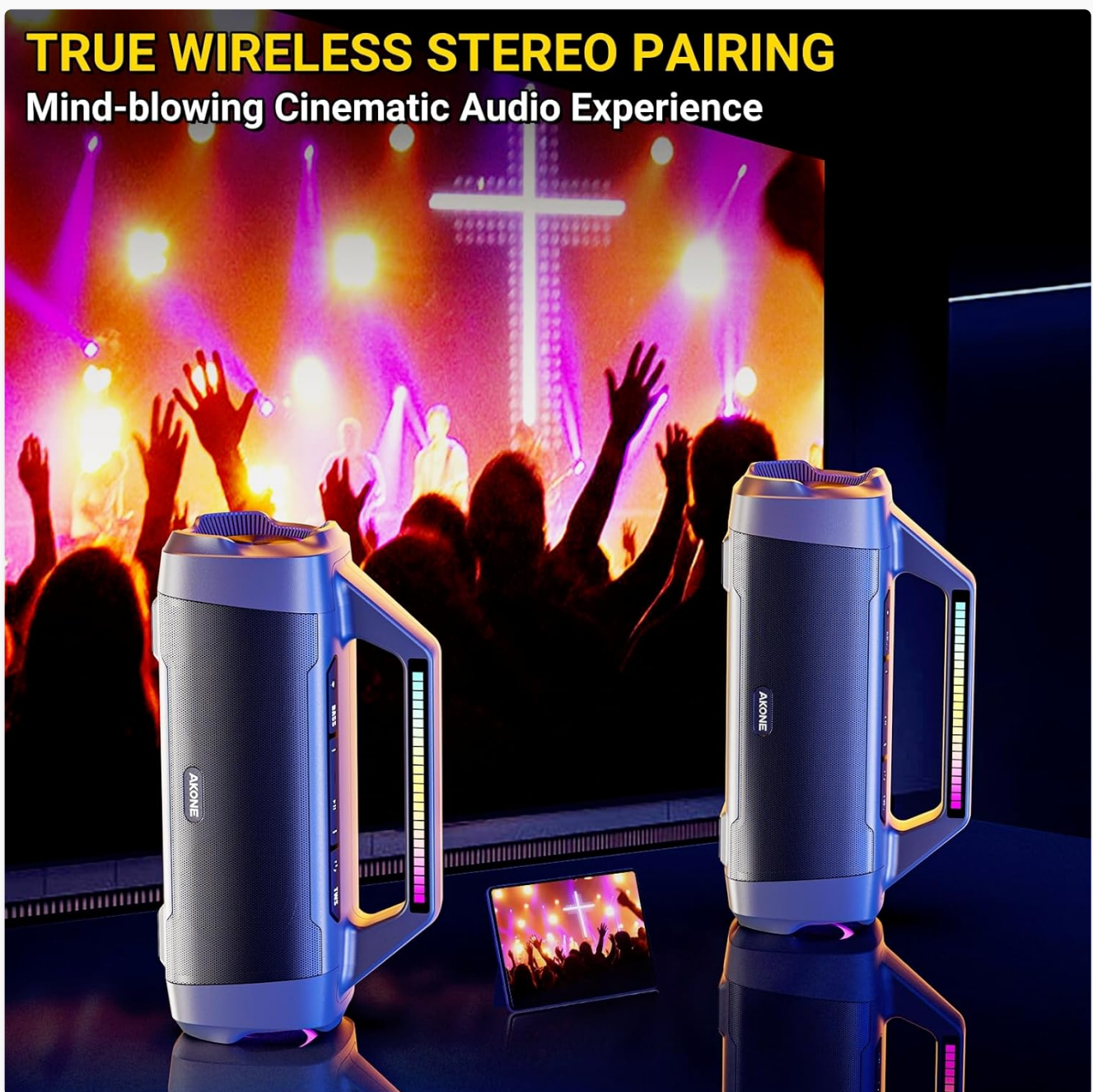
Image: Two AKONE AK-ZG-01M speakers demonstrating True Wireless Stereo (TWS) pairing for a cinematic audio experience.