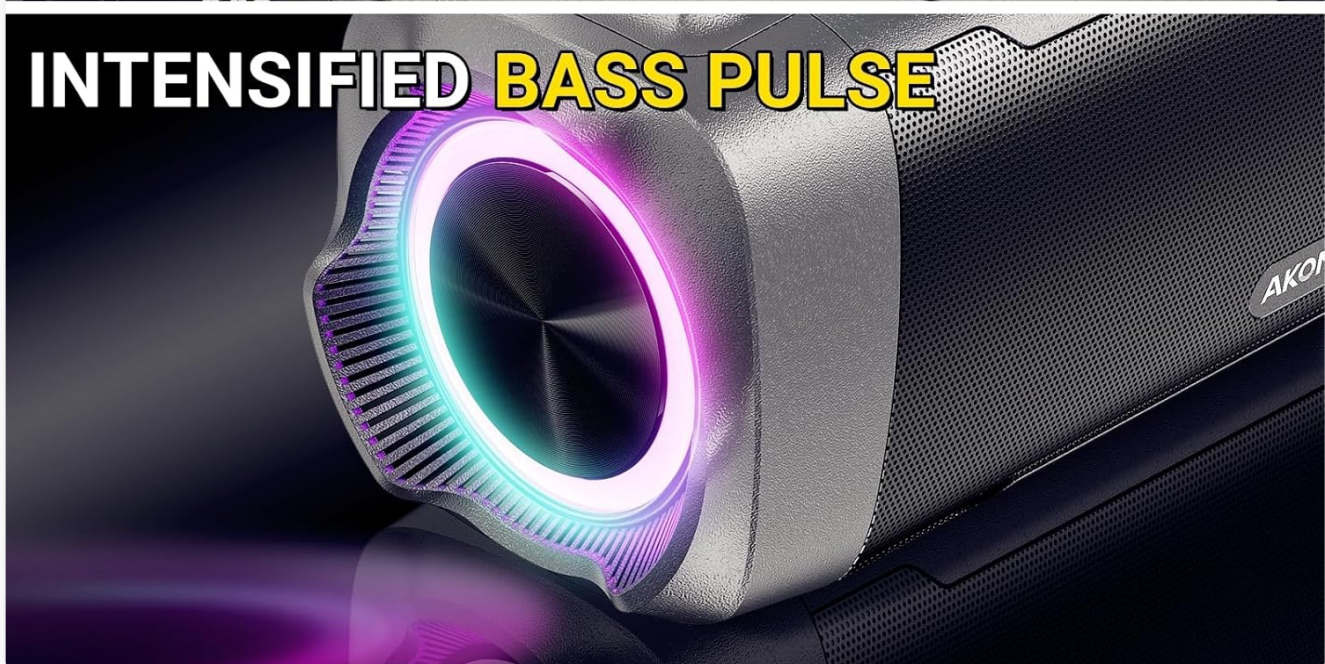
Image: The AKONE AK-ZG-01M speaker features vibrant, music-syncing lights and an intensified bass pulse for an immersive audio-visual experience.