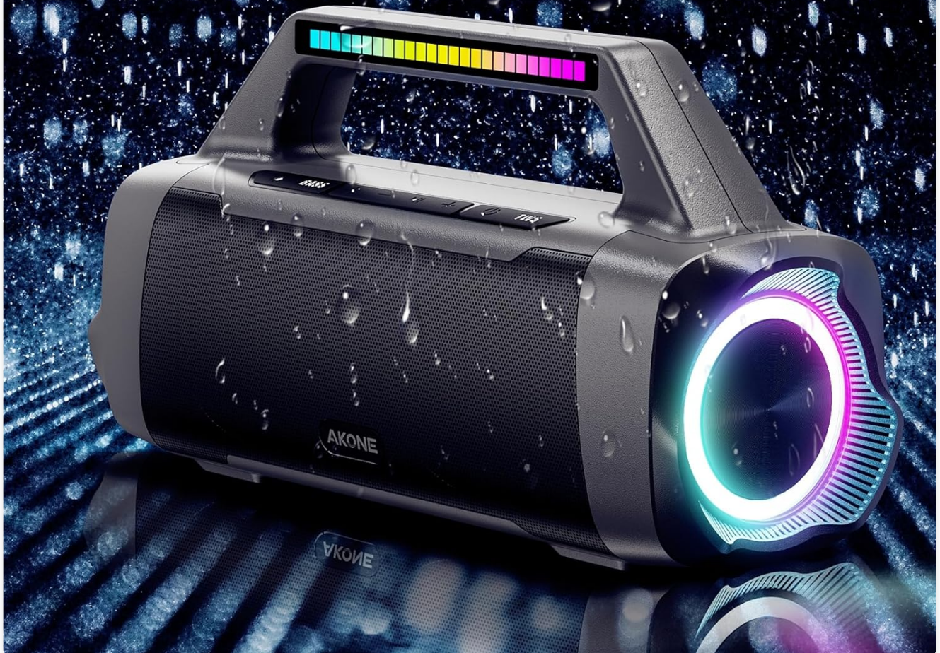
Image: The AKONE AK-ZG-01M speaker demonstrating its IP67 water and dust resistance, making it suitable for various outdoor conditions.