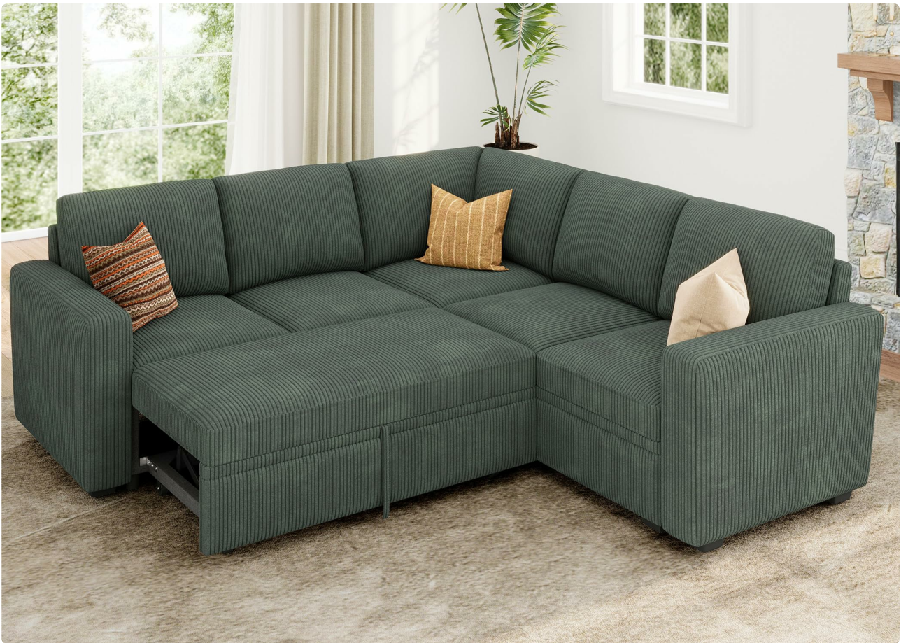
Image 1.1: The HONBAY Modular Sectional Sleeper Sofa in its standard L-shaped configuration.