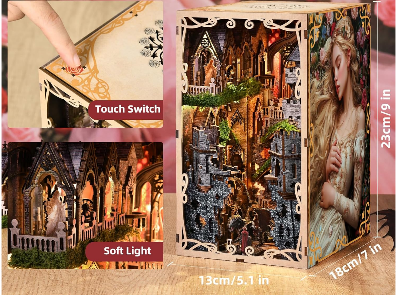
Figure 5: Demonstrates the touch switch for activating the soft LED lighting.