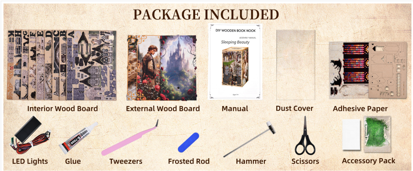
Figure 2: All included components of the Book Nook Kit.

Before beginning assembly, verify that all components listed below are present in your kit. The kit is meticulously checked before delivery to ensure completeness.