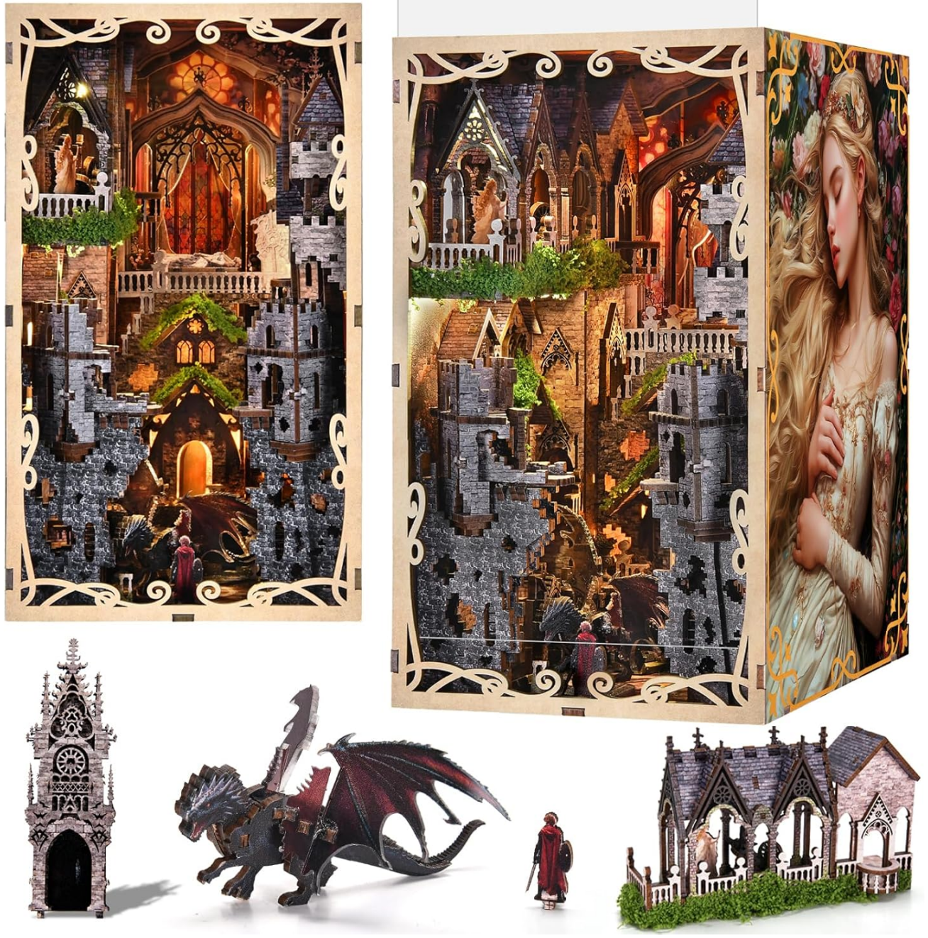
Figure 1: Fully assembled Sleeping Beauty Book Nook Kit.