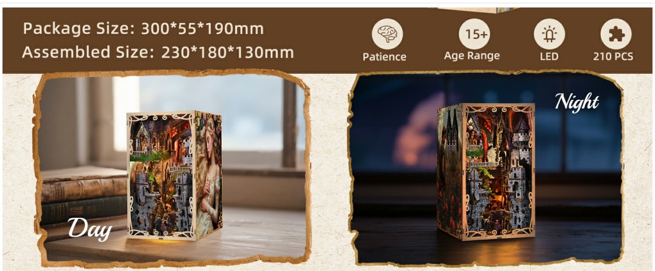
Figure 6: Comparison of the Book Nook's appearance during the day and illuminated at night.