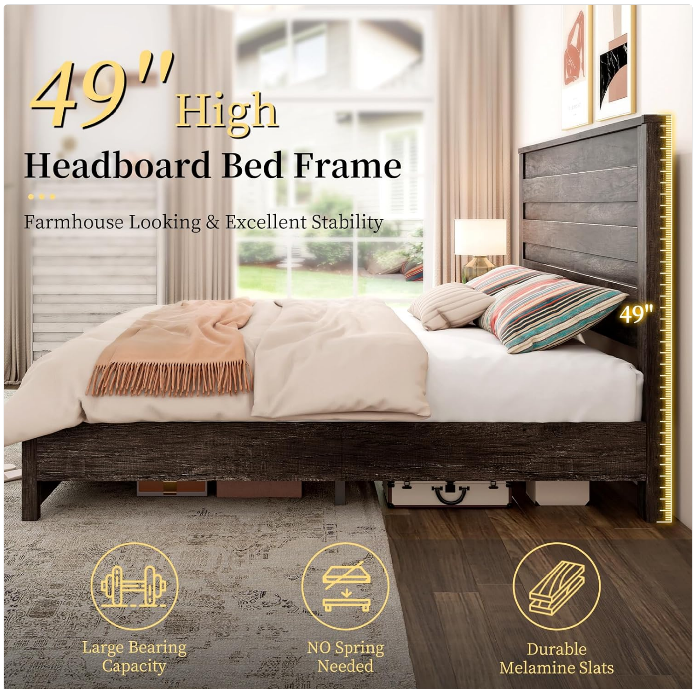
Figure 5: Key features including 49-inch headboard, no box spring, and durable slats.