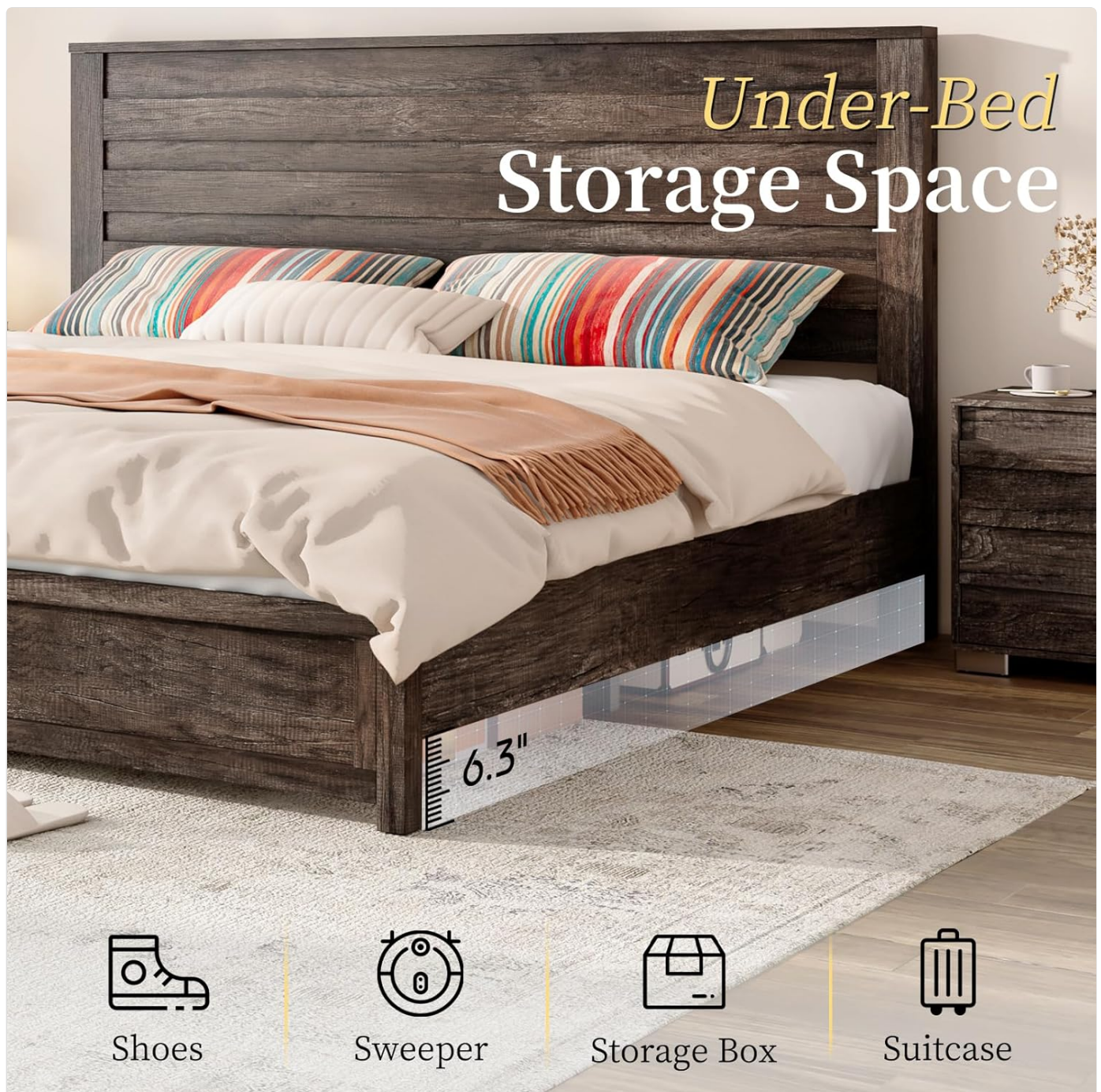
Figure 6: Under-bed clearance for storage.