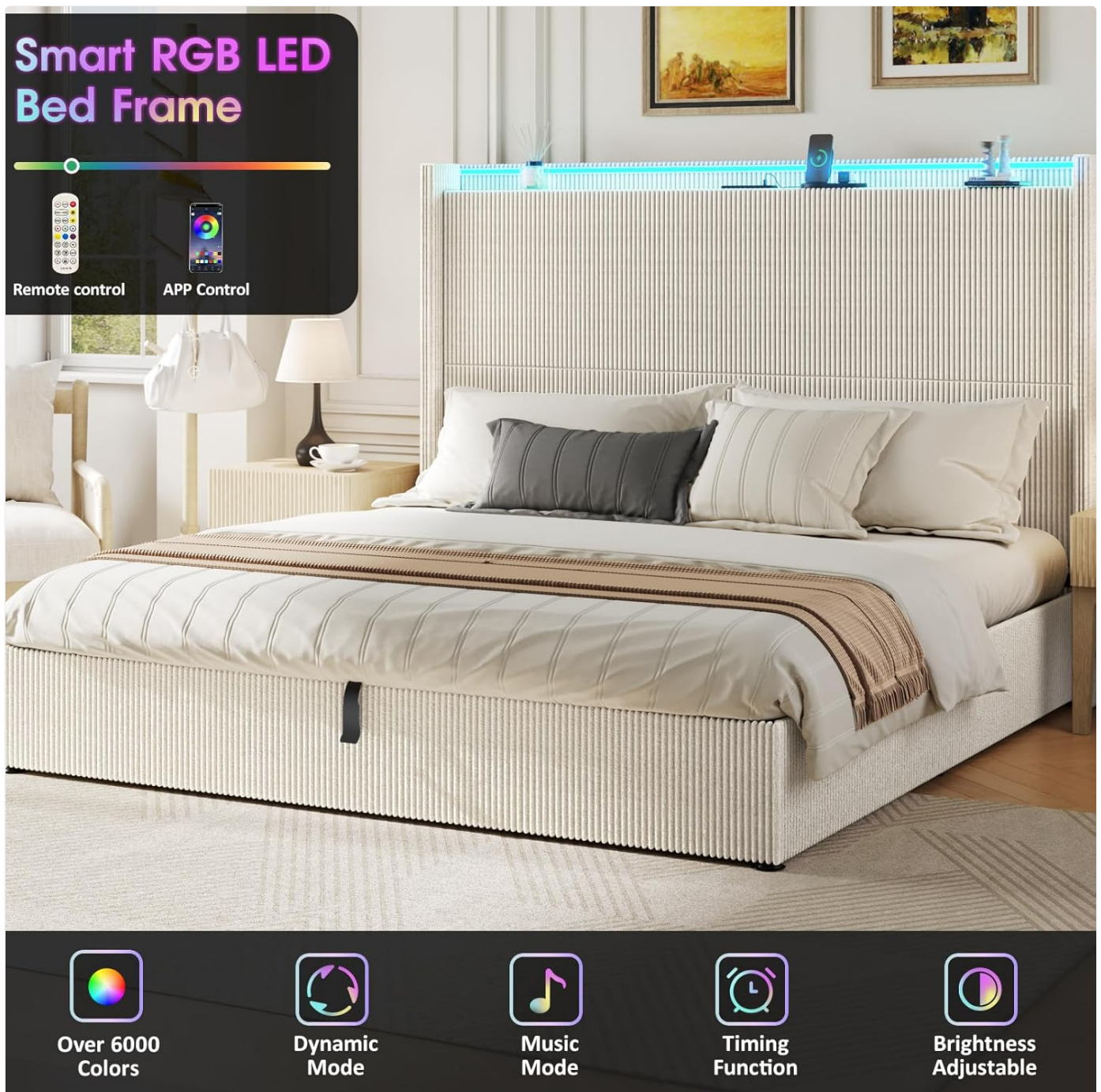
Figure 5.2: Features of the Smart RGB LED lighting system, controllable via remote or app.