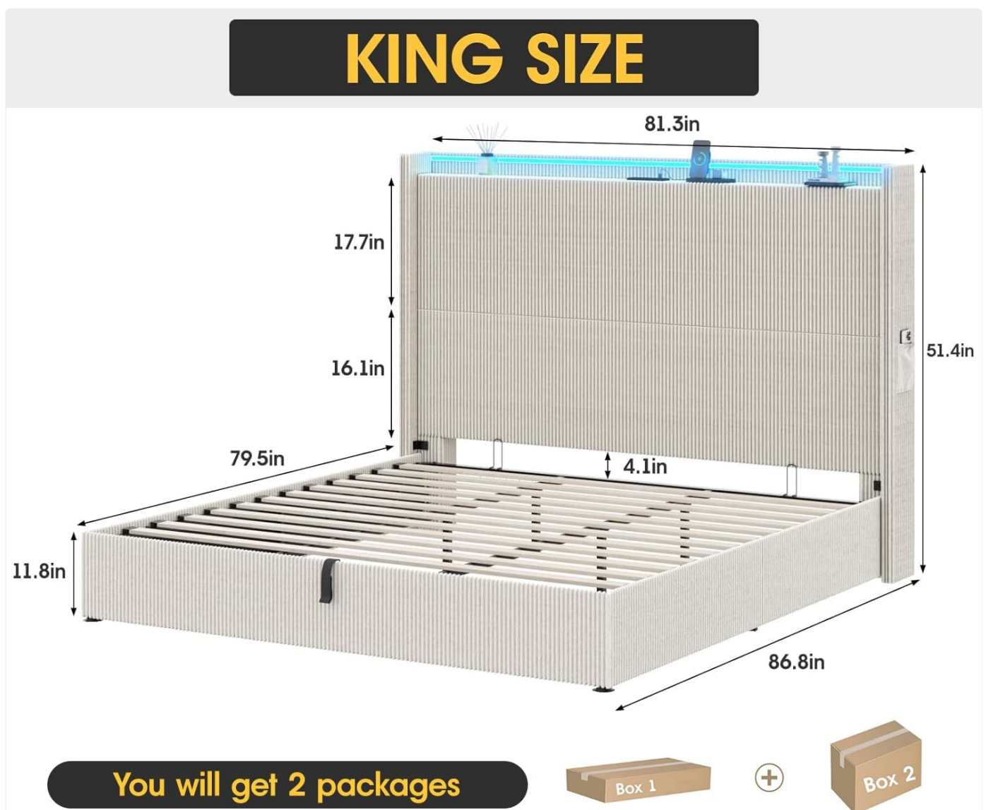
Figure 3.1: Packaging and dimensions overview. The bed frame ships in two distinct boxes.

Your Fameill King Size Lift Up Storage Bed Frame will arrive in two separate packages. Please verify that all components listed below are present before beginning assembly. If any parts are missing or damaged, please contact customer support immediately.