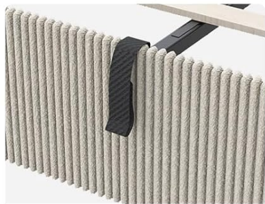
● Convenient Lifting Strap