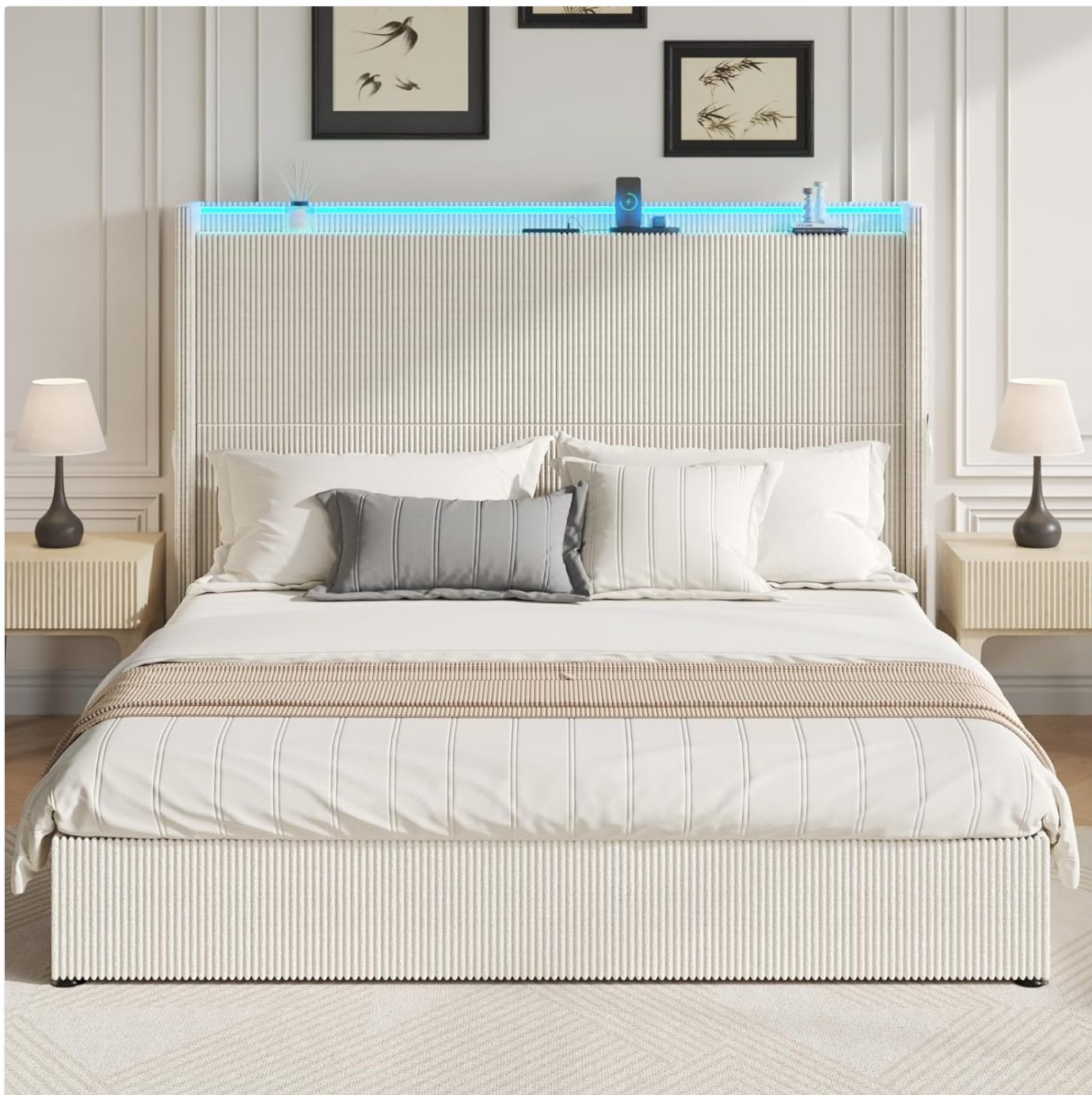
Figure 4.1: The Fameill King Size Bed Frame fully assembled, showcasing its elegant design and integrated features.