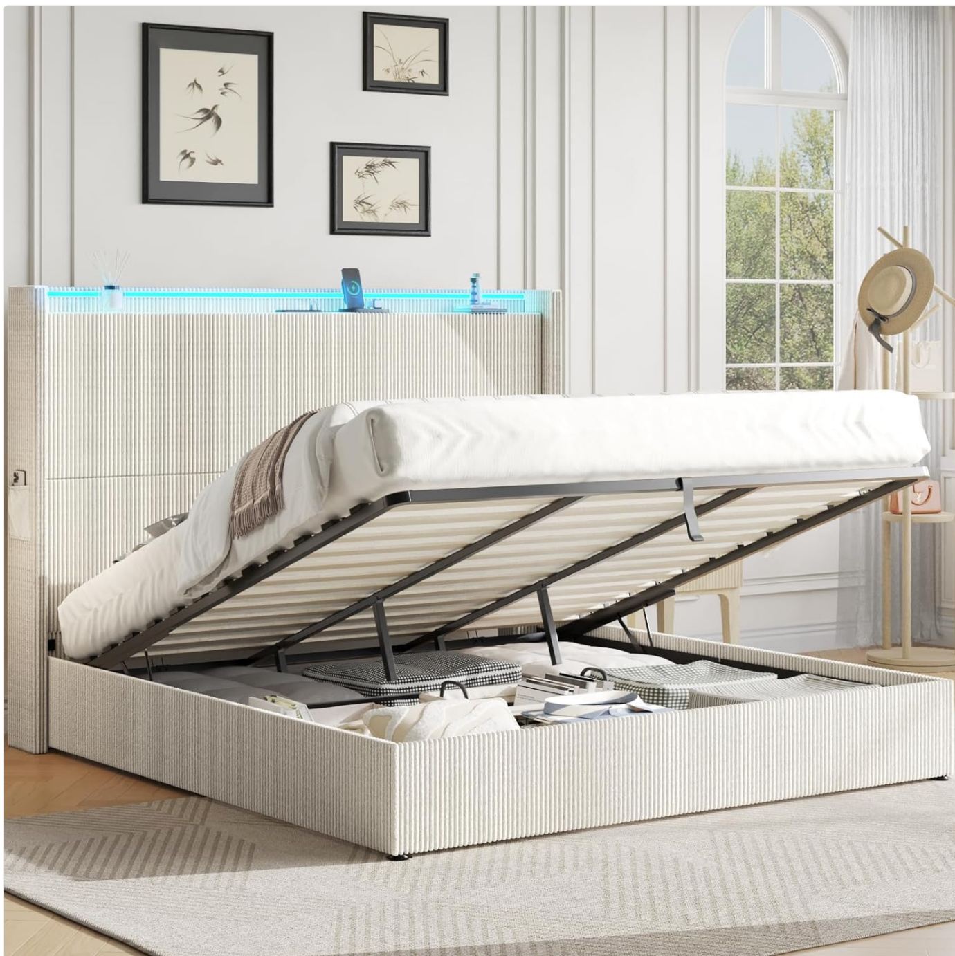
Figure 1.1: Fameill King Size Lift Up Storage Bed Frame with the mattress platform lifted, revealing the spacious storage compartment underneath.