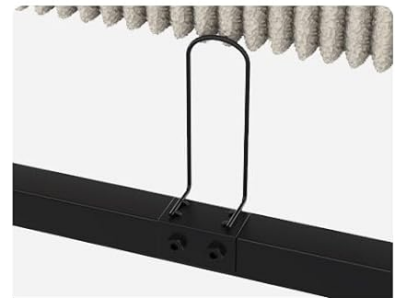
● Anti-Slip Device