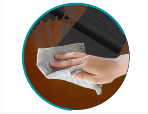
Image: A hand wiping down the bench, demonstrating its easy-to-clean surface.