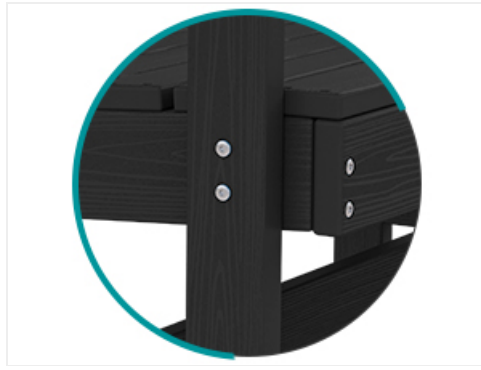
Image: Close-up of 304 stainless steel screws, highlighting the quality hardware.