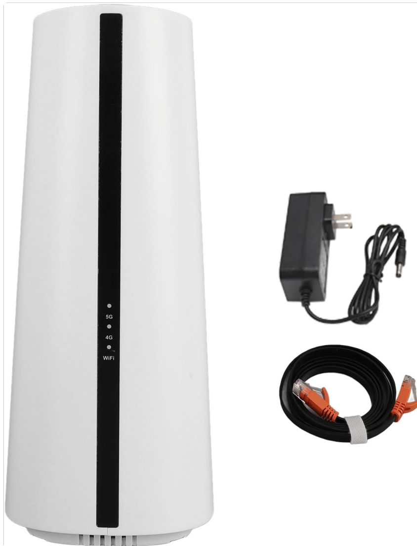
Image: The 5G CPE Router shown alongside its power adapter and an Ethernet network cable, illustrating the complete package contents.