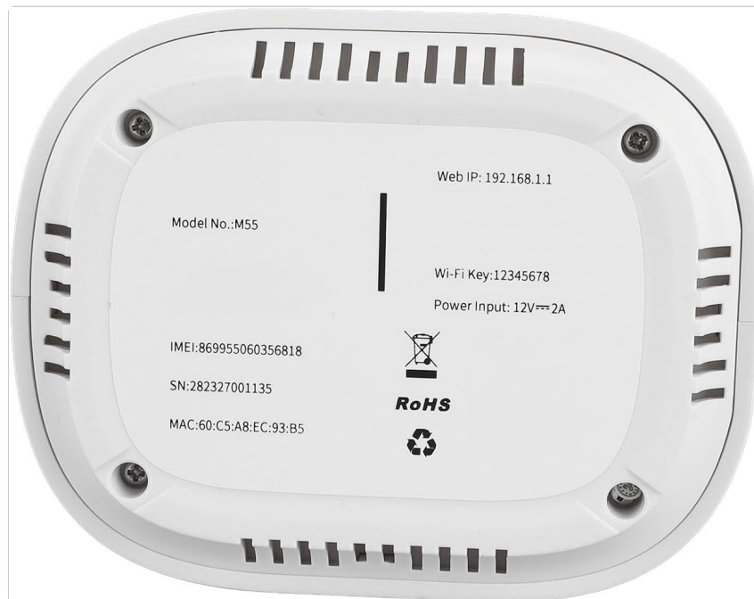
Image: The bottom label of the 5G CPE Router, displaying important information such as Model No.: M55, Web IP: 192.168.1.1, and Wi-Fi Key: 12345678.