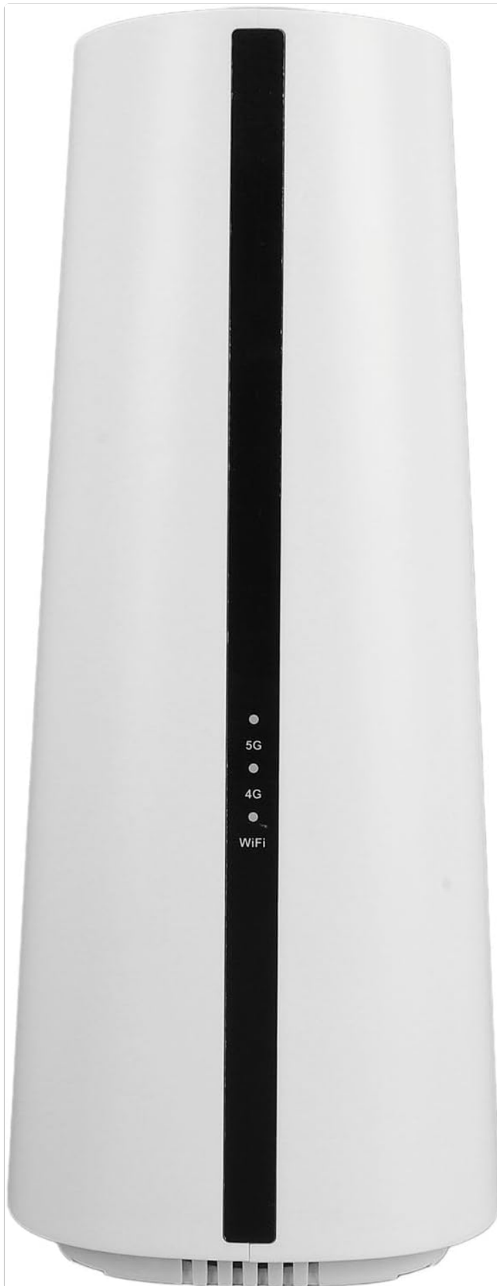
Image: A clear front view of the 5G CPE Router, highlighting the 5G, 4G, and WiFi indicator lights.