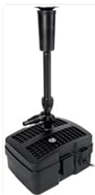
Figure 2: Example of the compatible Anbull CUF-6005 Pond Filter Pump.

These replacement filter sponges are specifically compatible with the Anbull CUF-6005 Pond Filter Pump 925gal/50w 660GPH . They are designed as a direct replacement for the original filter media in this model. While they can be cut to fit other systems, optimal performance is ensured when used with the specified Anbull CUF-6005 pump.