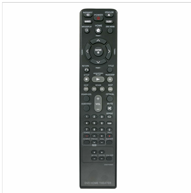
Image: Front view of the remote control, displaying the layout of all control buttons.

The remote control features standard buttons for controlling your compatible LG DVD Receiver or Home Theater System. Refer to your LG device's original manual for specific functions of each button.