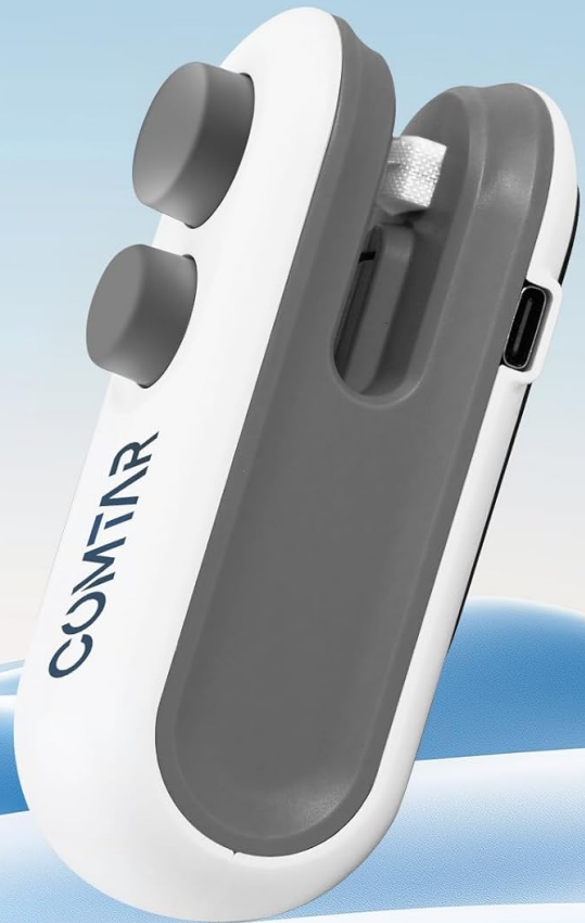
Figure 4: Illustration of using the cutting function to open a bag.