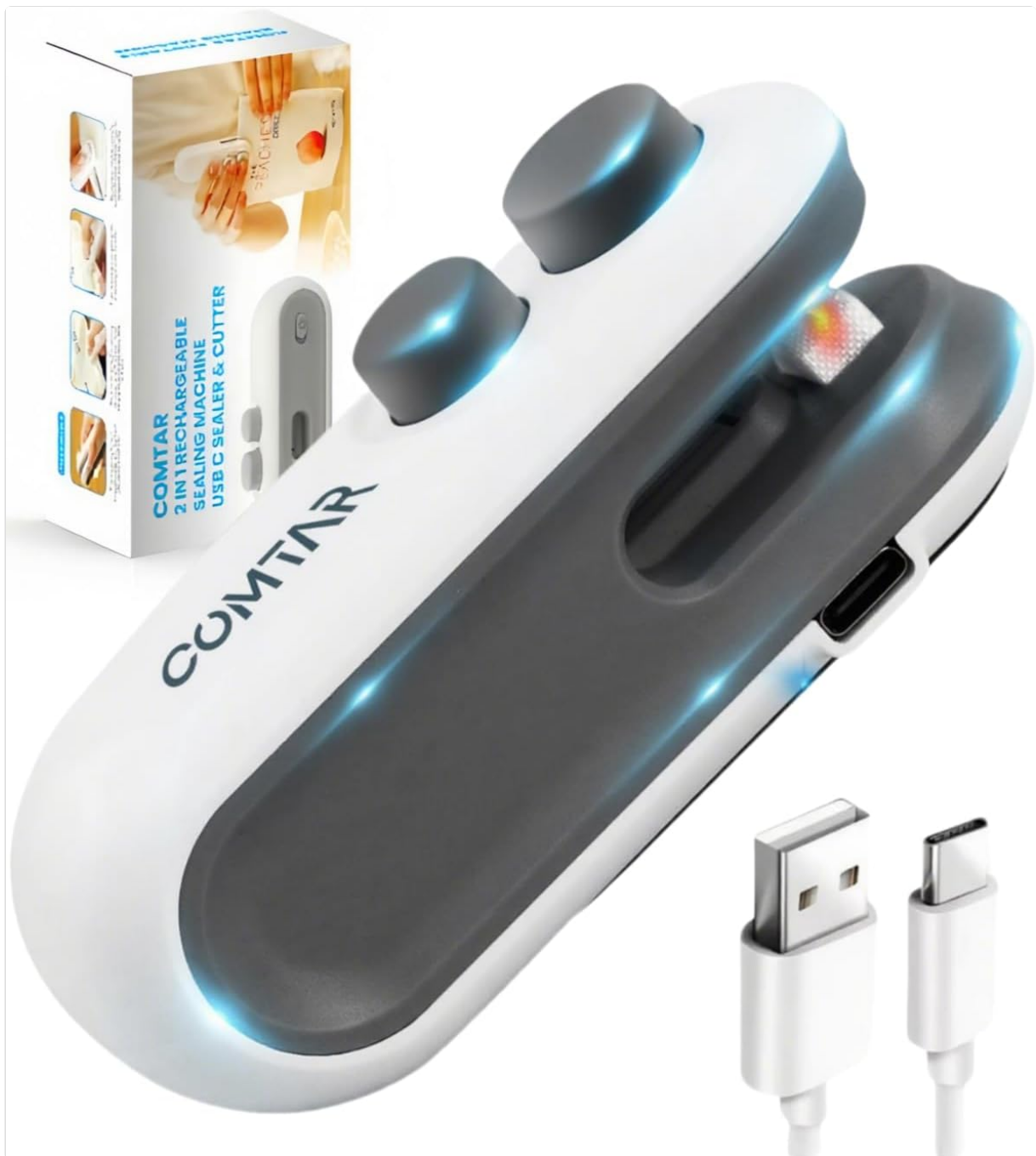
Figure 1: The COMTAR Mini Bag Sealer and Cutter, shown with its USB-C charging cable and product packaging.