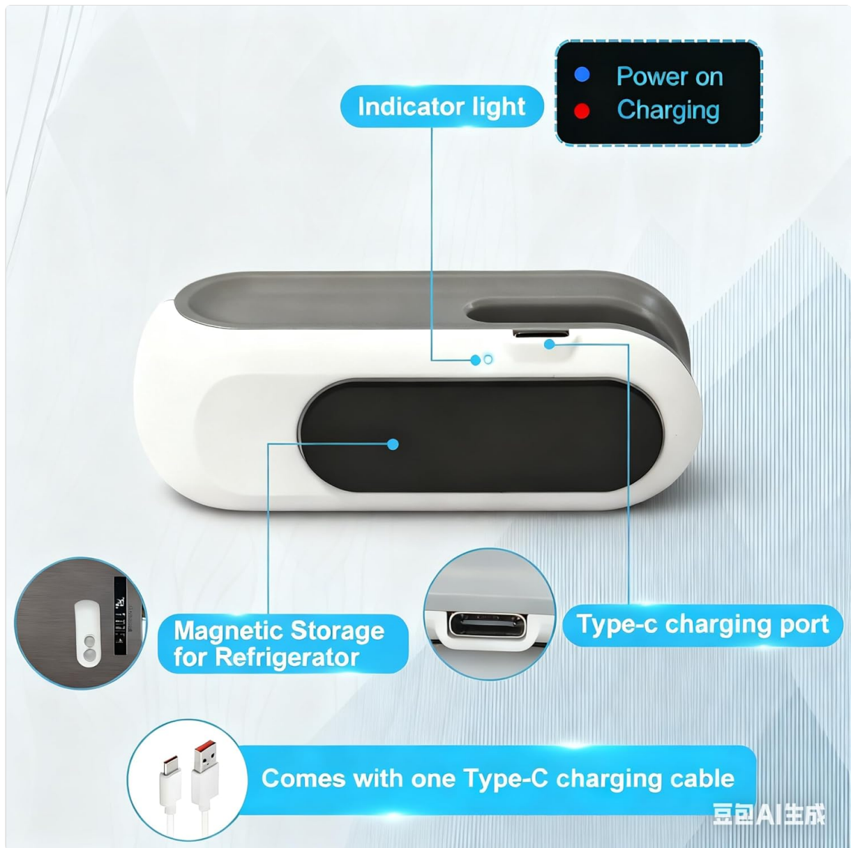
Figure 2: Detail of the USB-C charging port and indicator light on the COMTAR Mini Bag Sealer.