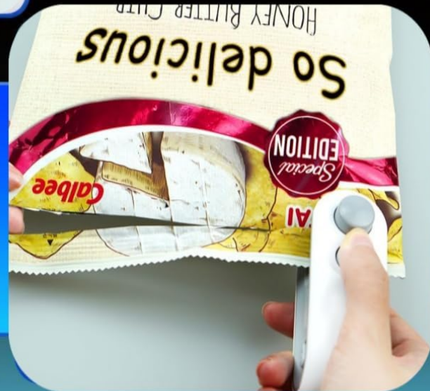
Figure 3: Step-by-step illustration of using the sealing function on a bag.

Your browser does not support the video tag.