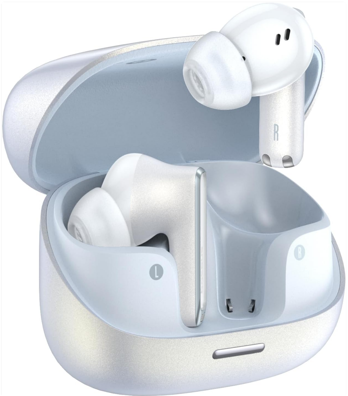
Image: The Baseus Bowie M2s Pro earbuds are shown resting in their open charging case, highlighting their compact and sleek design.