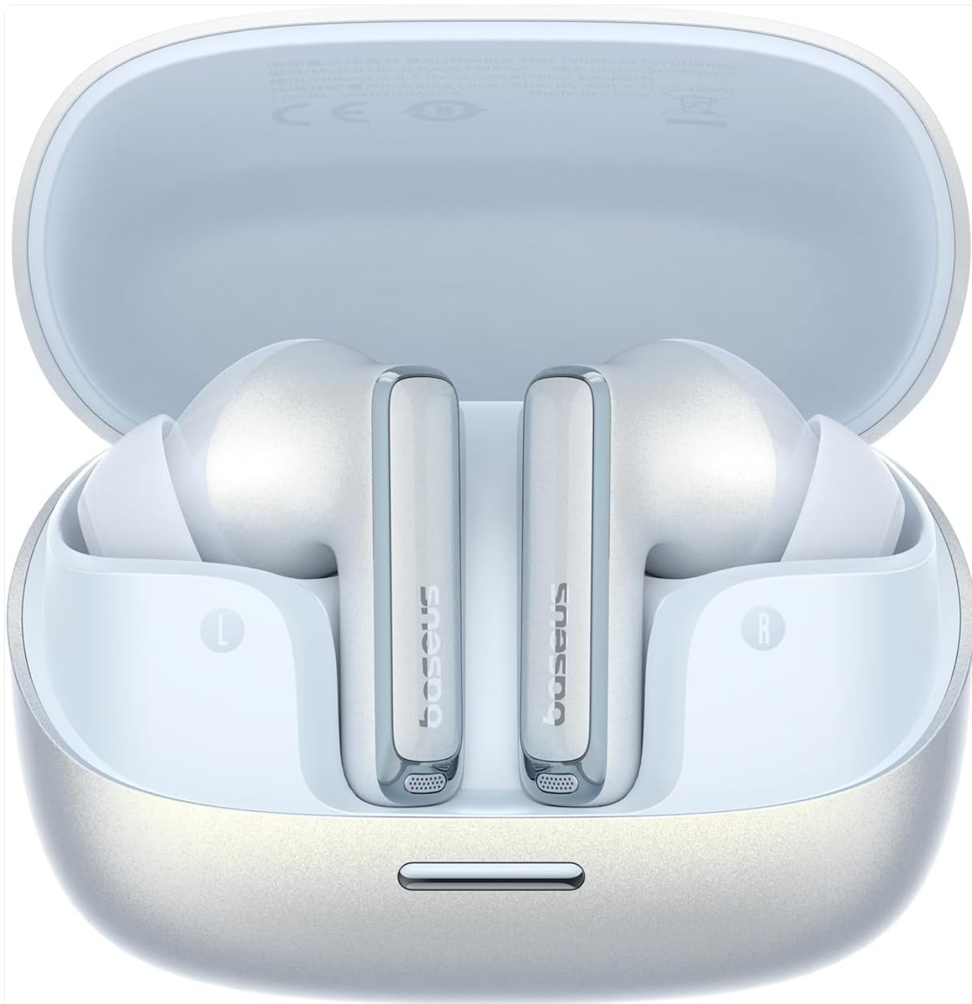
Image: The Baseus Bowie M2s Pro earbuds are securely placed within their charging case, ready for charging or storage.